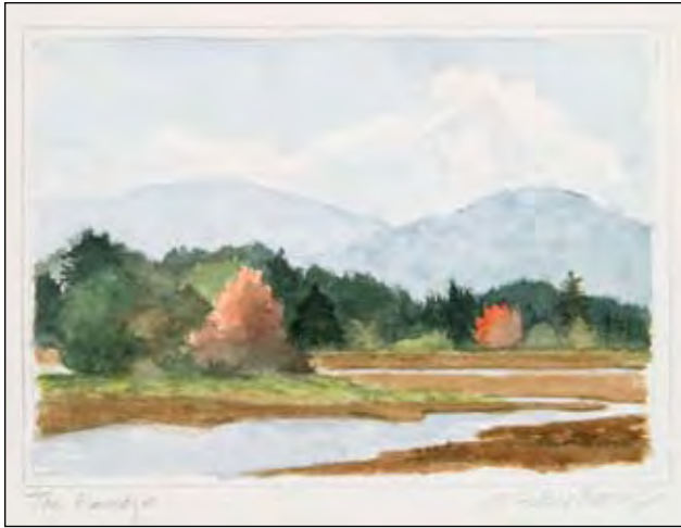
The Flowage, 2005 • Maine Watercolor • 4 x 5 ½" MR68