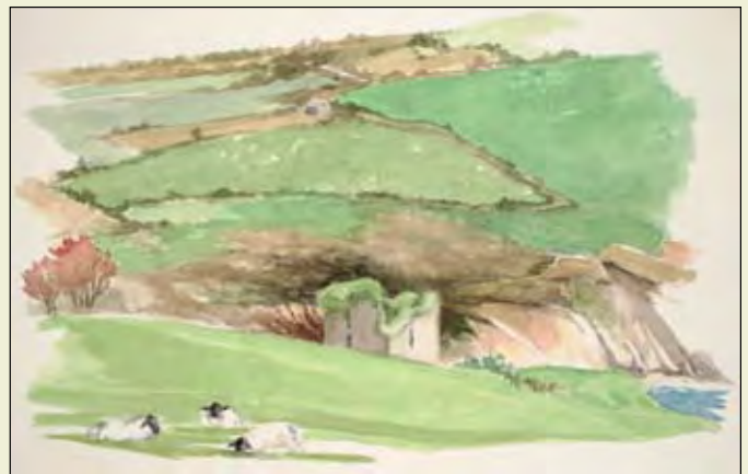
Minard Castle, 2006 • Ireland Watercolor • 6 x 9 1/2" MR111