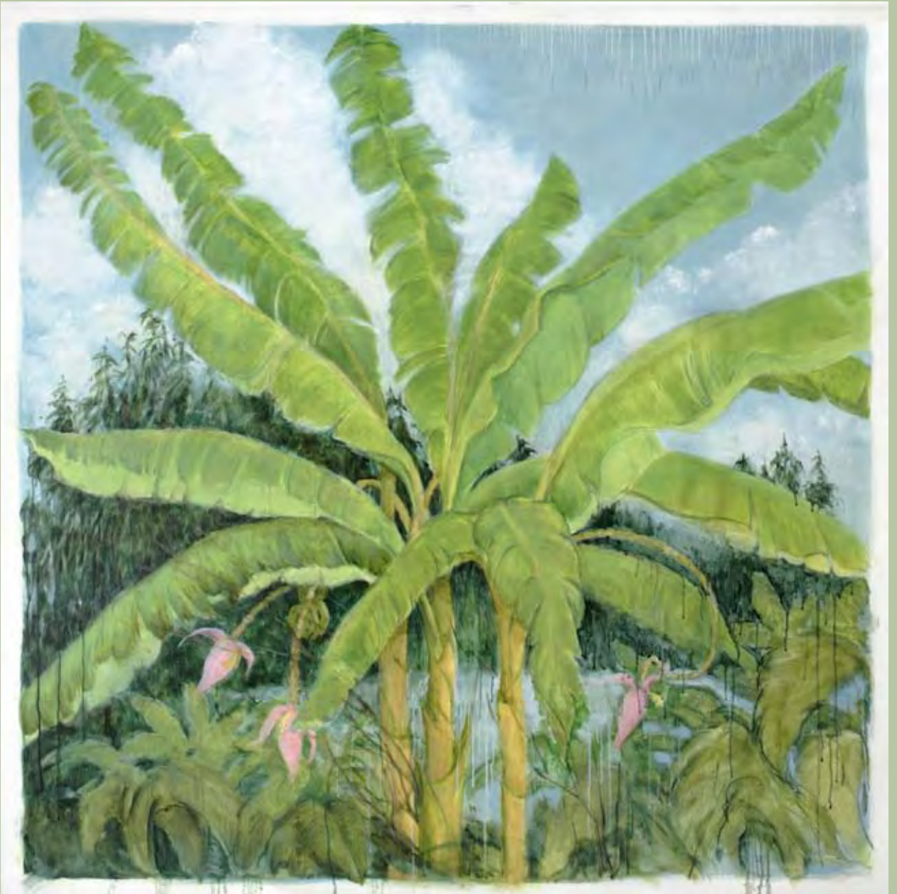
Bayou Banana, 2005-07 • Louisiana Oil on Linen • 48 x 48" MR89