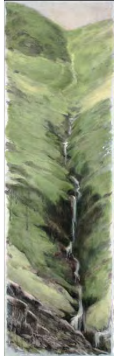
Anascaul Falls, 2006 • Ireland Oil on Linen • 32 x 10" MR102