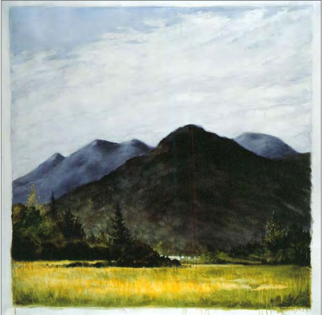
Back of Bigelow, 2001 • Maine Oil on Canvas • 56 x 56" MR78