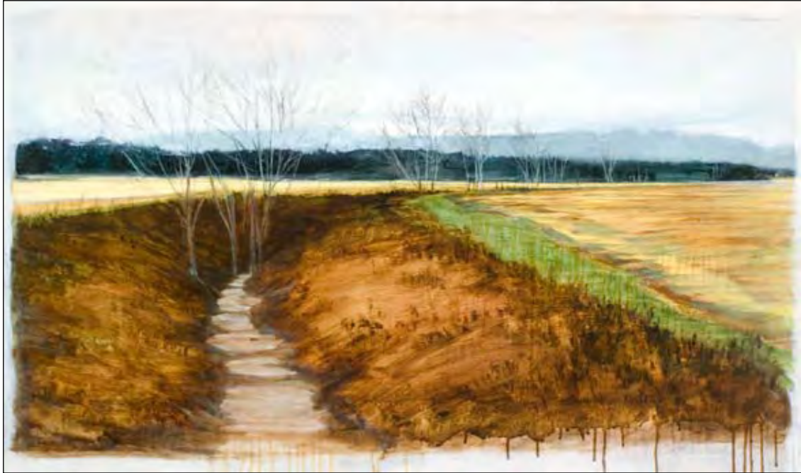
Dresden Mills, 2005 • Maine Oil on Linen • 24 x 40" MR79