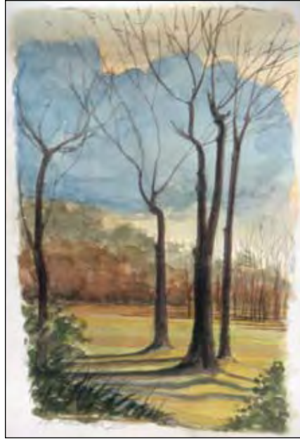
Mercy, 2005 • Louisiana Watercolor • 9 x 6" MR98