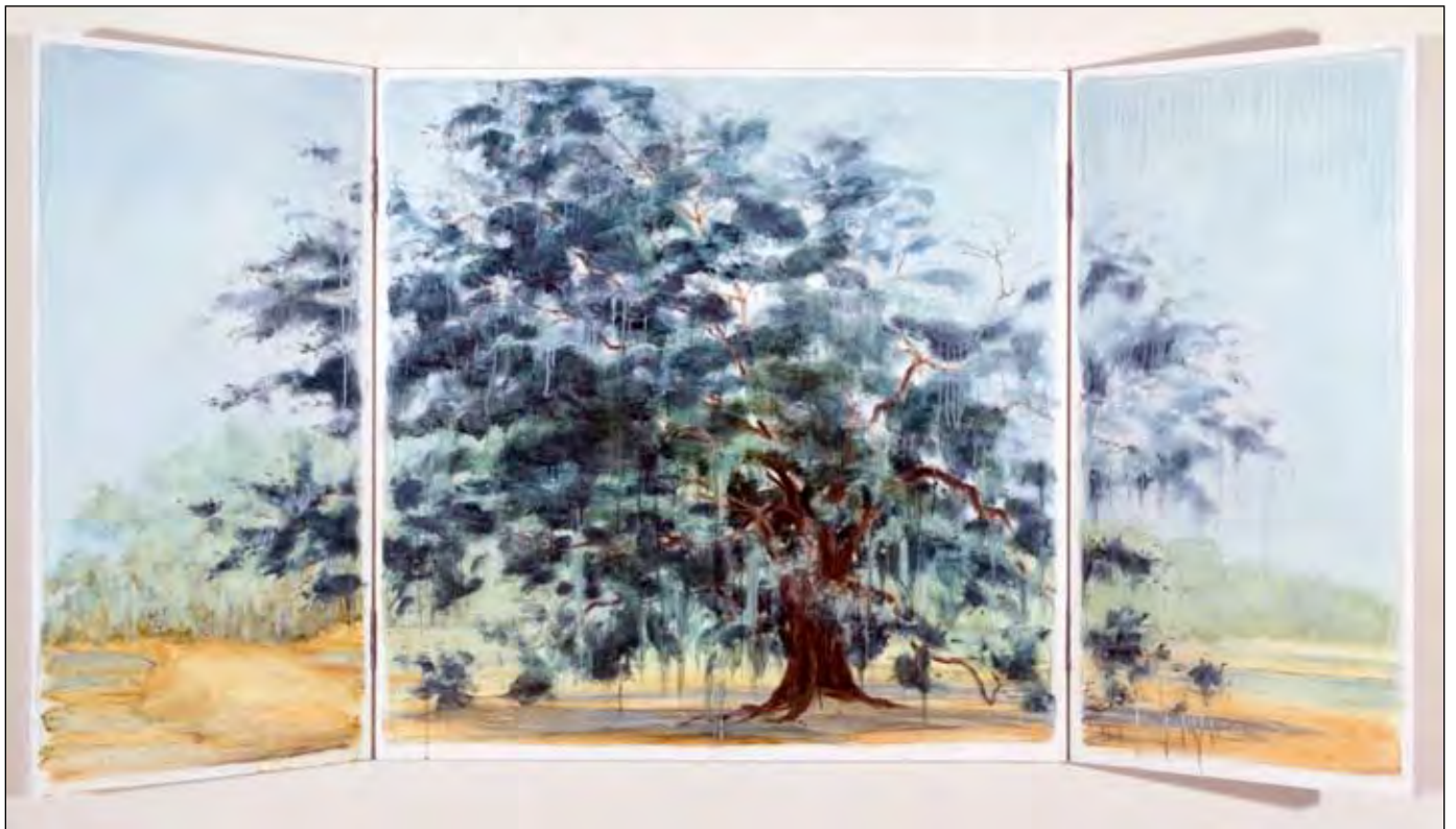
Oak Alley Triptych, 2005 • Louisiana Oil on Hinged Wood Panels • 72 x 72” opened MR86