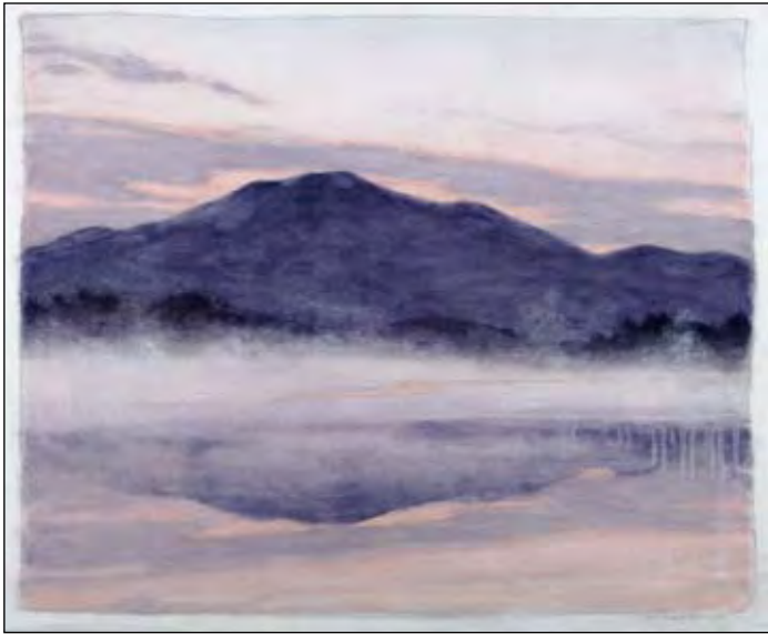
Morning Fog, 2005 • Maine Oil on Linen • 20 x 24" MR64