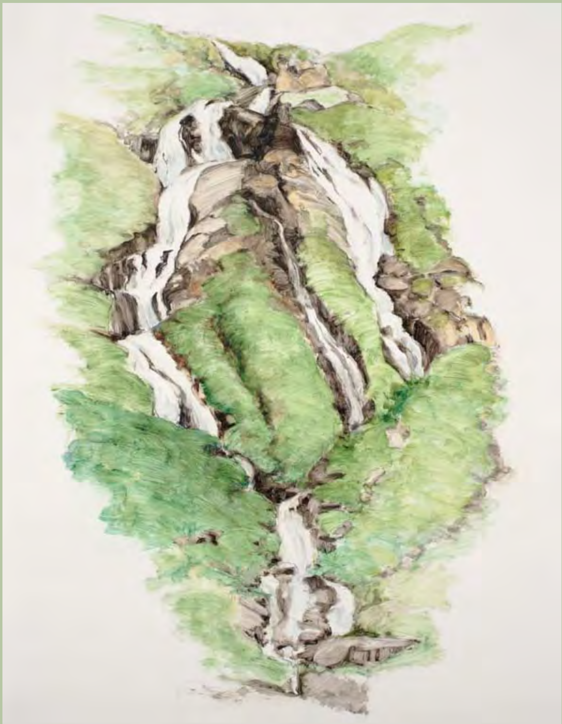
Dingle Falls, 2006-07 • Ireland Oil on Yupo • 26 x 20" MR105