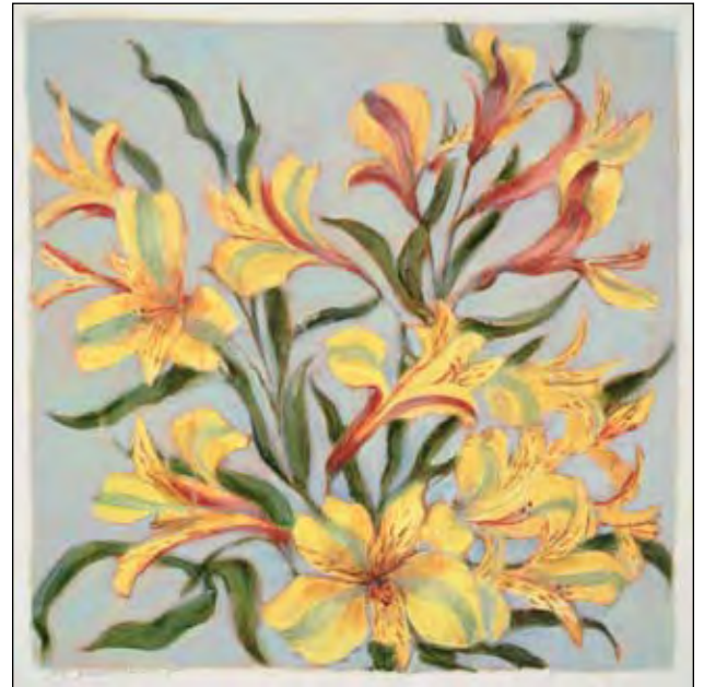
Alstroemeria, 2005-07 • Louisiana Oil on Linen • 12 x 12" MR95