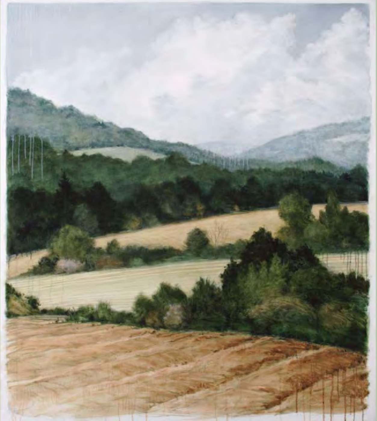
Back Falls Fields, 2005 • Maine Oil on Linen • 54 x 48" MR76