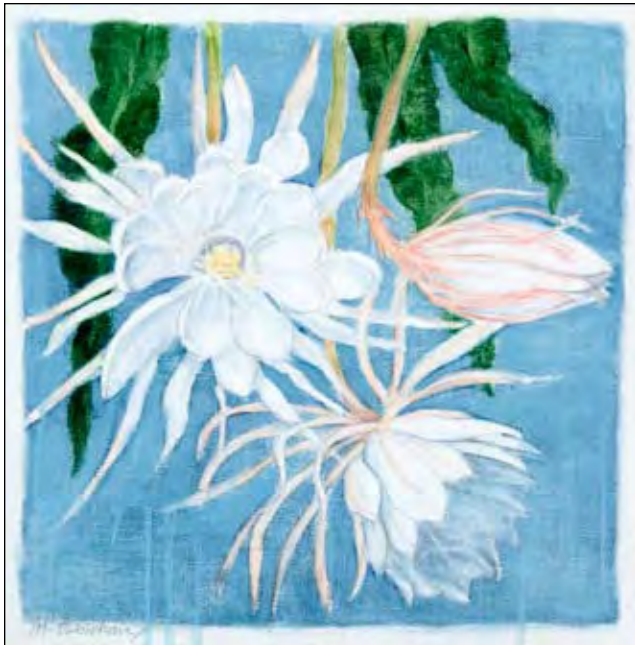
Cereus, 2005 • Louisiana Oil on Linen • 12 x 12" MR90