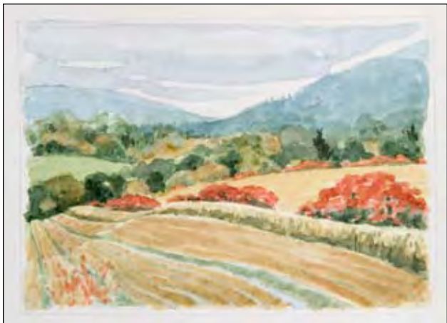
Sumac, 2005 • Maine Watercolor • 4 x 5 ½" MR71