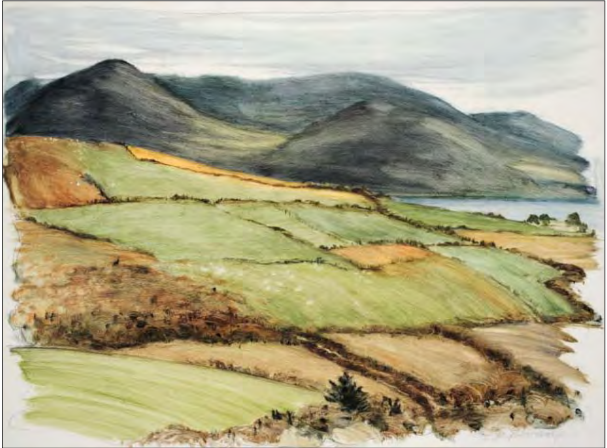
Dingle Bay, 2000 • Ireland Oil on Birch Panel • 12 x 16" MR109