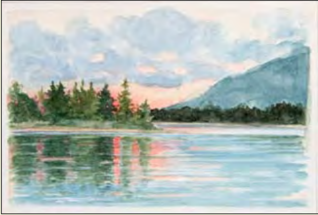
Sunset on the Lake, 2005 • Maine Watercolor • 4 x 6" MR70