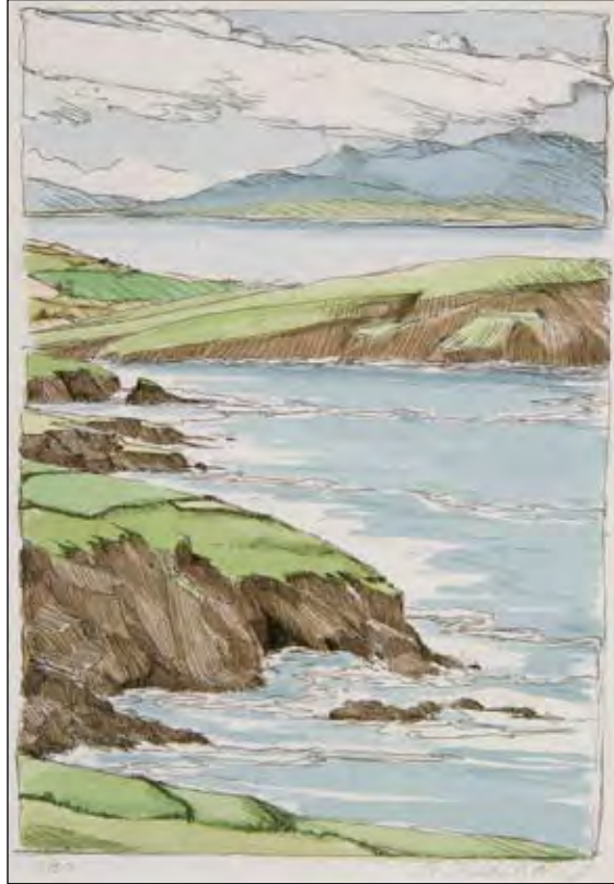
West Minard, County Kerry, 2001 • Ireland Hand Colored Etching • 9 ¼ x 7" MR112