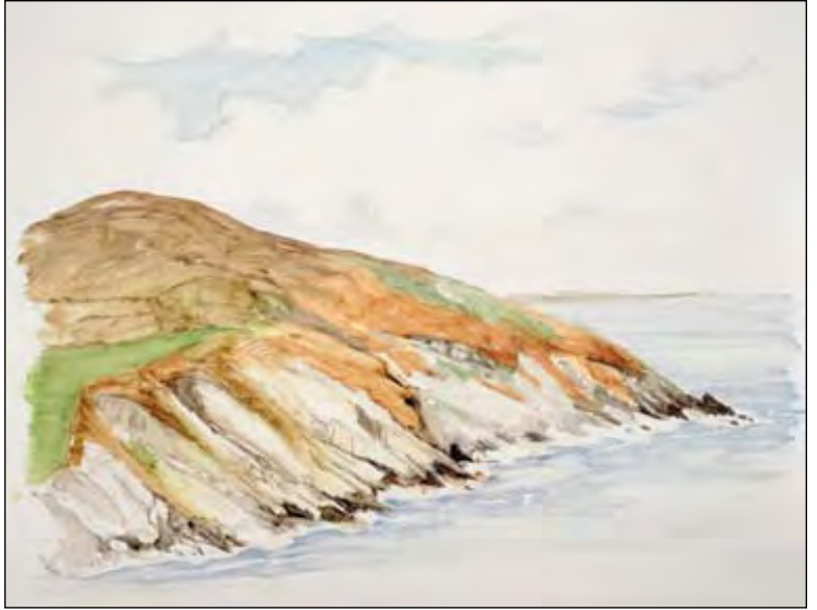
Acres Mountain, 2006-07 • Ireland Oil on Yupo • 16 x 20" MR106