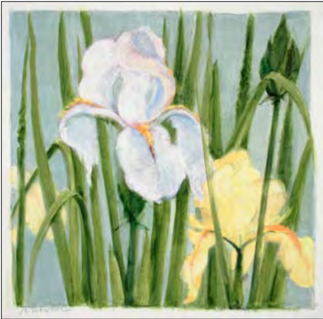
Dutch Iris, 2005-07 • Louisiana Oil on Linen • 12 x 12" MR94