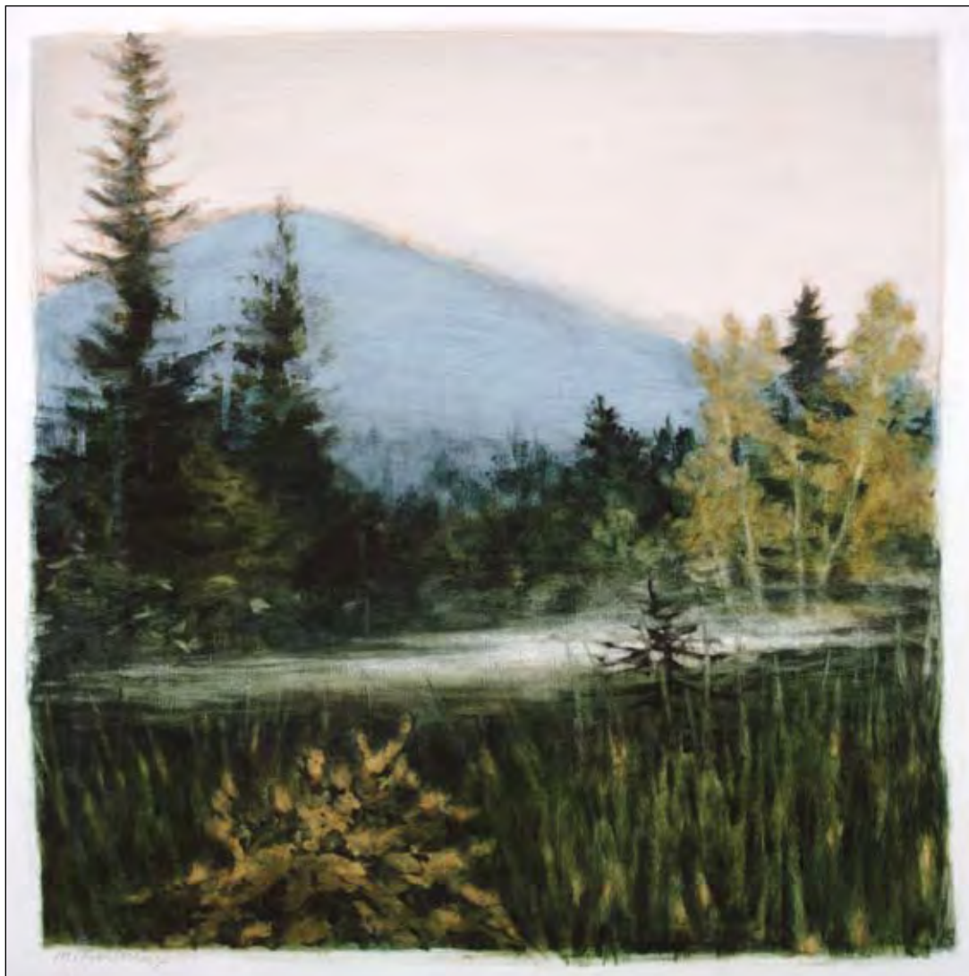
Ground Fog, 2005 • Maine Oil on Linen • 18 x 18" MR83