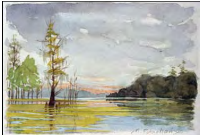
Spillway, 2005 • Louisiana Watercolor • 6 x 9" MR99