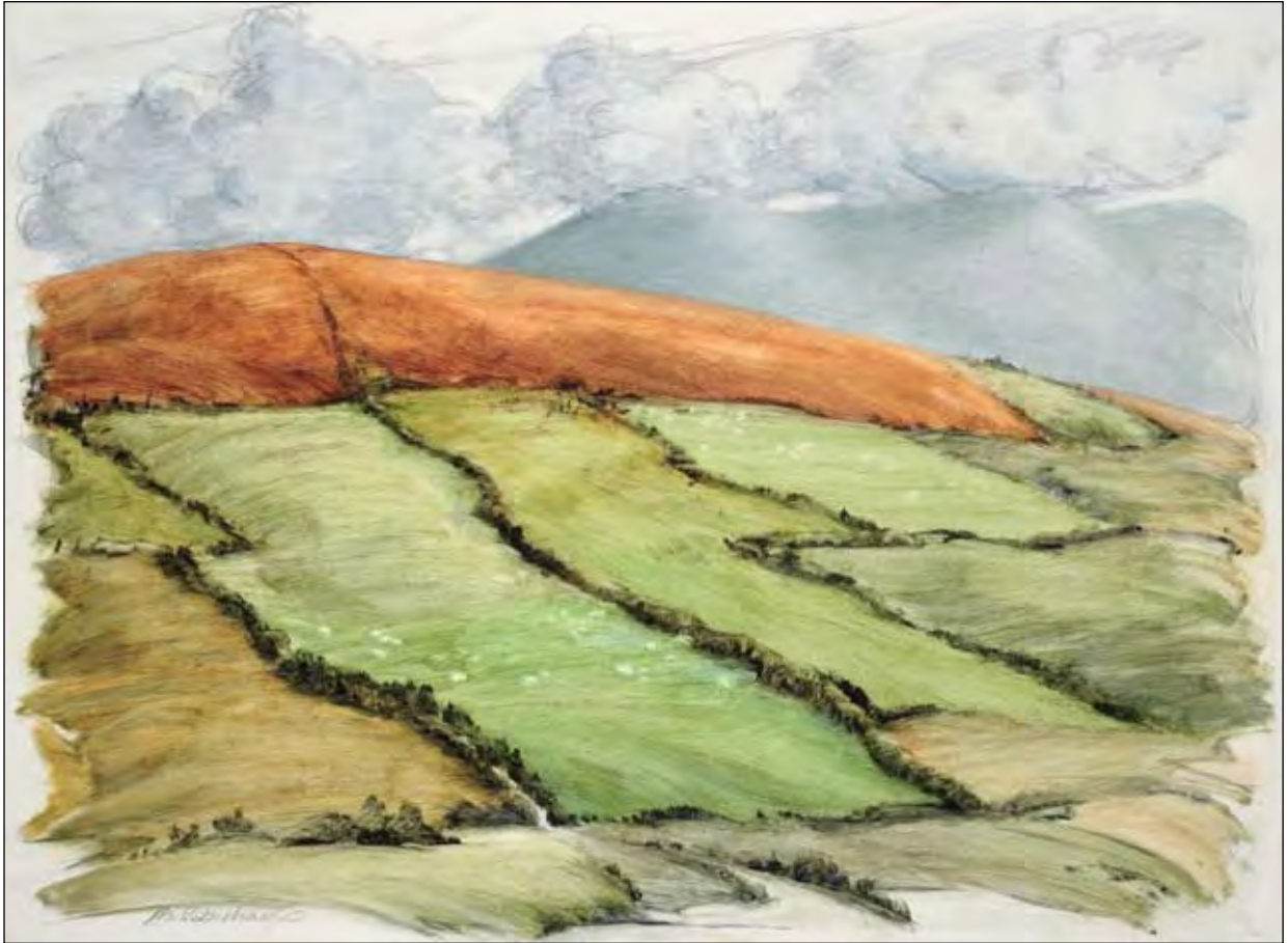
Glan Mountain, 2000 • Ireland Oil on Birch Panel • 12 x 16" MR110