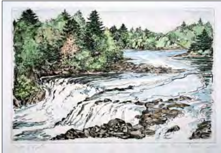
Grand Falls, 2006 • Maine Hand Colored Etching • 6 x 9" MR85