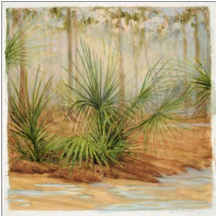
Palmetto, 2005-07 • Louisiana Oil on Linen • 18 x 18" MR91