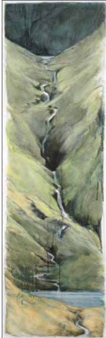
Conarch Falls, 2006 • Ireland Oil on Linen • 32 x 10" MR103