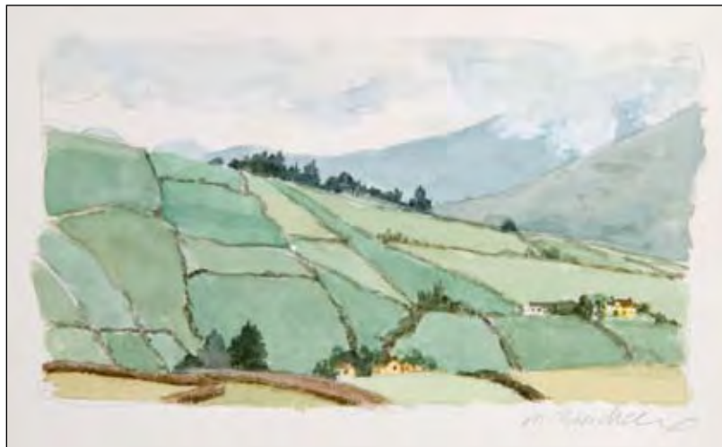
Minard, County Kerry, 2005 • Ireland Watercolor • 4 x 7" MR74