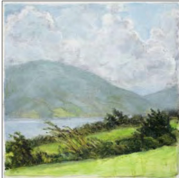
Hedgerows, 2006 • Ireland Oil on Linen • 8 x 8" MR108