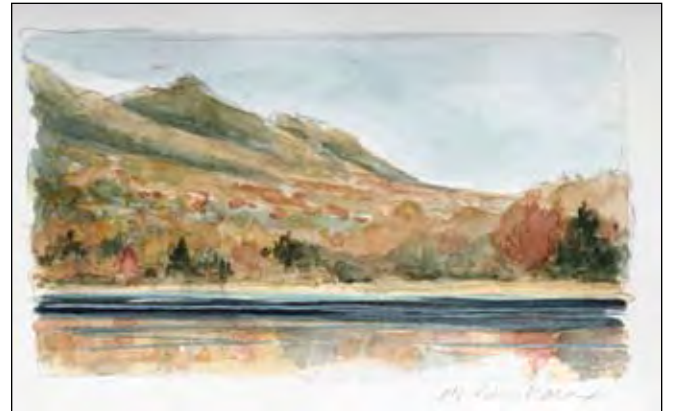
Bigelow, October, 2005 • Maine Watercolor • 3 ½ x 6" MR84