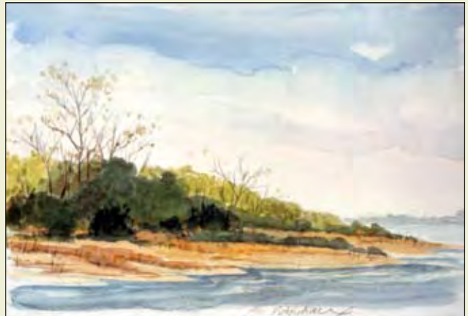
Lafourche, 2005 • Louisiana Watercolor • 6 x 9" MR101