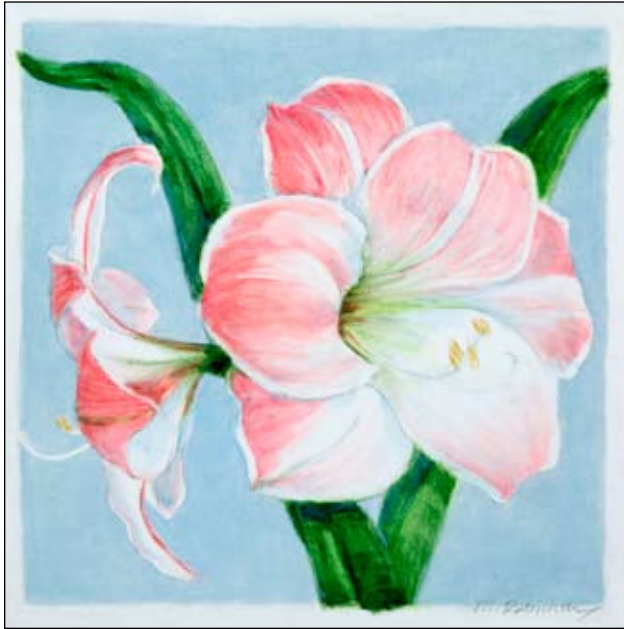
Amaryllis, 2005 • Louisiana Oil on Linen • 12 x 12" MR92