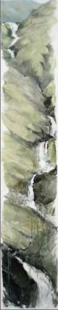
Kerry Falls, 2006 • Ireland Oil on Linen • 38 x 8" MR104