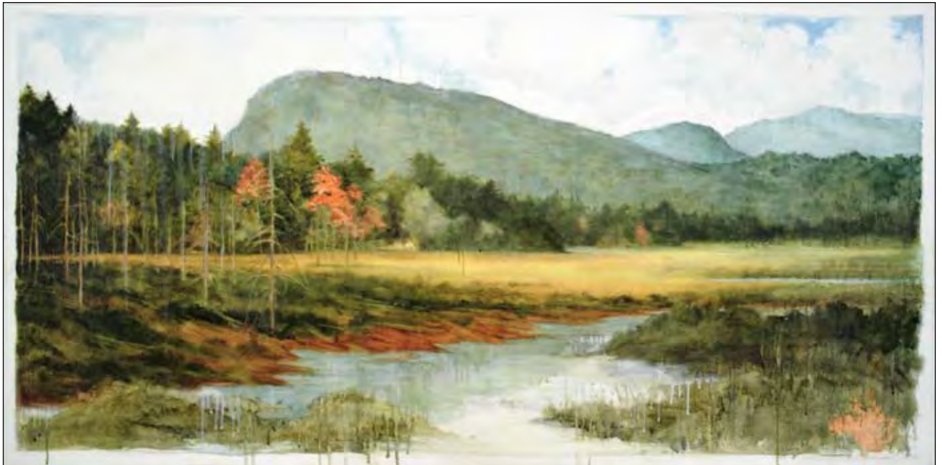
Picked Chicken Hill, 2006-07 • Maine Oil on Linen • 28 x 56" MR82