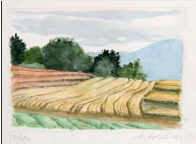
Fields, 200 • Maine Watercolor • 4 x 5 ½" MR69