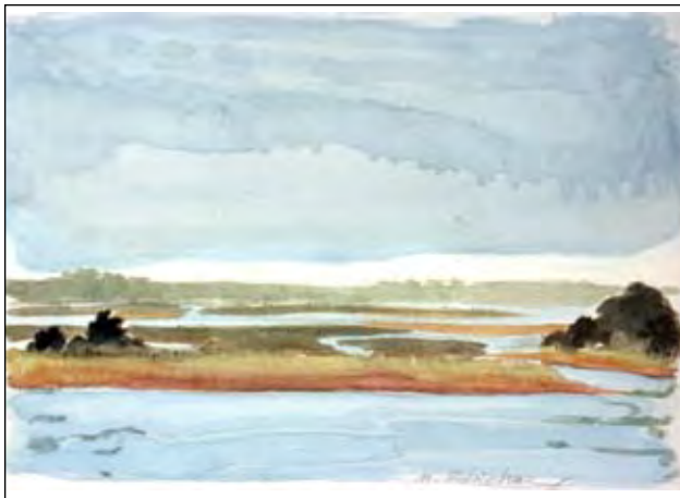
Golden Meadow, 2005 • Louisiana Watercolor • 6 x 9" MR100