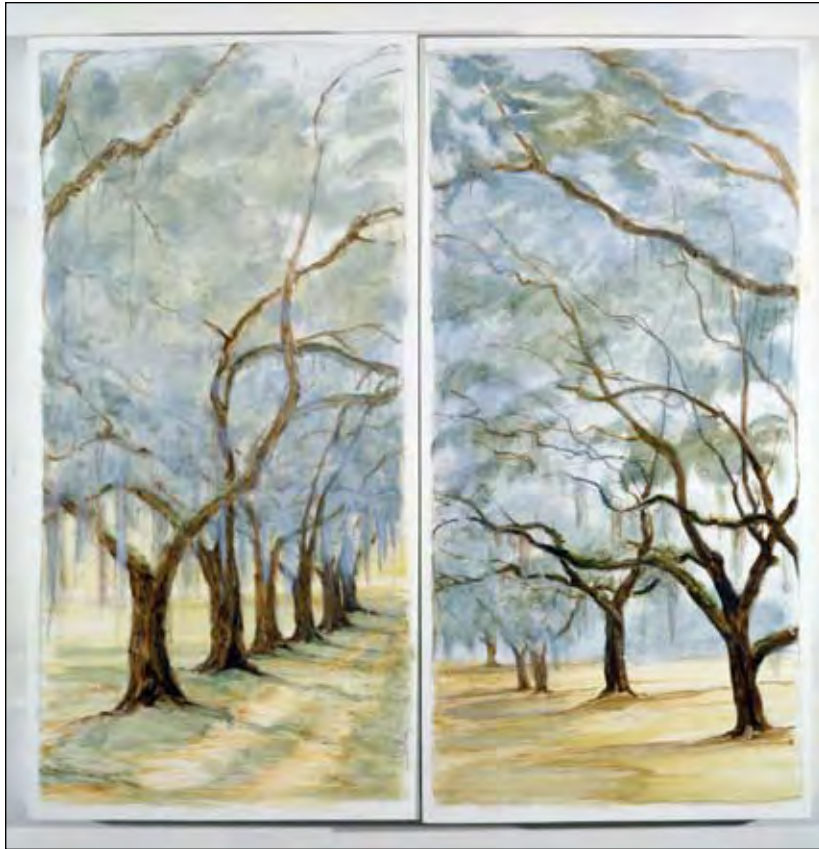
Oak Alley Triptych, 2005 • Louisiana Oil on Hinged Wood Panels • 36 x 72” closed MR86