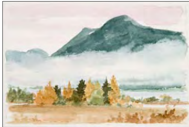
Morning Fog, 2005 • Maine Watercolor • 4 x 6" MR66