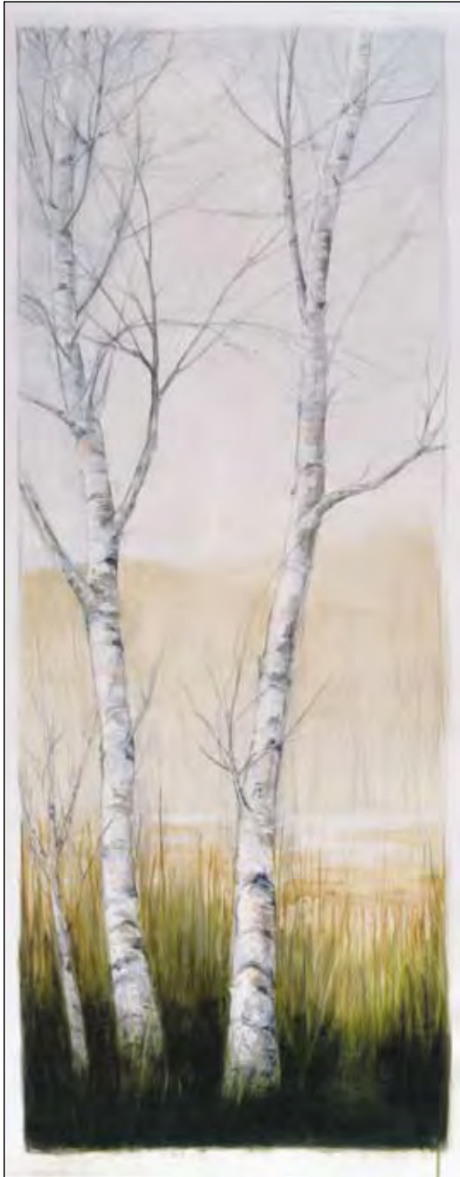
Birch, 2001 • Maine Oil on Canvas • 60 x 24" MR80