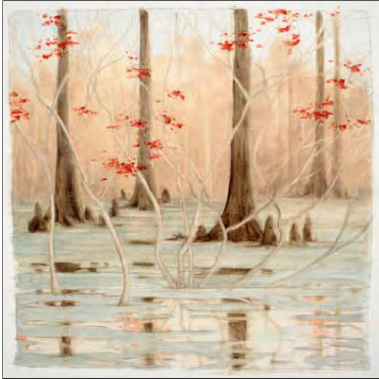
Swamp Maple, 2005-07 • Louisiana Oil on Linen • 18 x 18" MR93