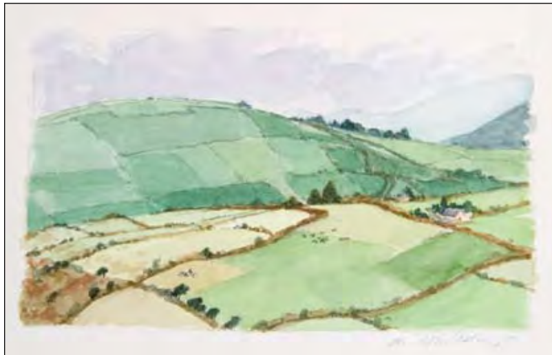
Valley of the Free, County Kerry, 2005 • Ireland Watercolor • 4 ¾ x 8" MR73