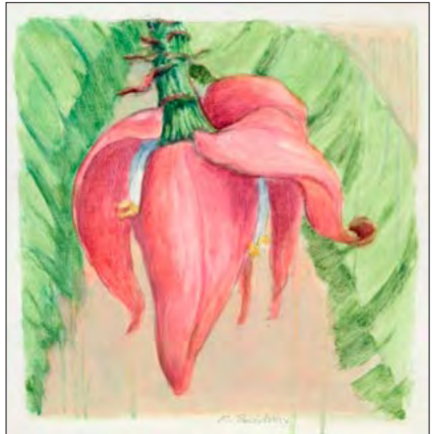
Banana, 2005 • Louisiana Oil on Linen • 12 x 12" MR88