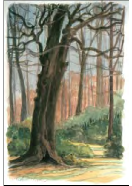
Ardenwood, 2005 • Louisiana Watercolor • 9 x 6" MR96