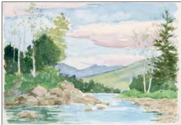
The River, 2005 • Maine Watercolor • 4 x 5 1/2" MR67