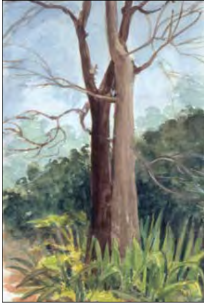
Goodwood, 2005 • Louisiana Watercolor • 9 x 6" MR97