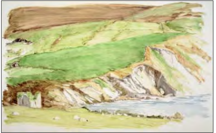
Minard, 2006-07 • Ireland Oil on Yupo • 13 x 20" MR107