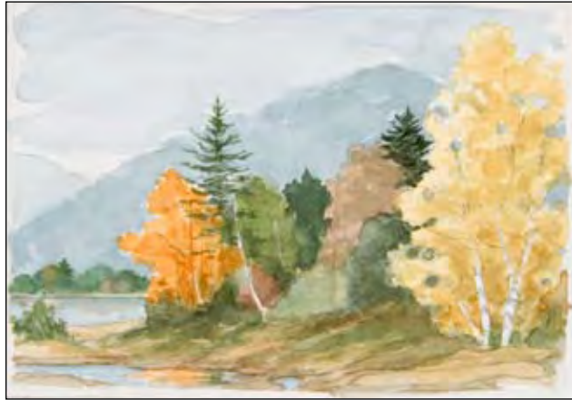
The Point II, 2005 • Maine Watercolor • 4 x 5 1/2" MR65