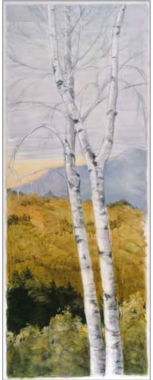
Poplar, 2001 • Maine Oil on Canvas • 60 x 24" MR81