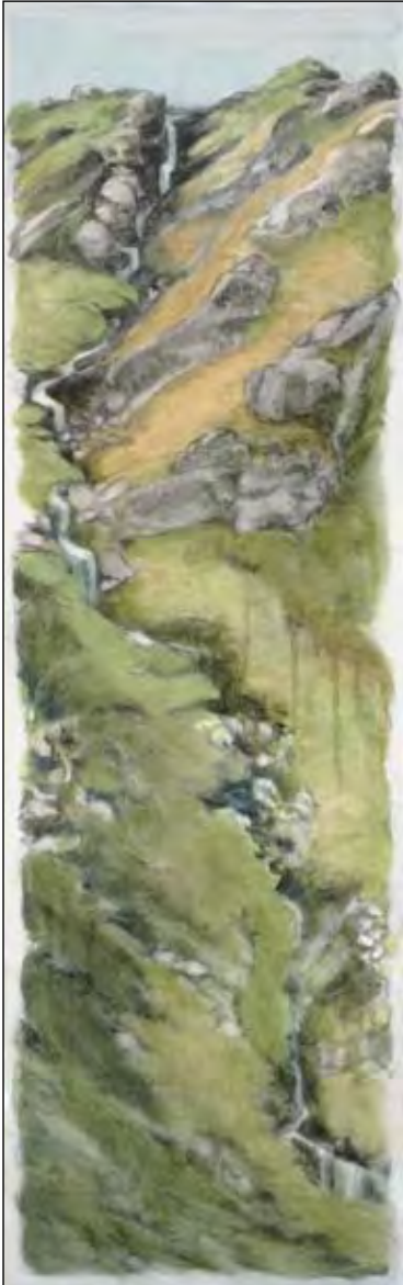
Glanteenassig Falls, 2006 • Ireland Oil on Linen • 32 x 10" MR113