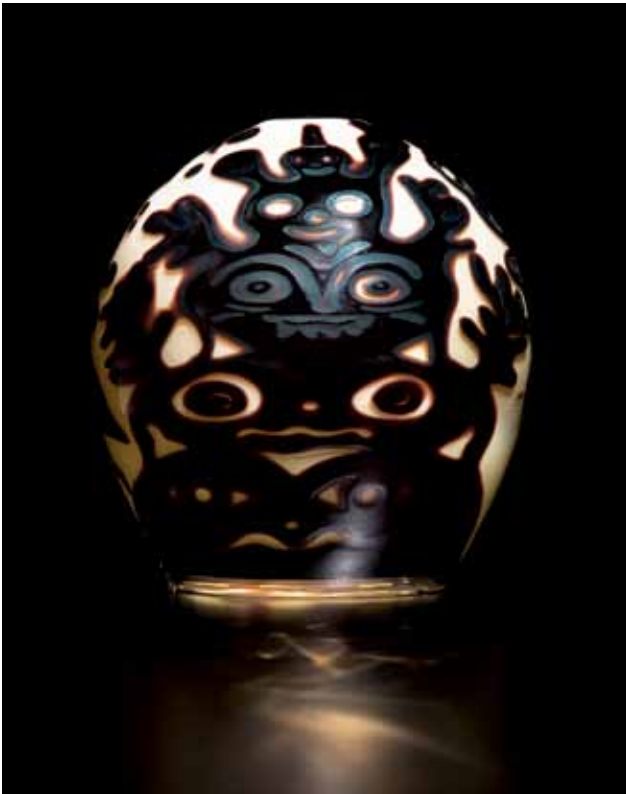
SPIRIT TOWER, BRONZE Blown glass and etched graal sculpture 7.25 x 7 x 7" AD152