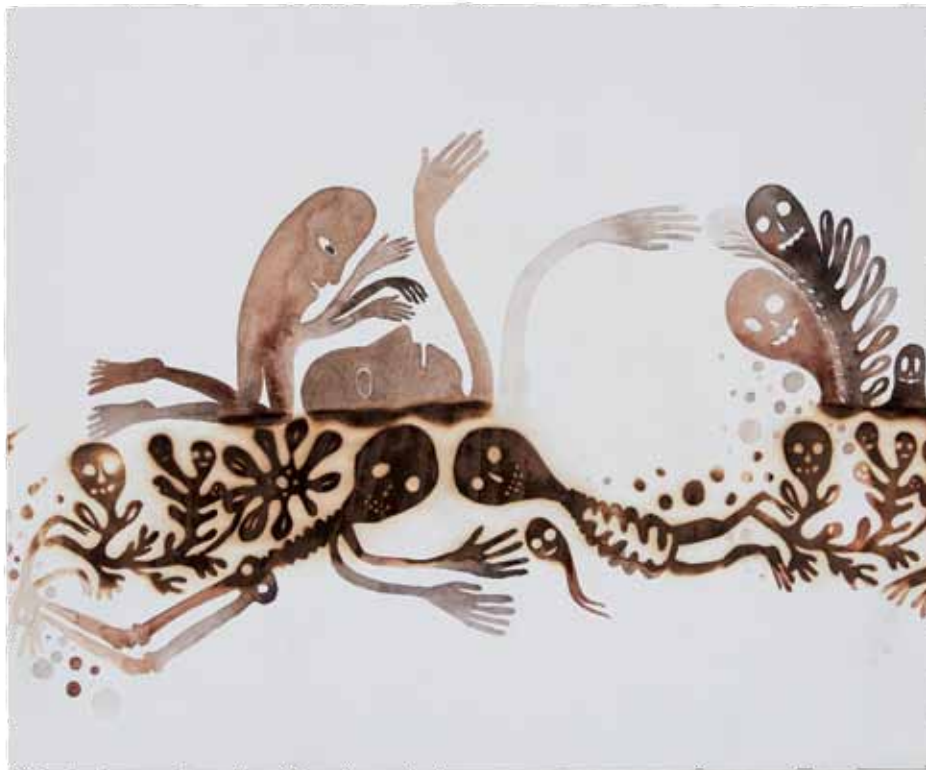
THE SWIM Watercolor painting on pyrovitreography monotype on paper 17 x 20.5" AD174