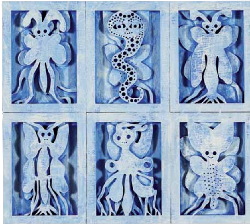
SIX PROTECTORS: BLUE Baltic birch, gesso, and acrylic gouache 11.75 x 13.25 x 1.5" AD166