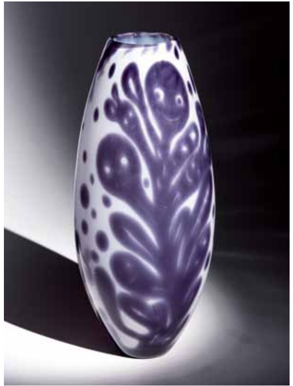
SPIRIT TREE, PURPLE Blown glass and etched graal sculpture 17.75 x 7.5 x 7.5" AD154