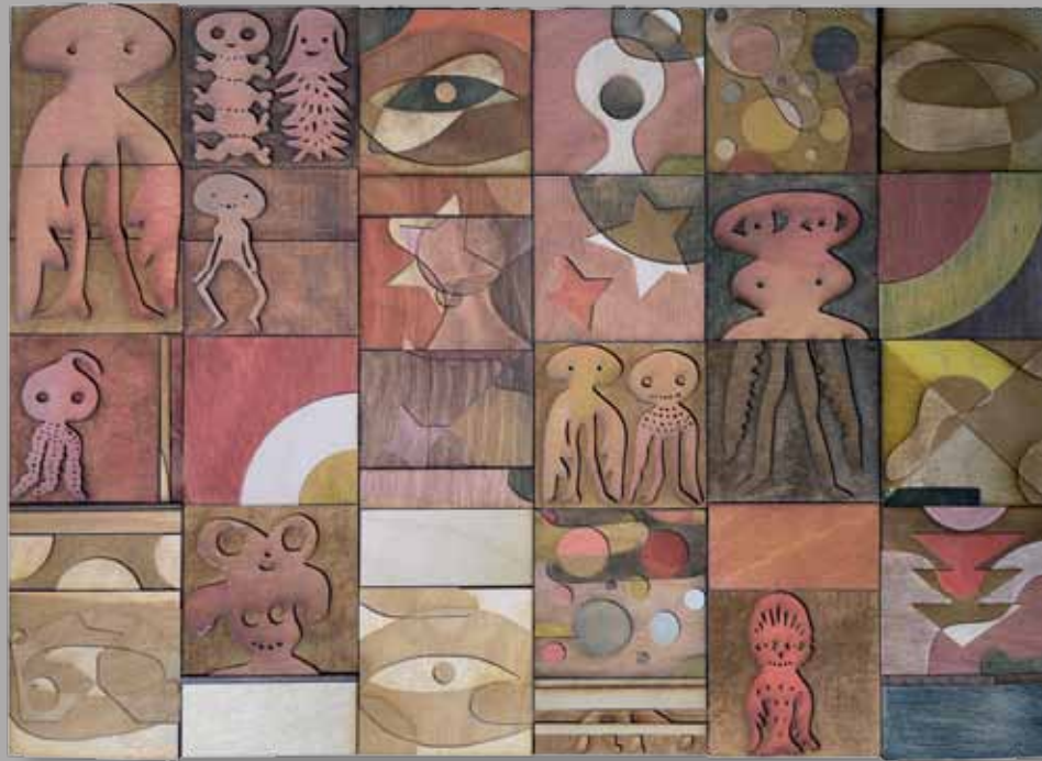
SUMMER CHILDREN Polychrome wood relief 13.5 x 18 x 1.25" AD180