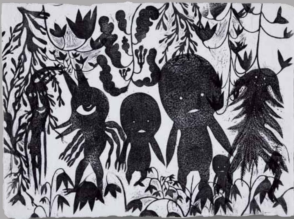
FAIRY TALE FOREST Mokuhanga monotype with sumi ink on paper 18 x 24.25" AD169

ONLINE EVENTS: Please visit www.puckergallery.com for a list of virtual gatherings and events accompanying Unexpected Journey .