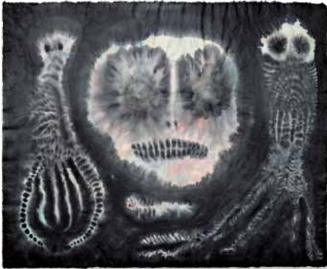
HEAD AND THREE ANGELS Watercolor and ink on handmade Japanese Kitakata paper 16.5 x 20.25" AD159