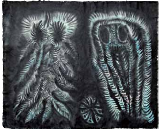
PLAYING BALL Watercolor and ink on handmade Japanese Kitakata paper 16.5 x 20.25" AD158