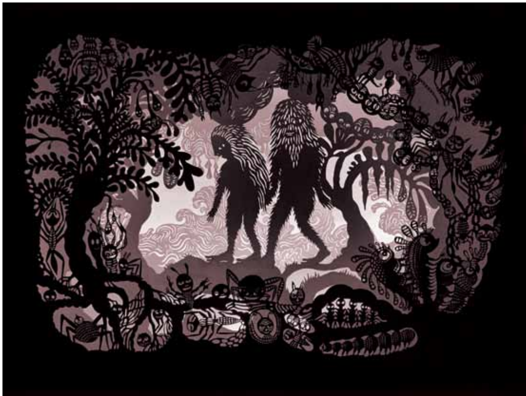
ADAM AND EVE SASQUACH Laser-cut, hand-cut, and hand-sewn paper tunnel book with watercolor wash 22.5 x 30 x 9.5" AD177