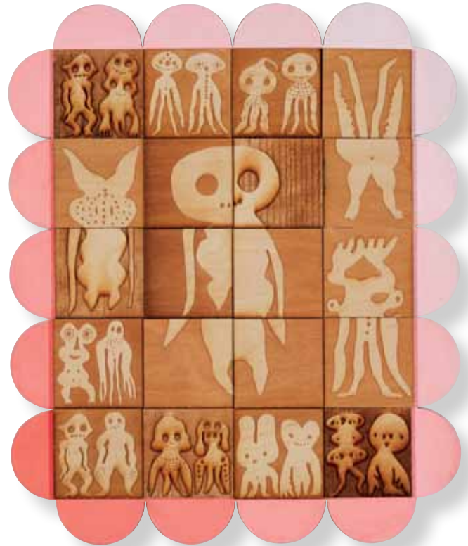
DAY PICNIC Baltic birch and flashe 18 x 15 x 1" AD162