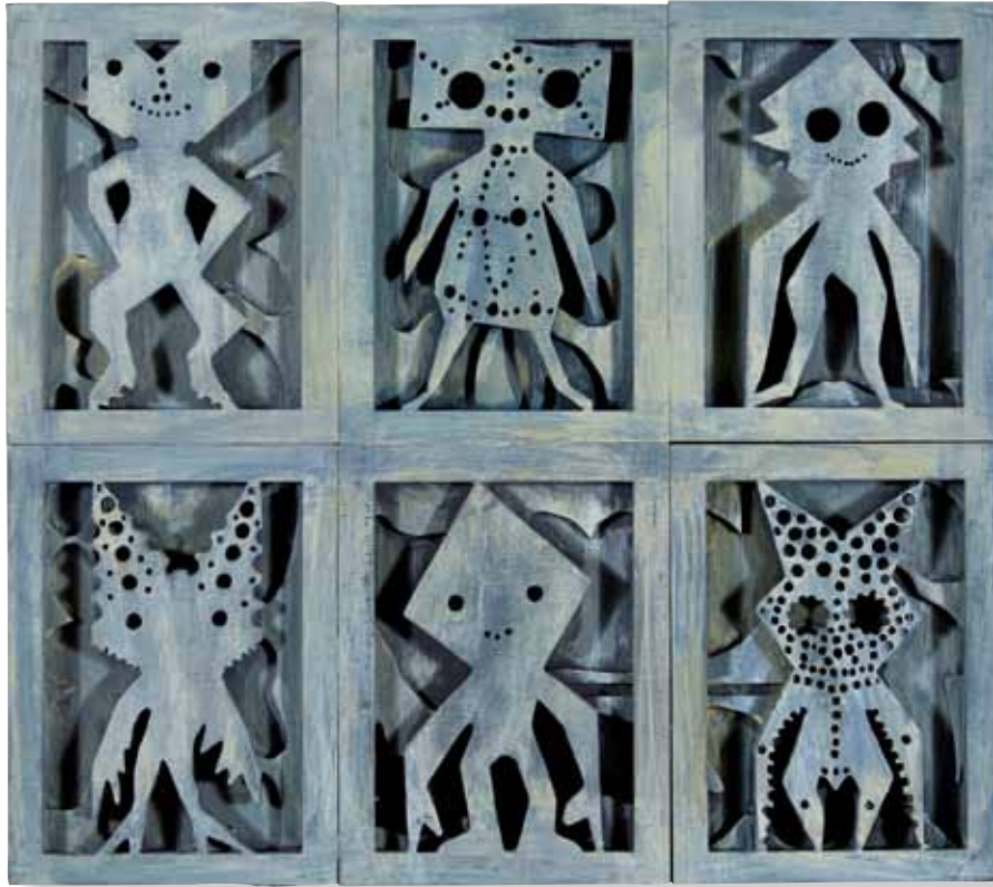
SIX PROTECTORS: GRAY Baltic birch, gesso, and acrylic gouache 11.75 x 13.25 x 1.5" AD164