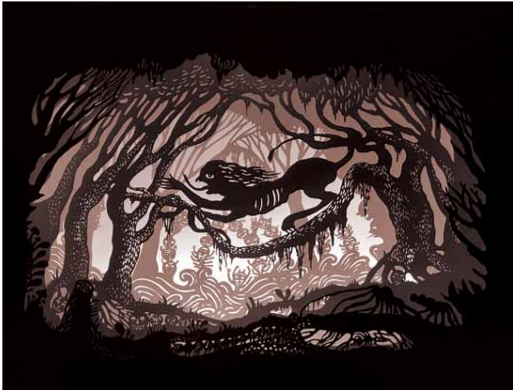
WAMPUS CAT Laser-cut, hand-cut, and hand-sewn paper tunnel book 22.5 x 30 x 9.25" AD178