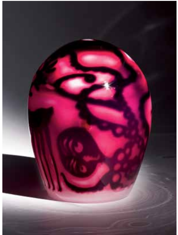
RAVEN, ELK, AND OCTOPUS Blown glass and etched graal sculpture 12.25 x 9.5 x 9.5" AD153