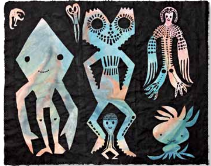
SEVEN ANGELS Watercolor and ink on handmade Japanese Kitakata paper 16.5 x 20.25" AD160