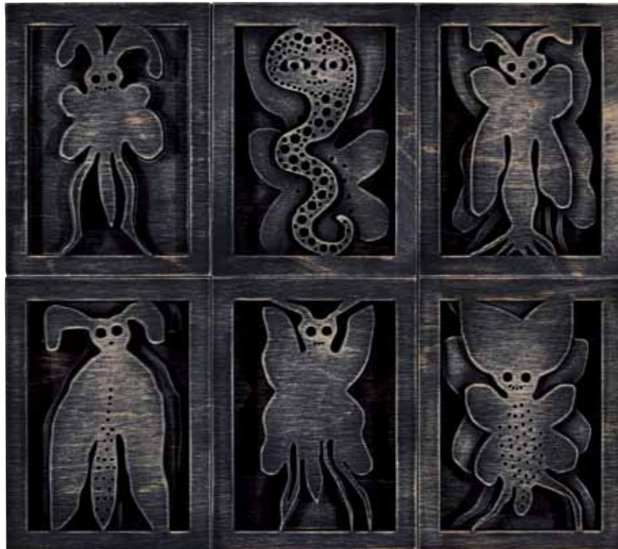
SIX PROTECTORS: BLACK Baltic birch and sumi ink 11.75 x 13.25 x 1.5" AD165