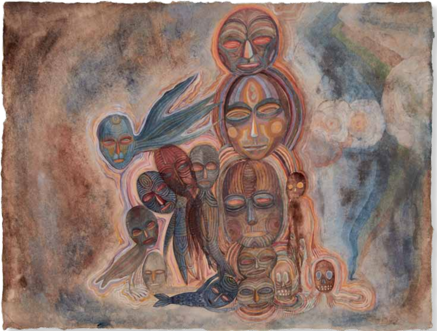
ANGELS AND BIRDS Watercolor painting on paper 18 x 23.25" AD168