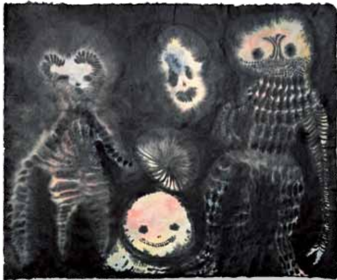
FIVE PLAYING BALL Watercolor and ink on handmade Japanese Kitakata paper 16.5 x 20.25" AD157