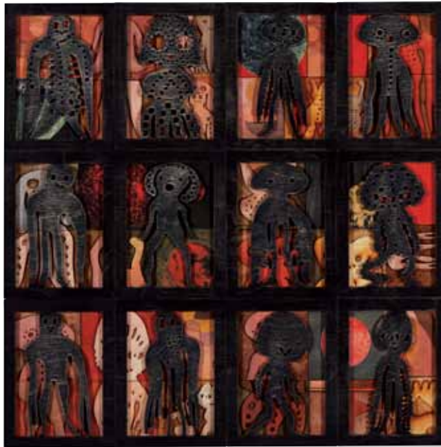
TWELVE FRIENDS: VERMILION AND BLACK Baltic birch, sumi ink, acrylic gouache, and watercolor 17.75 x 17.75 x 1.5" AD163