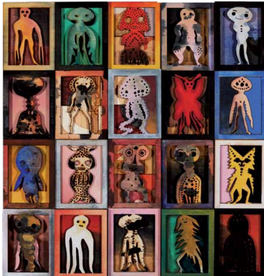
TWENTY PROTECTORS: POLYCHROME Baltic birch, sumi ink, watercolor, acrylic gouache, and flashe 23.5 x 22.25 x 2" AD161