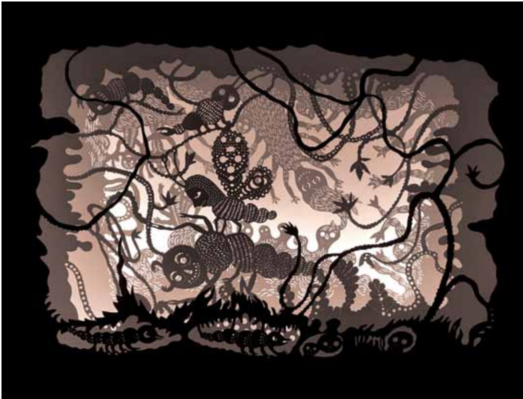
BUTTERFLY MAN (OF THE CHATTAHOOCHEE) Laser-cut, hand-cut, and hand-sewn paper tunnel book 22.5 x 30 x 9.25" AD179