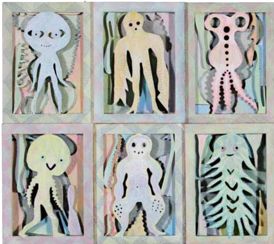
SIX PROTECTORS: POLYCHROME Baltic birch, gesso, acrylic gouache, and gel pens 11.75 x 13.25 x 1.5" AD167