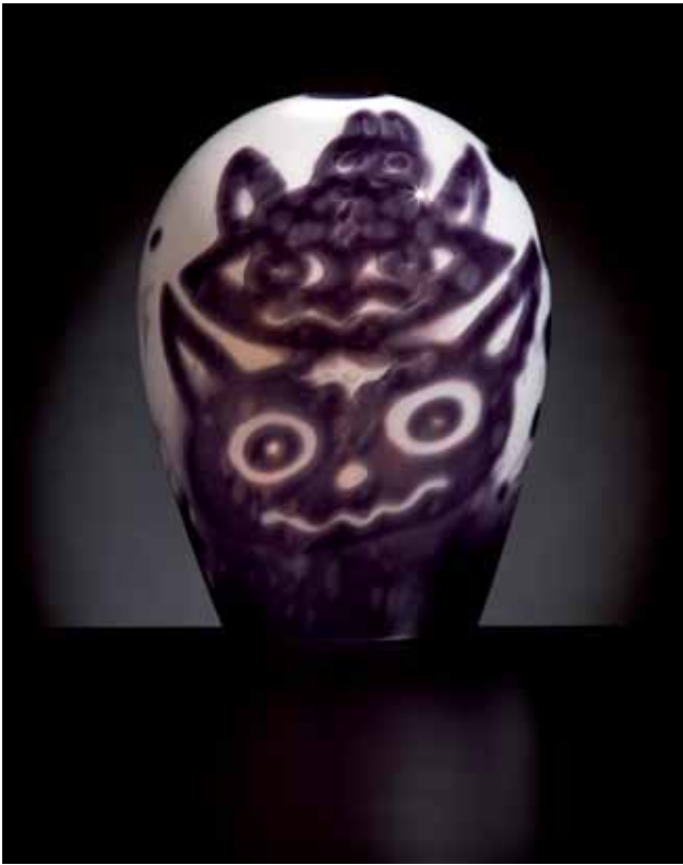
SPIRIT TOWER, PURPLE Blown glass and etched graal sculpture 9.5 x 6.5 x 6.5" AD151