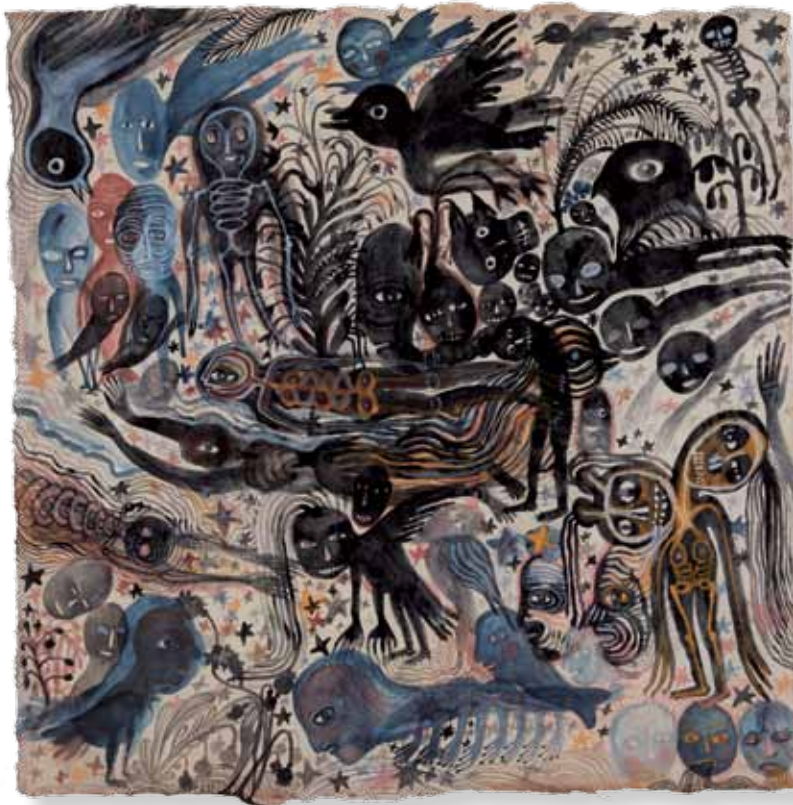
THE DREAM Watercolor painting on paper 18.25 x 18" AD175