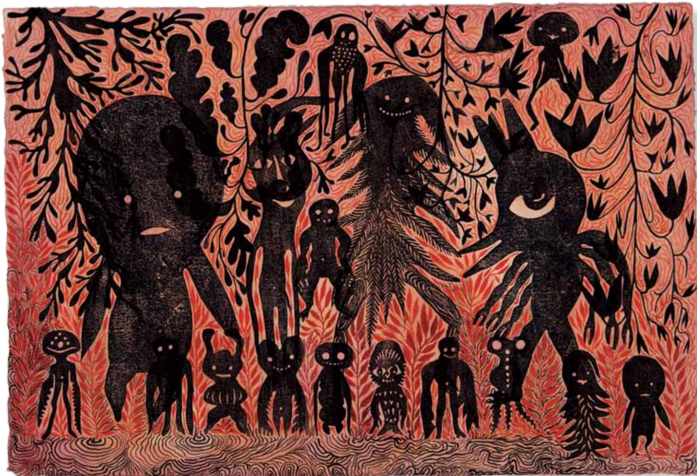
FOREST AT NIGHT Watercolor and gouache painting on Mokuhanga monotype on paper 16.75 x 24.5" AD173