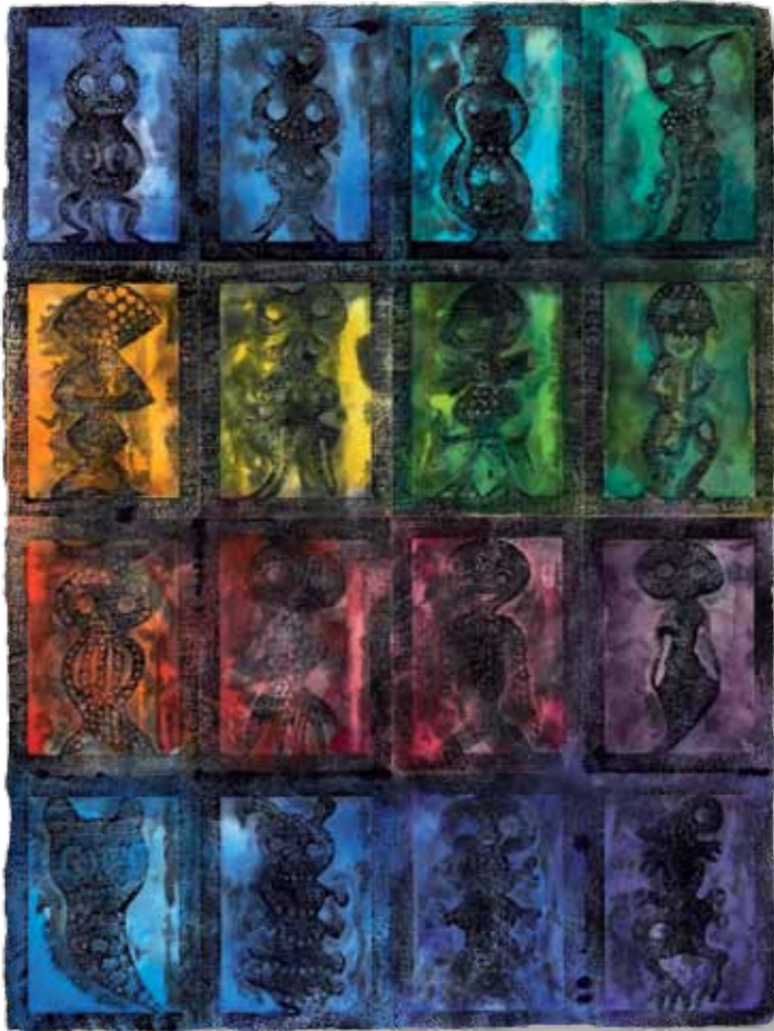
TWELVE PROTECTORS: RAINBOW Watercolor painting and Mokuhanga monoprint on paper 23.75 x 17.75" AD172