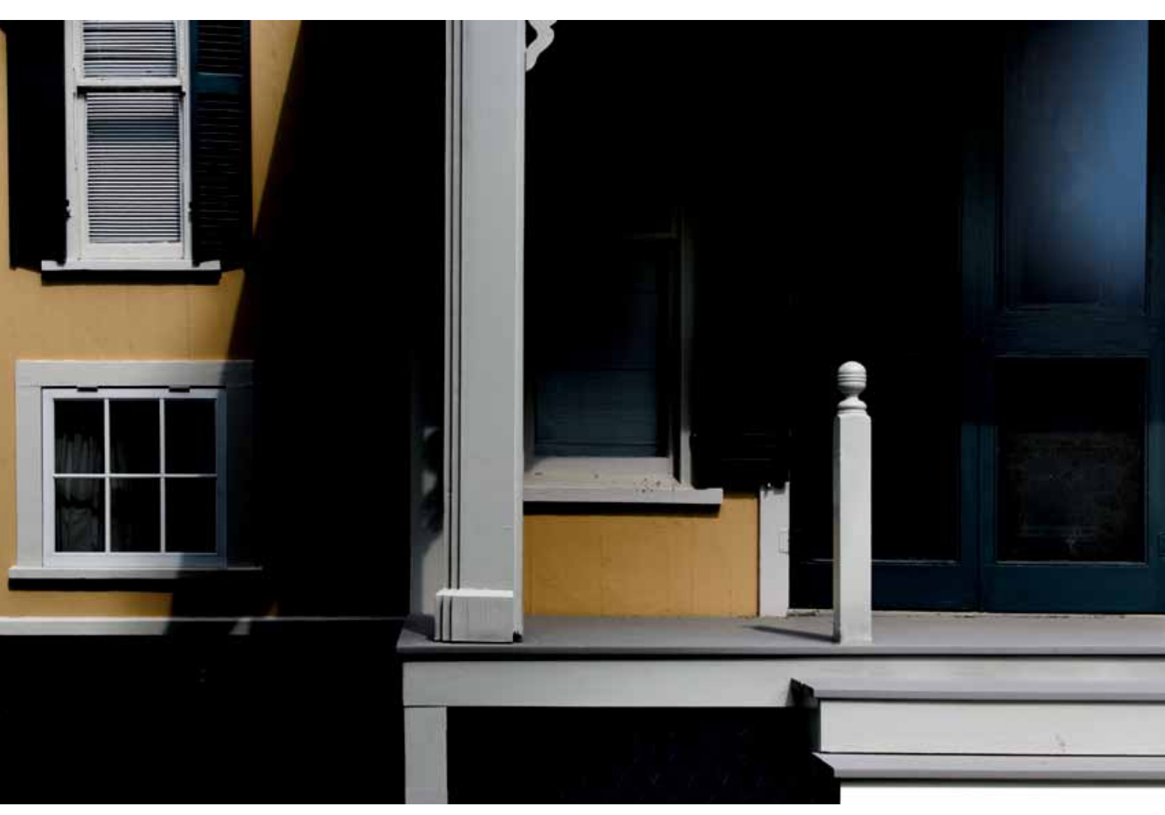
YELLOW HOUSE, 2019 Archival pigment print 16.25 x 25" FF125