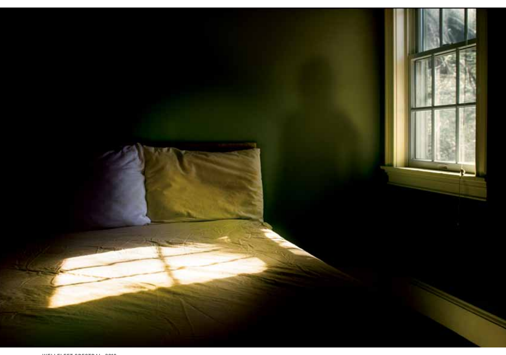
WELLFLEET SPECTRAL, 2018 Archival pigment print 16.25 x 25" FF124