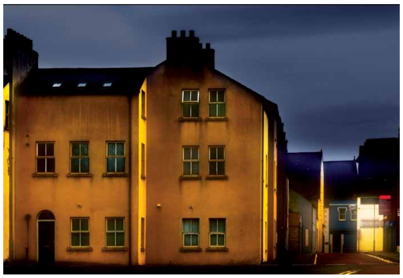
ANTRIM, 2019 Archival pigment print 15 x 22" FF112