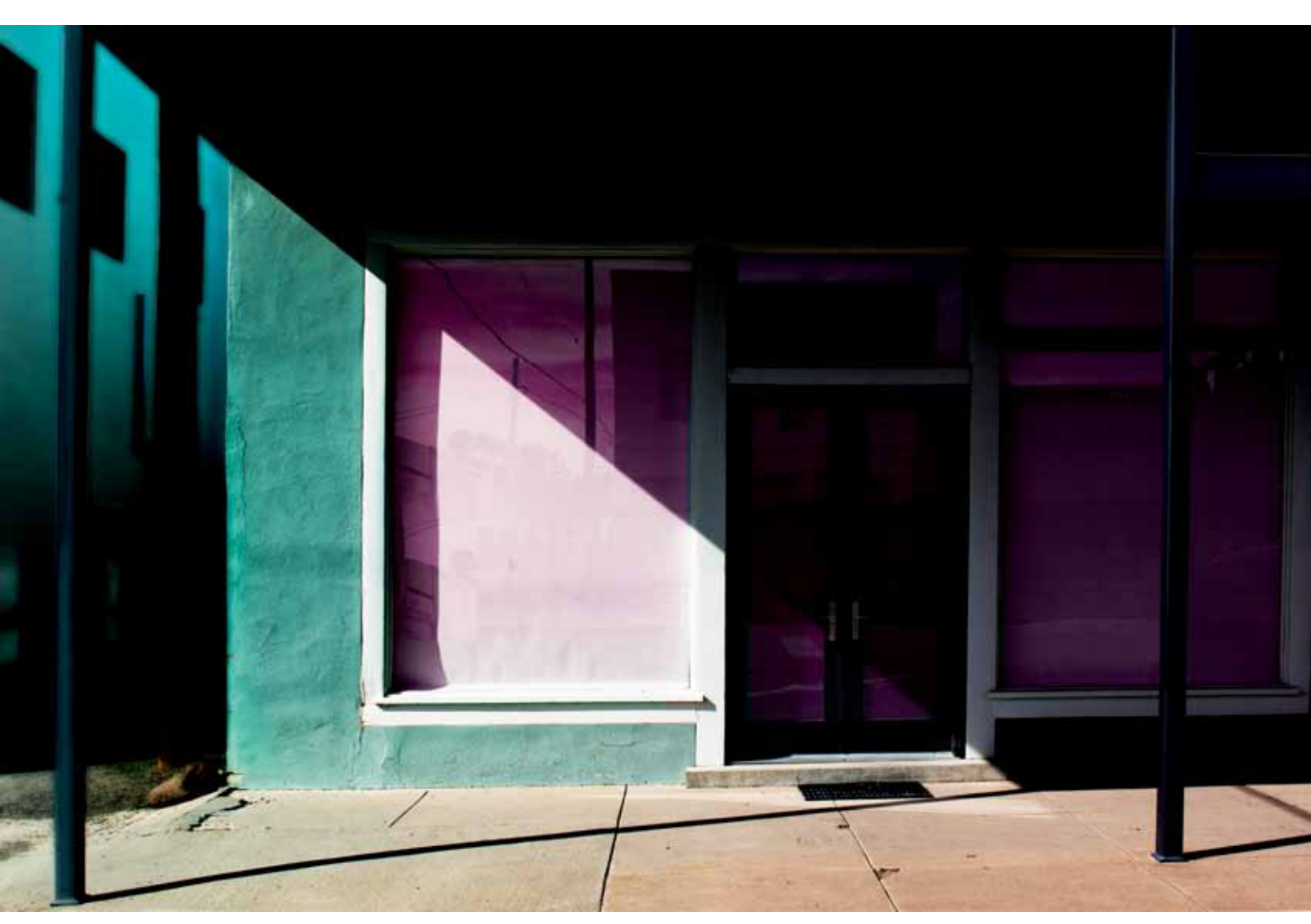
STUDY IN AQUA AND PINK, 2019 Archival pigment print 16.5 x 25" FF118