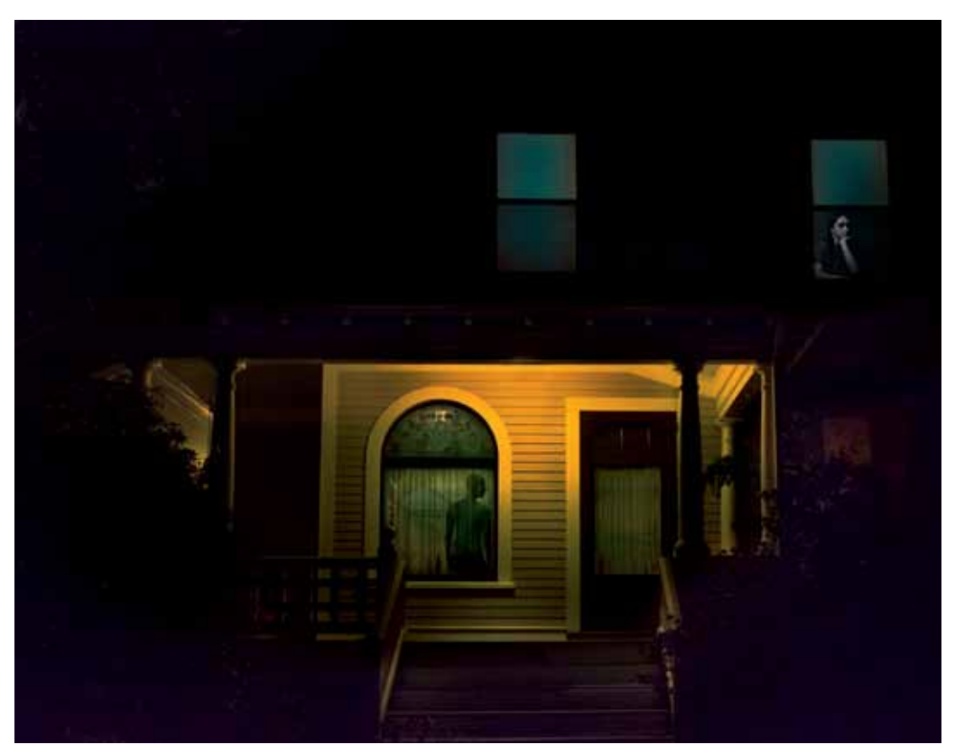
NIGHT IN THE TIME OF CORONA, 2020 Archival pigment print 15.75 x 20" FF116