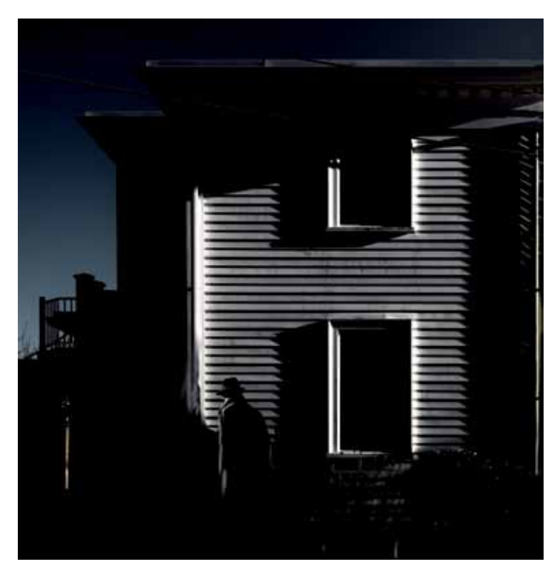
WELLFLEET SHADOWS, 2019 Archival pigment print 15 x 14.5" FF123