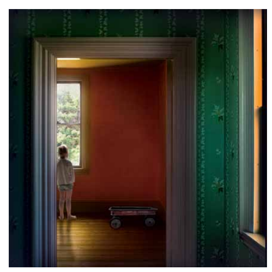
RADIO FLYER, 2020 Archival pigment print 20 x 20" FF117