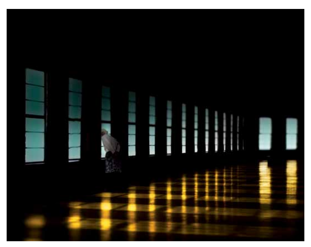
SURVEILLANCE, 2018 Archival pigment print 15 x 21" FF120