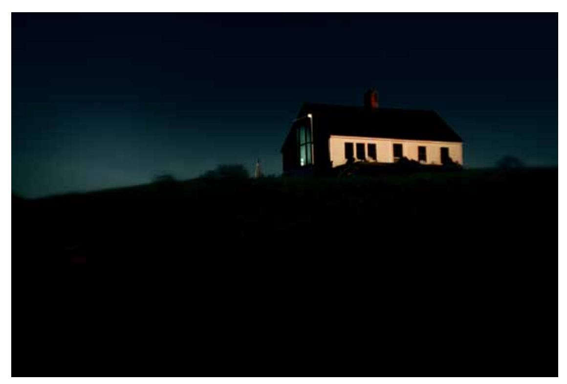
LEAVING TRURO, 2019 Archival pigment print 14 x 21" FF115