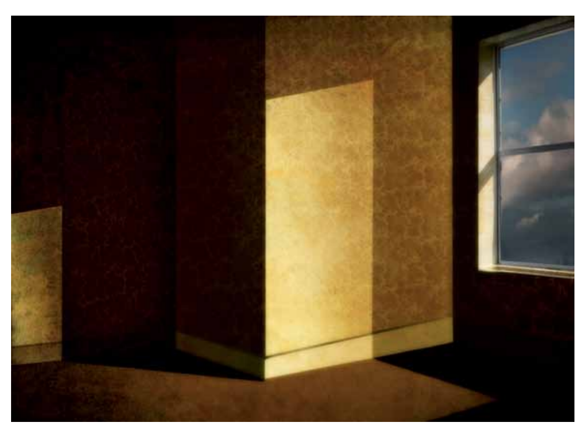
SUNLIGHT, AFTER HOPPER, 2019 Archival pigment print 15 x 21" FF119