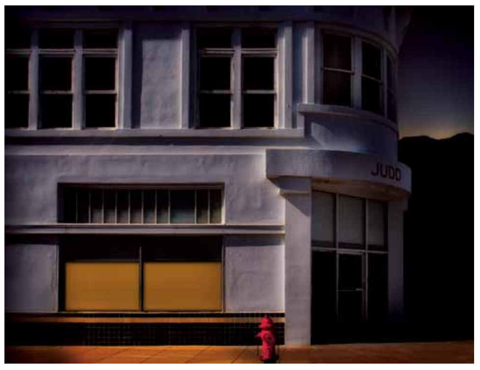
JUDD, 2019 Archival pigment print 16 x 21" FF114