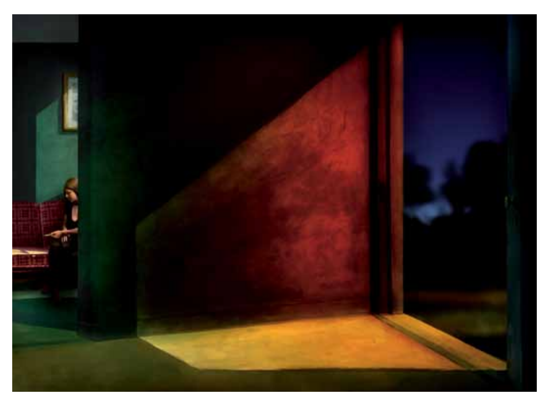
THE WORLD OUTSIDE, AFTER HOPPER, 2019 Archival pigment print 15 x 20.75" FF122