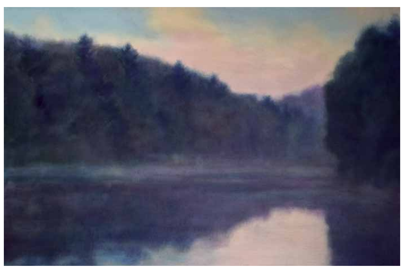
Early Spring Morning, Housatonic Bend \, \circ \, Oil on linen \, \circ \, 24 x 36" \, \circ \, JMS761