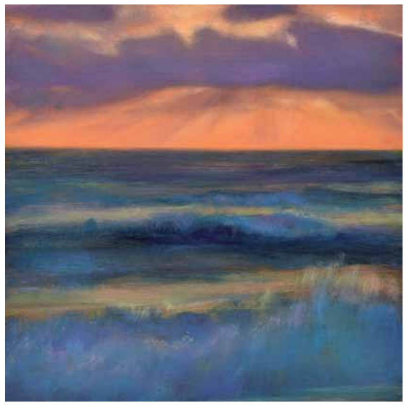
Atlantic Dawn • Oil on panel • 20 x 20" • JMS765