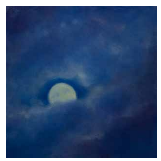
Winter Moon • Oil on panel • 12 x 12" • JMS755