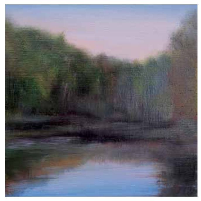
Late September Afternoon \, \circ \, Oil on linen \, \circ \, 14 x 14" \, \circ \, JMS750