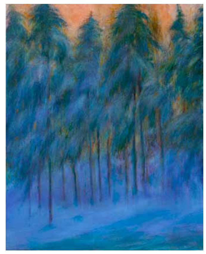
Winter Dusk \, \circ \, Oil on canvas \, \circ \, 20 x 16" \, \circ \, JMS746