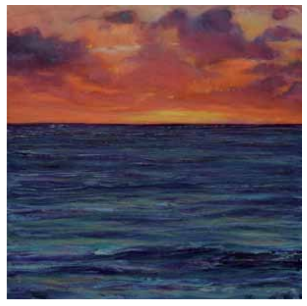
Atlantic Sunrise • Oil on linen • 12 x 12" • JMS758