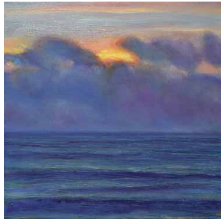
Post-Storm Atlantic Sunrise • Oil on linen • 16 x 16" • JMS766