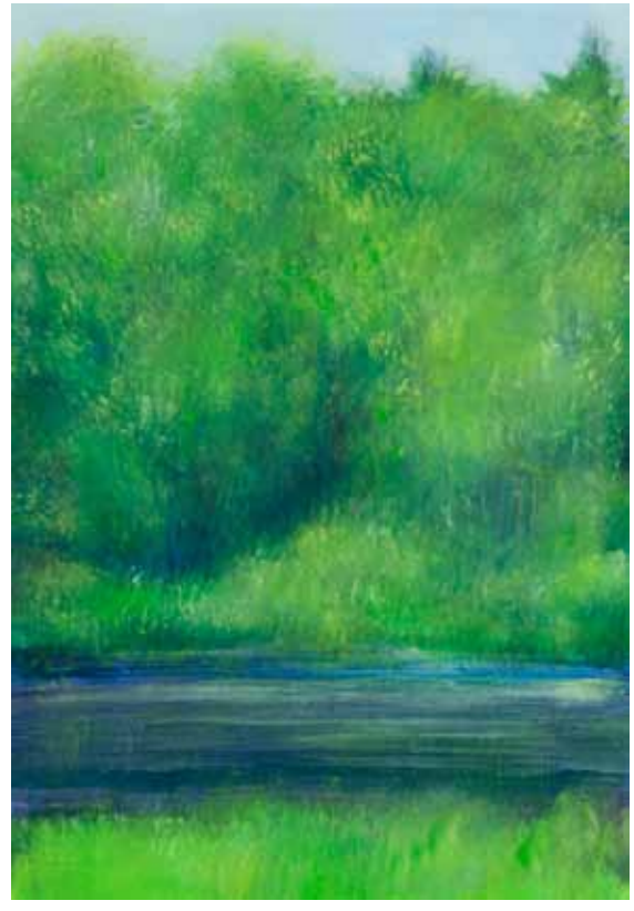
June Woods by the River * Acrylic on Arches paper * 29 x 20.5" * JMS738