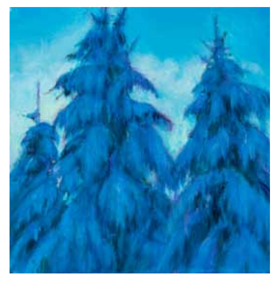
Winter Pine Study \, \bullet \, Oil on linen \, \bullet \, 10 x 10" \, \bullet \, JMS747