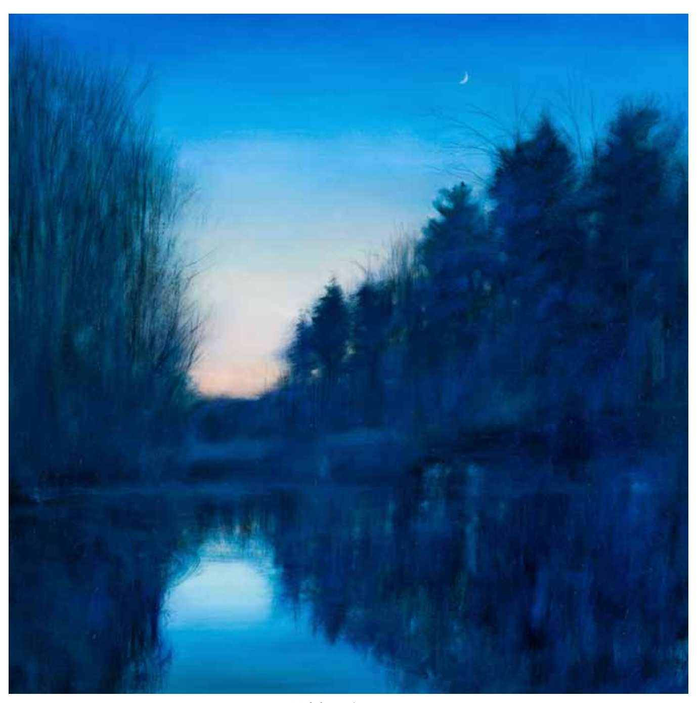
Housatonic Crescent Twilight \, \cdot \, Oil on canvas \, \cdot \, 36 x 36" \, \cdot \, JMS736