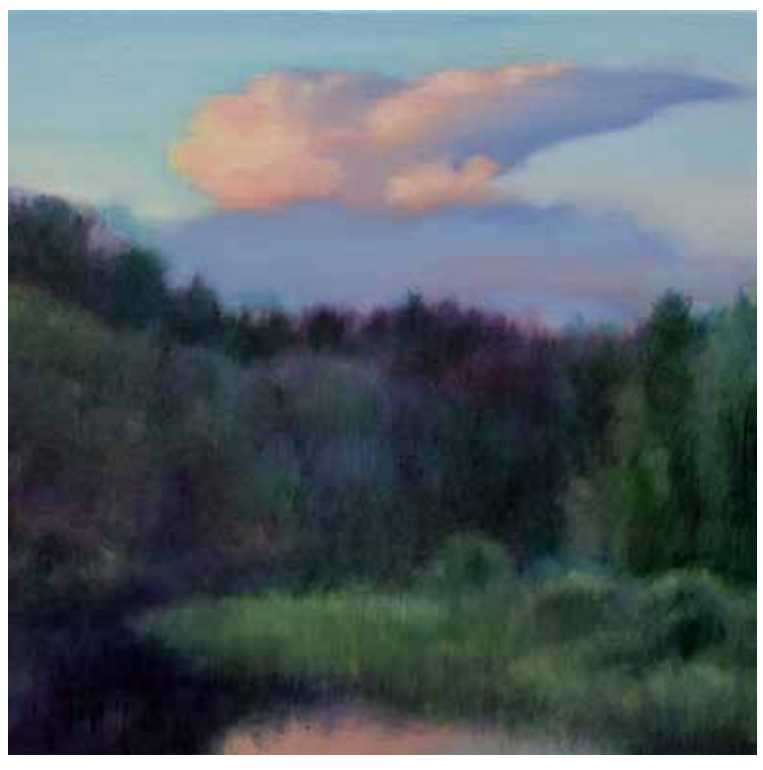
After the Storm, Housatonic Dusk \, \circ \, Oil on linen \, \circ \, 14 x 14" \, \circ \, JMS749

Please visit www.puckergallery.com to view current and past exhibition catalogues and subscribe to the Artwork of the Week e-mail list.