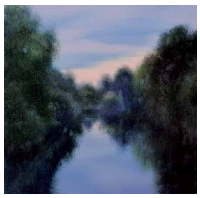
Housatonic Reflection, Study \, \circ \, Oil on linen \, \circ \, 14 x 14" \, \circ \, JMS756