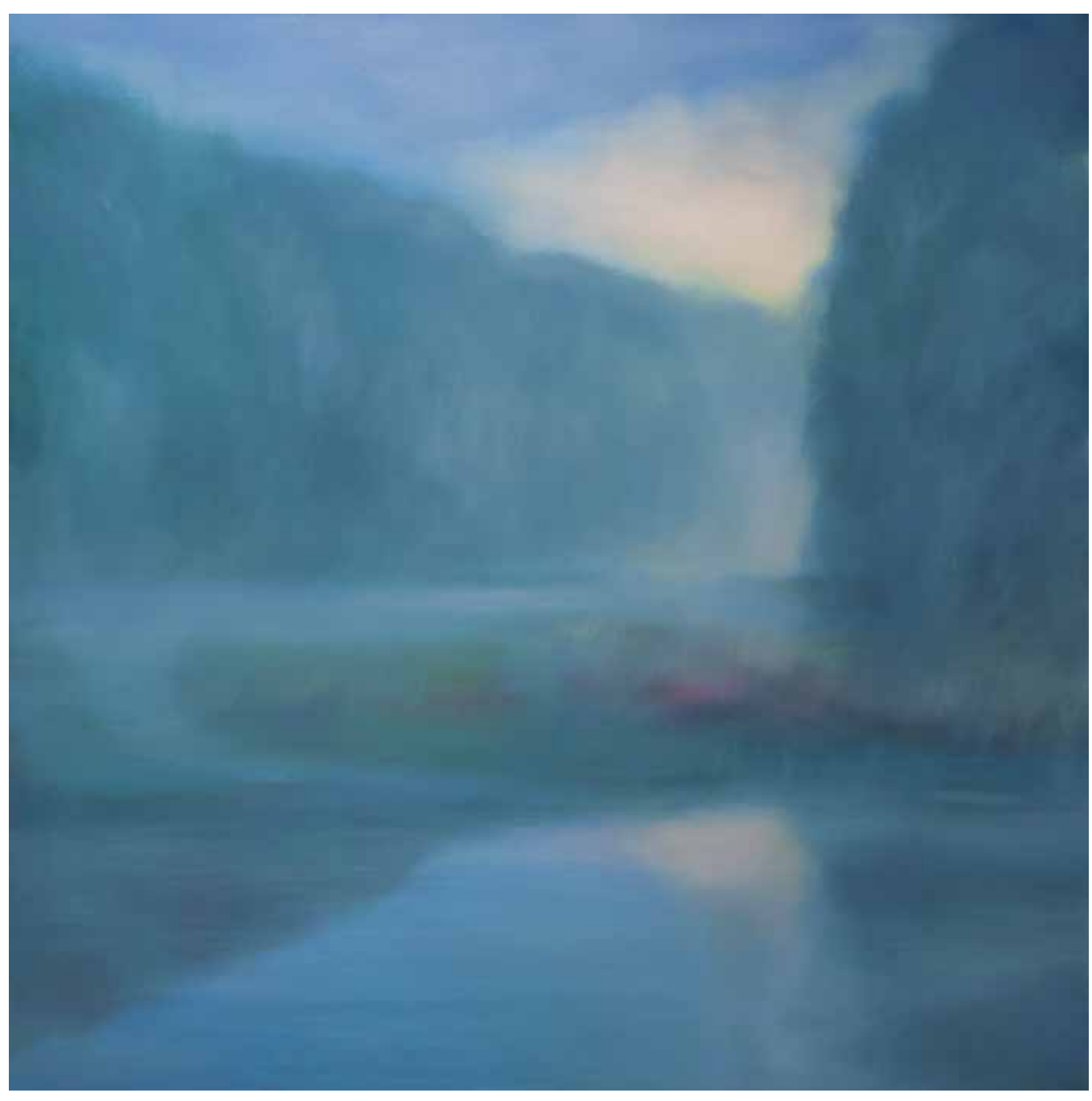
Misty Morning, Housatonic Bend * Oil on canvas * 48 x 48" * JMS748