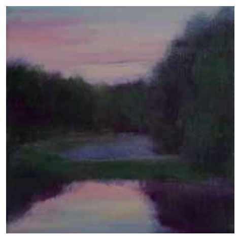
Sunset Housatonic Bend, Study \, \circ \, Oil on linen \, \circ \, 6 x 6" \, \circ \, JMS760