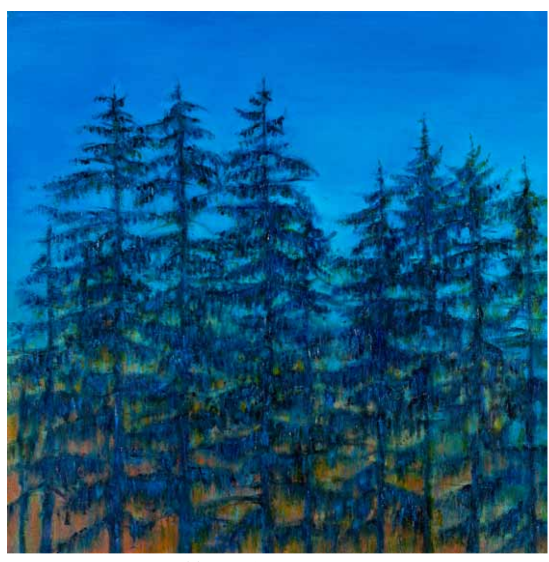
Winter Twilight Pines \, \bullet \, Oil on canvas \, \bullet \, 24 x 24" \, \bullet \, JMS745