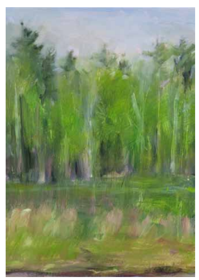
Woods Along the River, Early May \,\circ\, Oil on Arches paper \,\circ\, 29 x 22.5" \,\circ\, JMS737