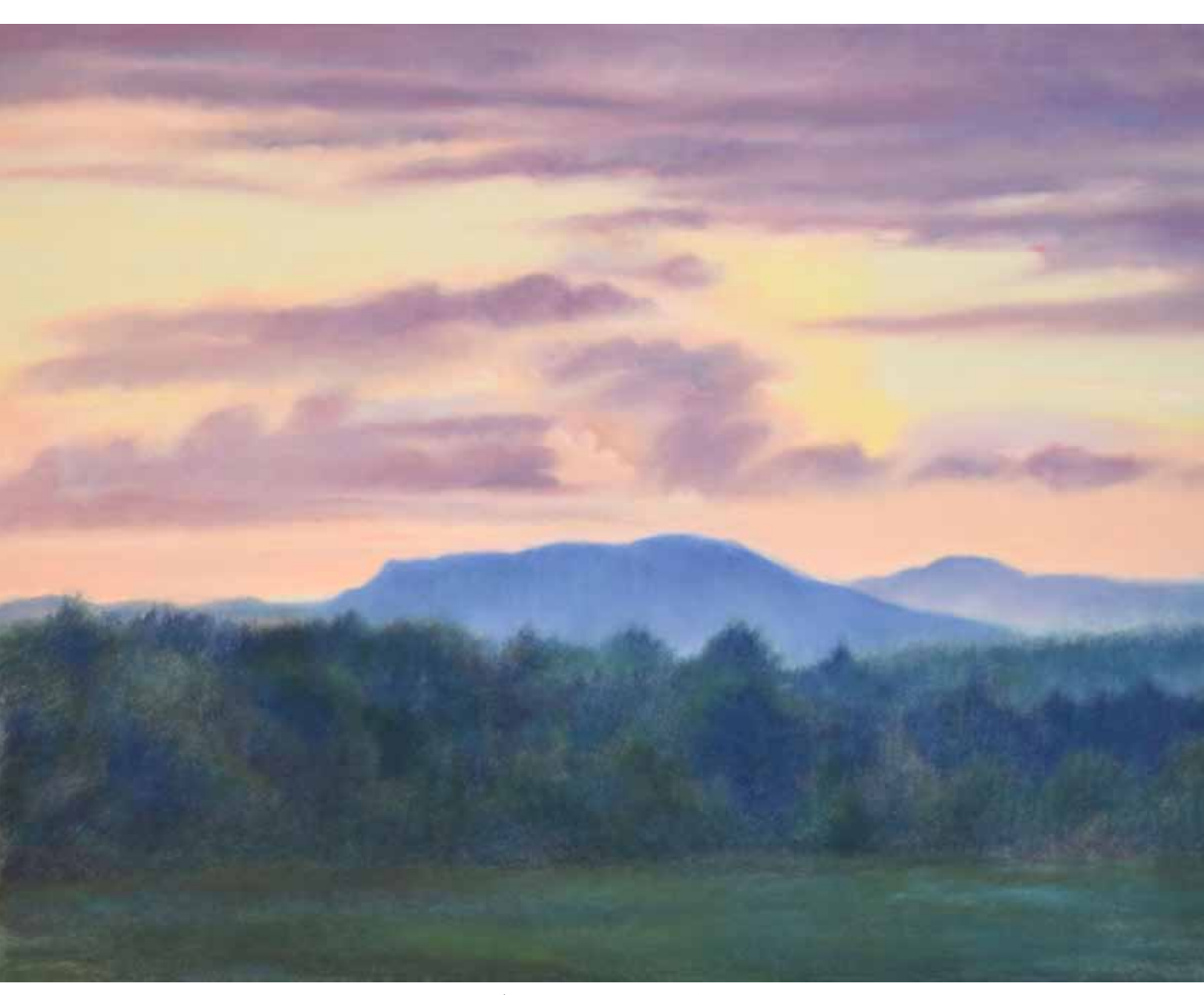
Summer Sunset, Towards Monument Mountain * Pastel * 36 x 46.5" * JMS740