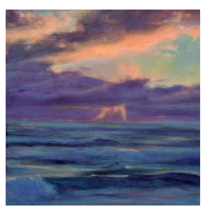
After the Storm, Atlantic Sunrise \, \cdot \, Oil on linen \, \cdot \, 12 x 12" \, \cdot \, JMS757

Please visit www.puckergallery.com for a list of virtual gatherings and events accompanying Attentiveness to Nature.