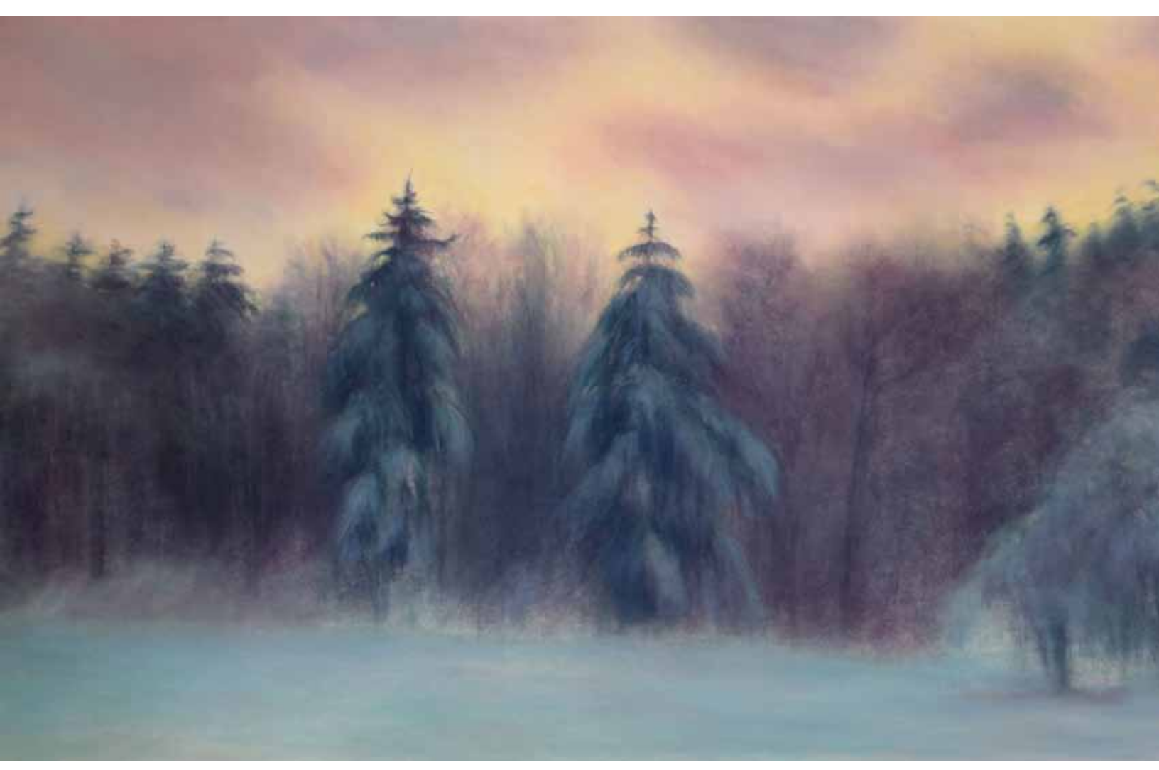
Stockbridge Winter Pines • Pastel • 31 x 49" • JMS741