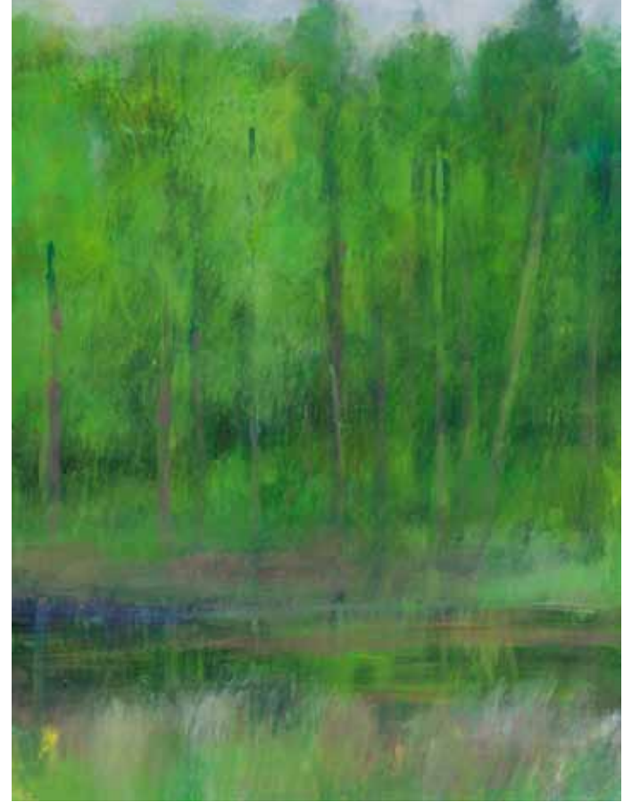
Woods by the River, Early June \, \circ \, Oil on Arches paper \, \circ \, 29 x 22" \, \circ \, JMS739