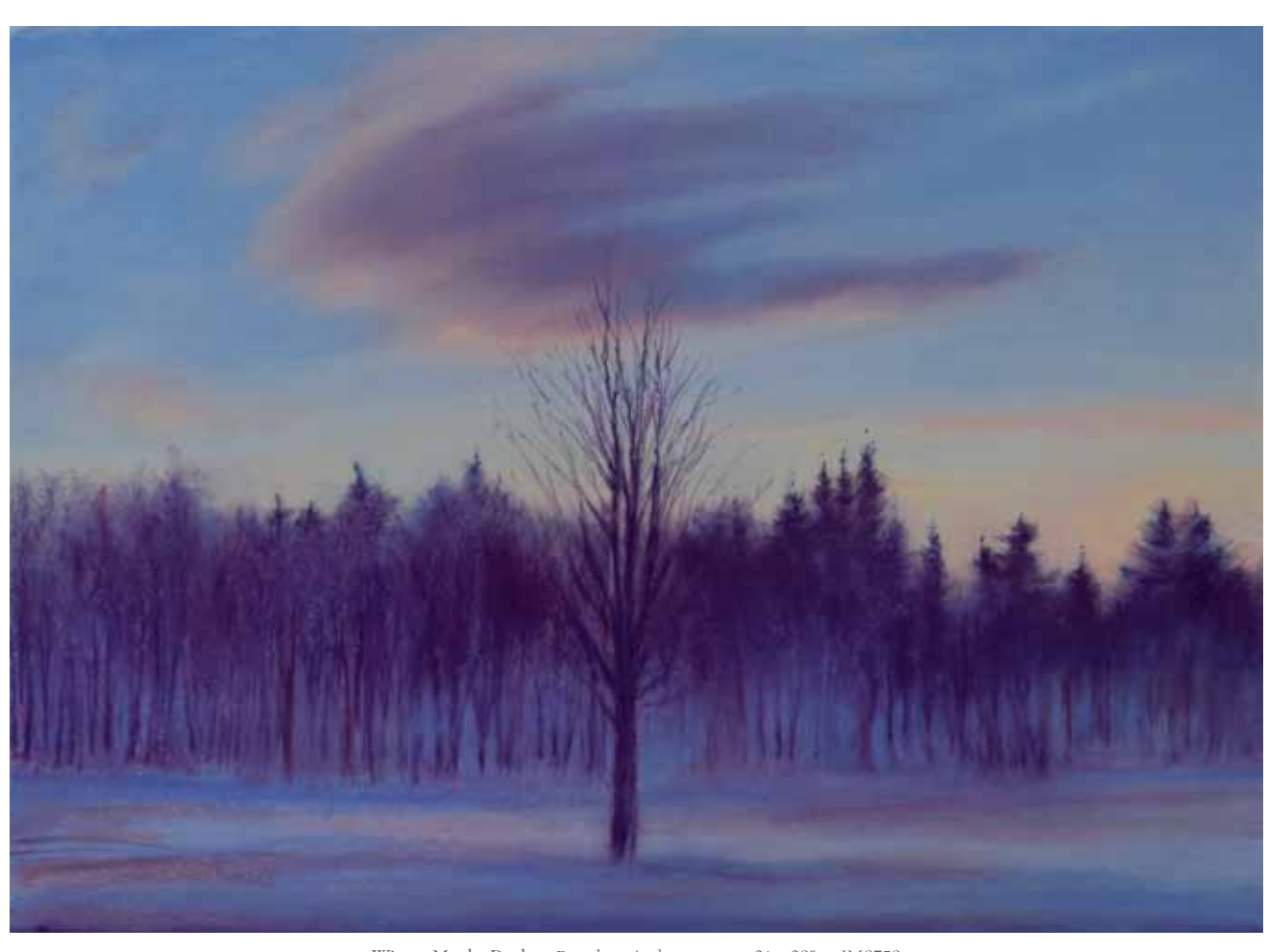
Winter Maple, Dusk * Pastel on Arches paper * 21 \times 29 " * JMS759