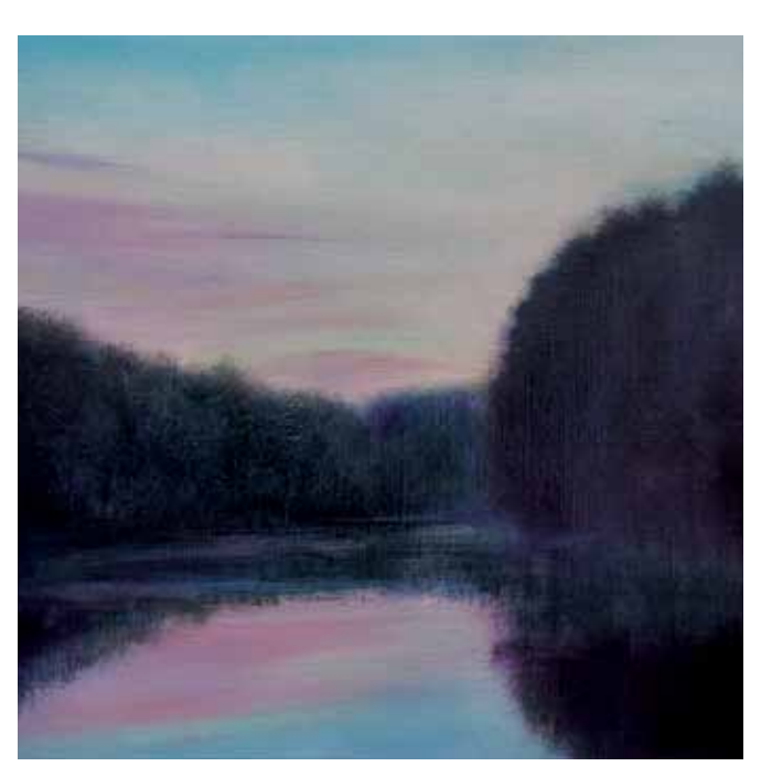
Sunset, Housatonic Bend \, \circ \, Oil on linen \, \circ \, 14 x 14" \, \circ \, JMS751