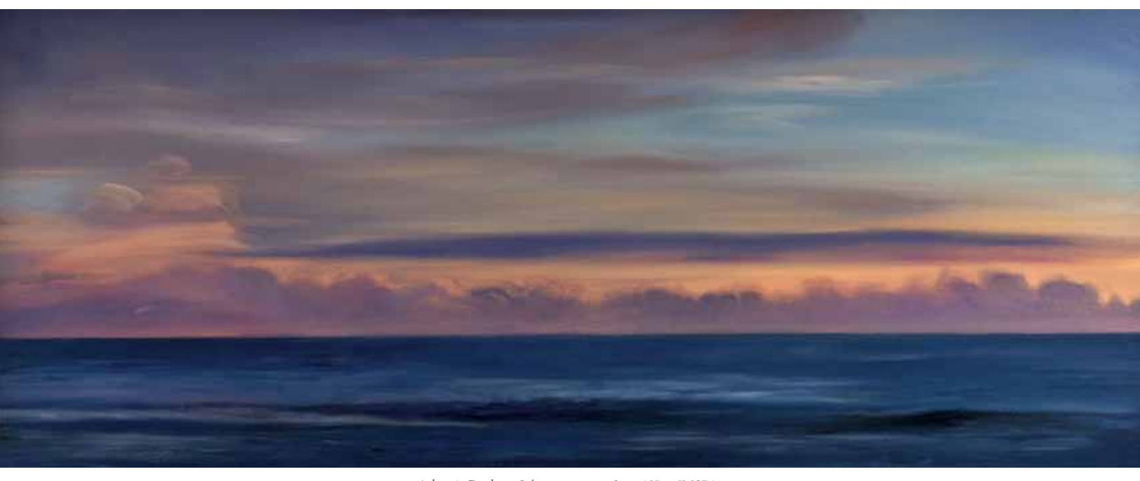
Atlantic Dusk • Oil on canvas • 24 x 60" • JMS764