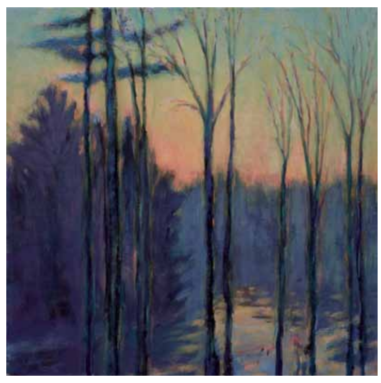
Winter Sunset from Butler Road \, \circ \, Oil on linen \, \circ \, 16 x 16" \, \circ \, JMS763