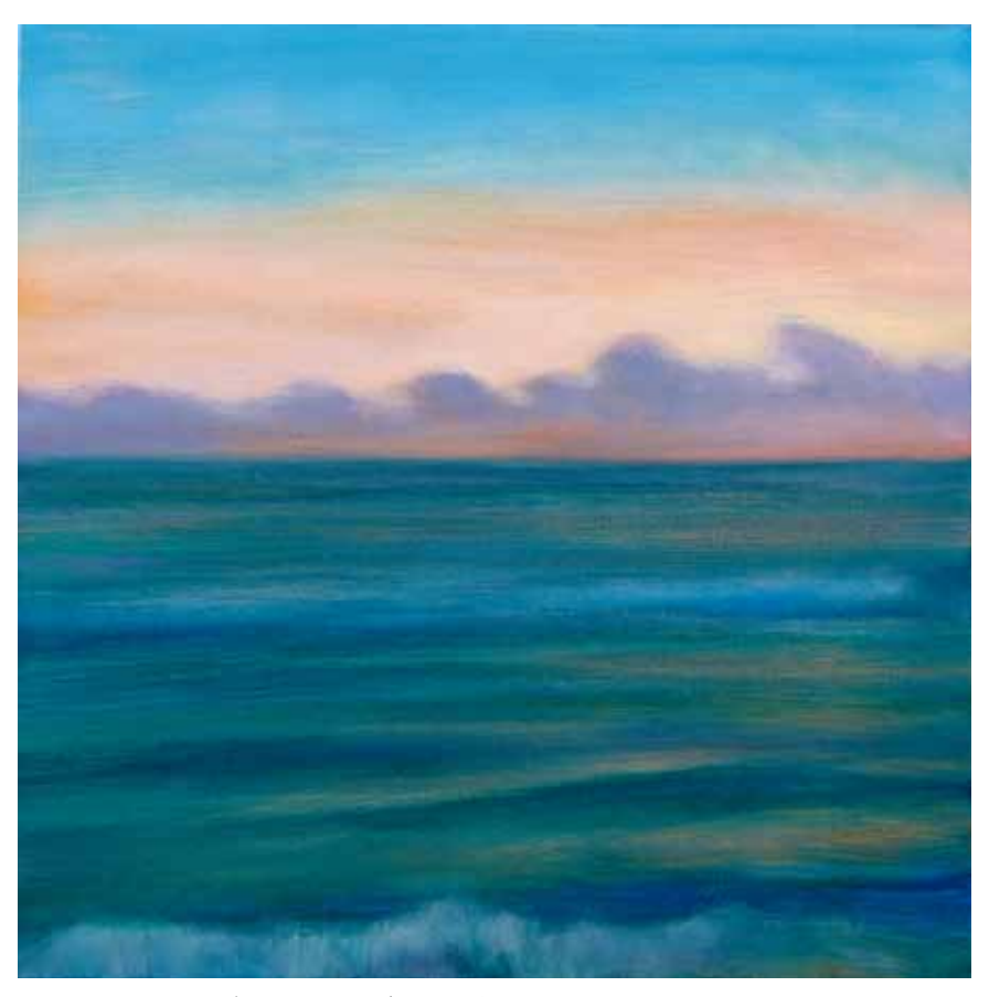
Atlantic Dawn Study II * Oil on canvas * 20 x 20" * JMS735