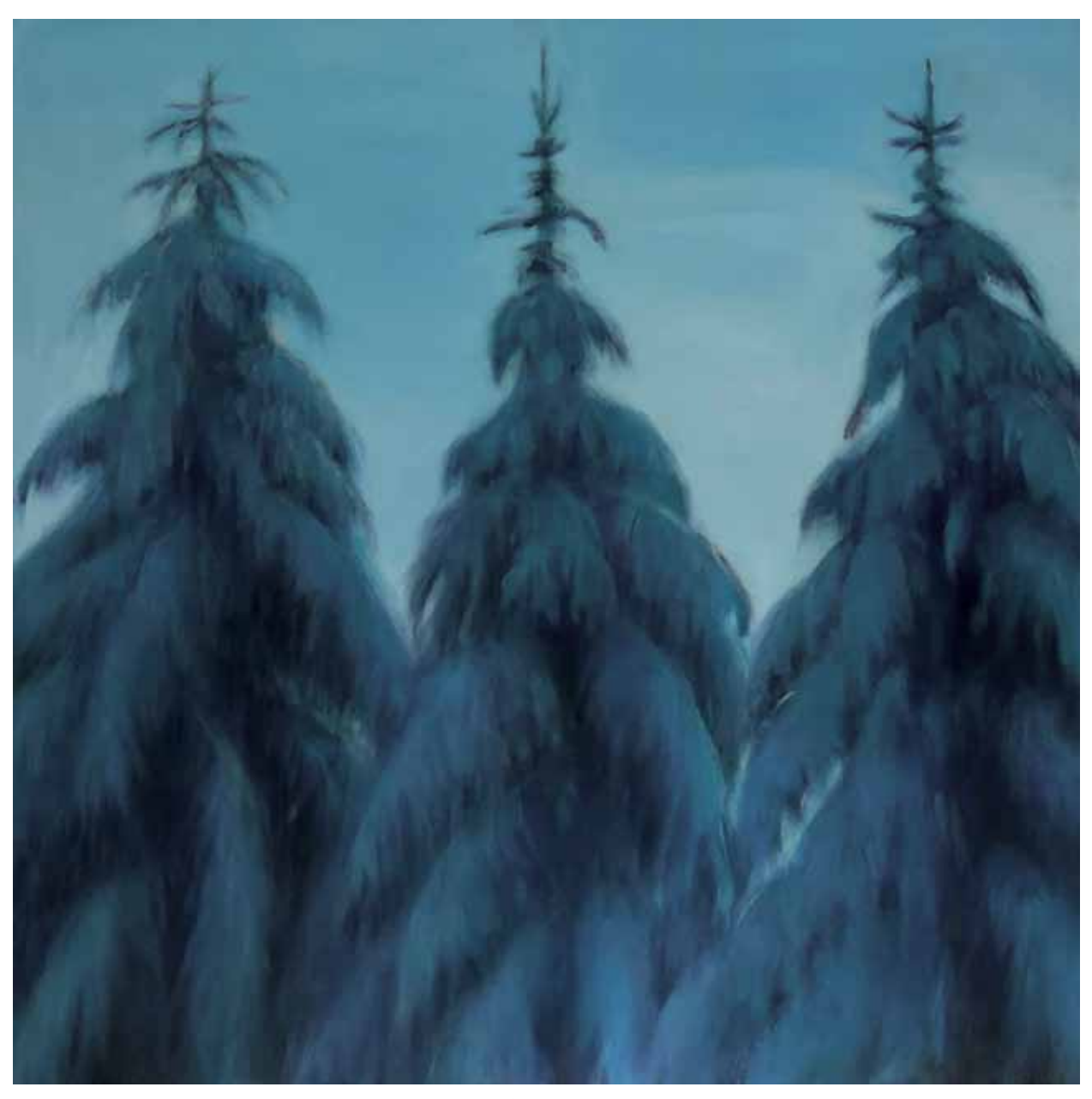
Winter Pine Trio \, \circ \, Oil on canvas \, \circ \, 34 x 34" \, \circ \, JMS753