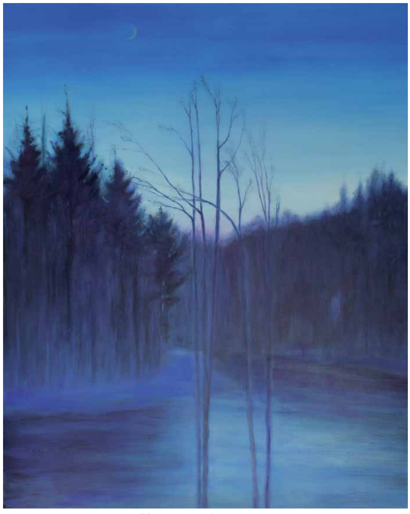
River Twilight, Crescent Winter \, \circ \, Oil on canvas \, \circ \, 60 x 48" \, \circ \, JMS752