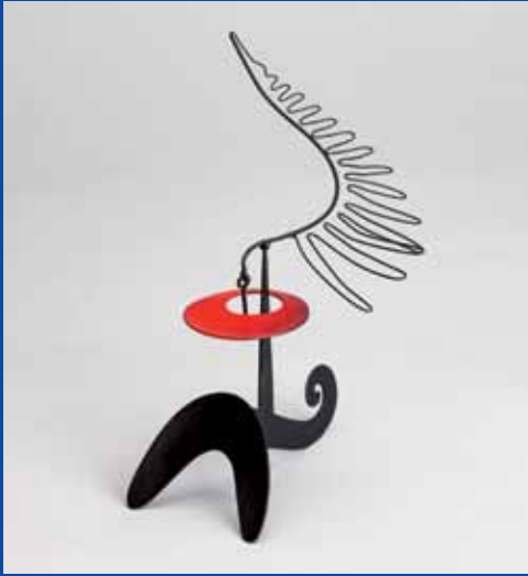
Desiree's Wings , 2020 Standing mobile in brass and aluminum with steel wires, oil and acrylic colors 6.5 x 7 x 6" MD839