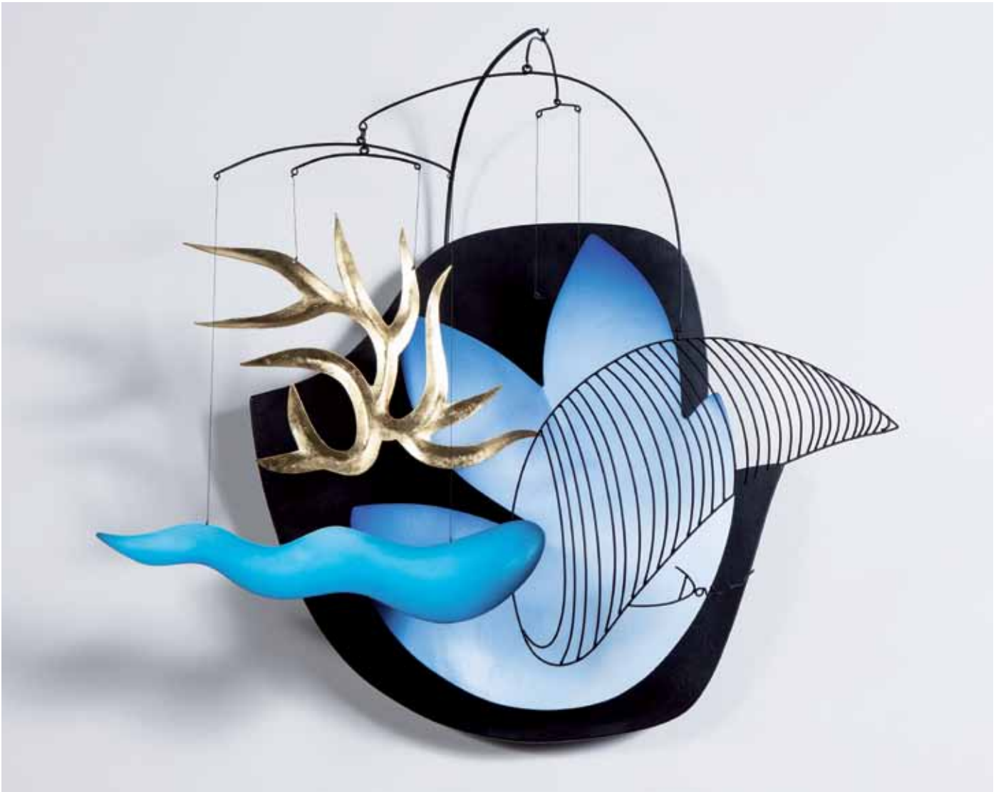
Nature's Own Poem , 2020 Wall-mounted mobile in aluminum, steel wires, acrylic sheet with oil and acrylic colors and 23 karat gold leaf 23 x 25 x 10" MD837