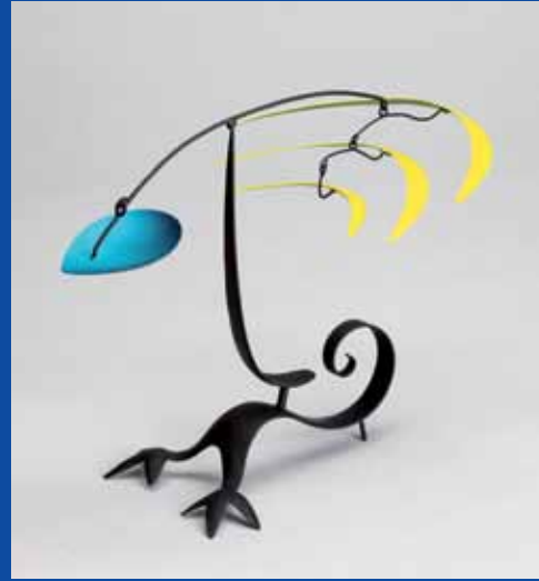
A Much Decorated Dragon , 2020 Standing mobile in brass and aluminum with steel wires, oil and acrylic colors 6 x 8 x 5" MD840