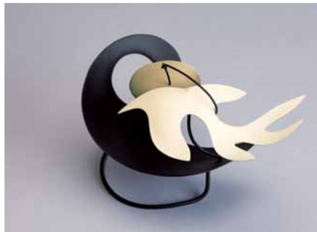
Short Journey , 2019 Standing mobile in brass and aluminum with steel wires, oil and acrylic colors 5.5 x 9 x 6" MD833