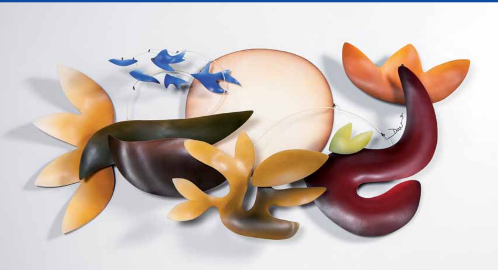
Afternoon Shadows , 2019 Wall-mounted mobile in brass and aluminum with steel wires, oil and acrylic colors 40 x 60 x 8" MD827