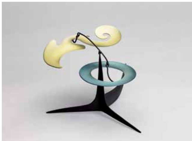
Dancing On A Cloud , 2020 Standing mobile in brass and aluminum with steel wires, oil and acrylic colors 4.5 x 6 x 6" MD841