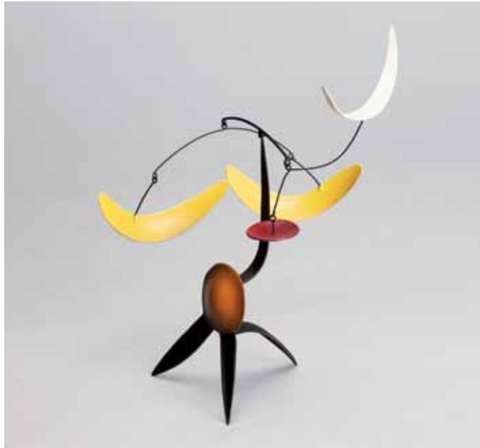
Travelling Circus , 2020

Standing mobile in brass and aluminum with steel wires, oil and acrylic colors 9 x 6 x 7" MD842