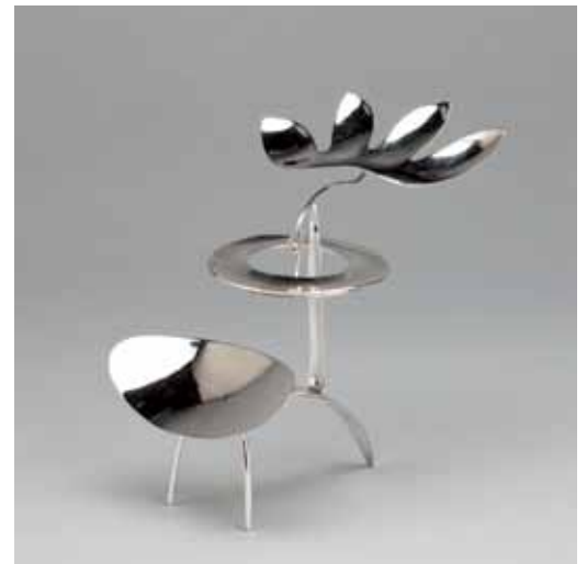
Guarding the Past , 2018 Standing mobile in sterling silver 6 x 6 x 4.5" MD823