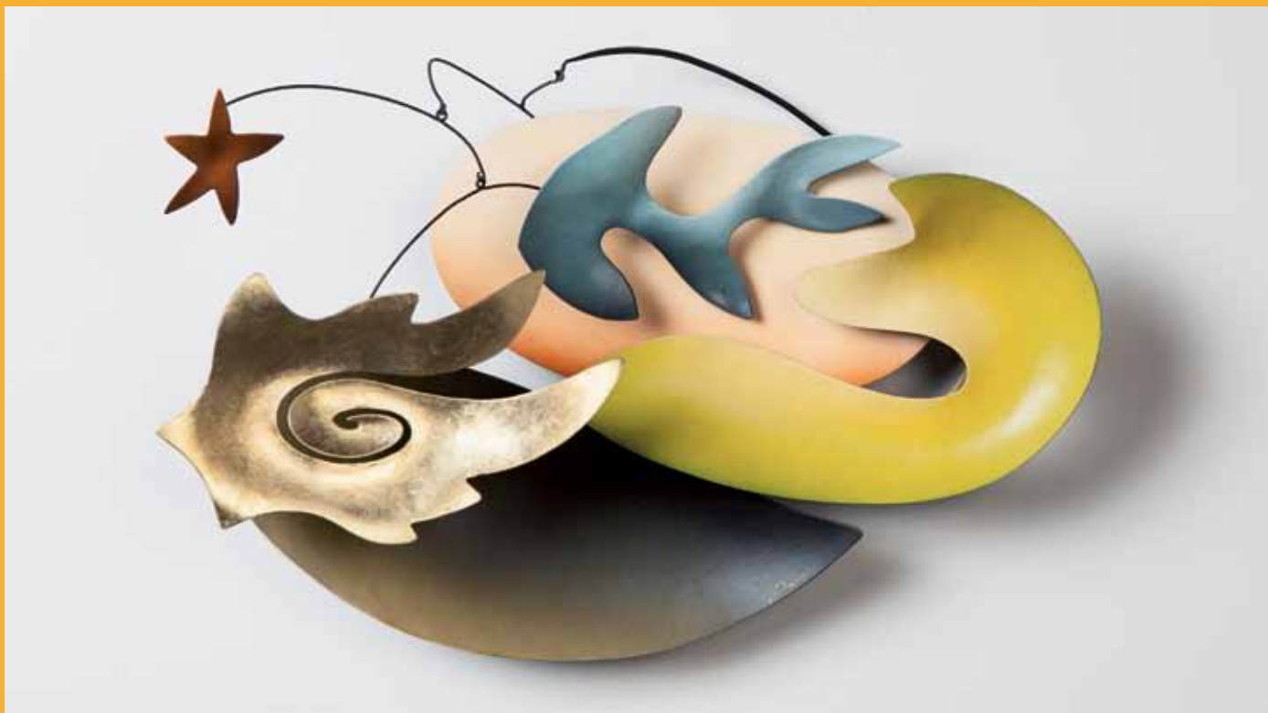
A New and Wondrous Dream , 2019

Online Events: Please visit www.puckergallery.com/events for a list of virtual gatherings and events accompanying Joy-Filled Universe .