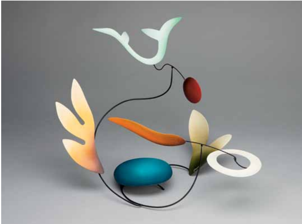
The Greatest Show on Earth , 2018

Standing mobile with two moving sections in brass and aluminum with steel wires, oil and acrylic colors 12 x 20 x 14" MD826