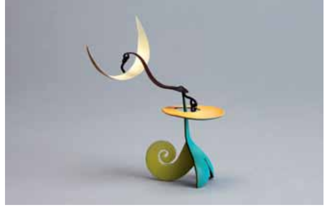
Towards the Sky , 2019 Standing mobile in brass and aluminum with steel wires, oil and acrylic colors 4.5 x 3 x 3.5" MD831