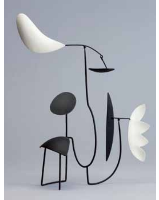
Arrangement in Black and White , 2019 Standing mobile in brass and aluminum with steel wires, oil and acrylic colors 12 x 8 x 8" MD834