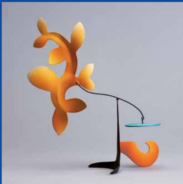
Exuberant Day , 2019 Standing mobile in brass and aluminum with steel wires, oil and acrylic colors 11 x 10 x 4" MD835