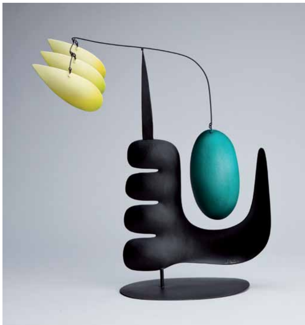
The Belly of the Beast , 2018 Standing mobile in brass and aluminum with steel wires, oil and acrylic colors 19 x 18 x 16.5" MD814