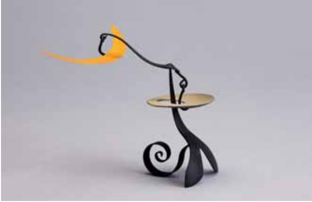
Minimal Effort , 2019 Standing mobile in brass and aluminum with steel wires, oil and acrylic colors 4 x 5 x 4" MD832