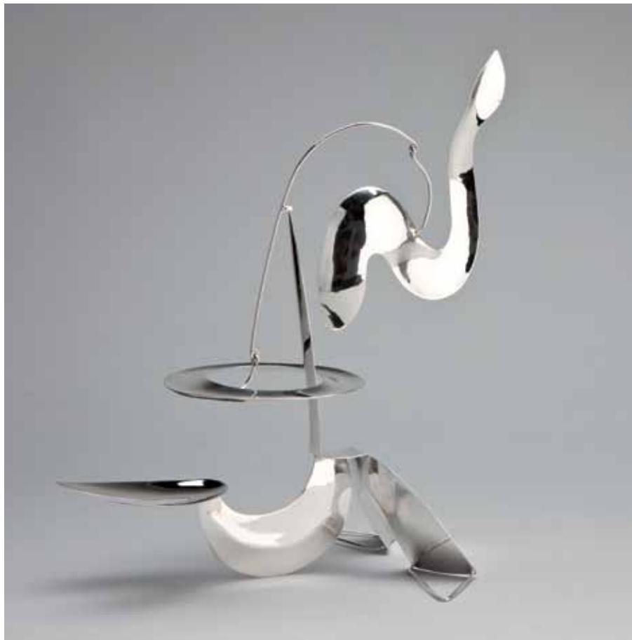
Chimera , 2018

Standing mobile in brass and aluminum with steel wires, oil and acrylic colors 9 x 6 x 7" MD842