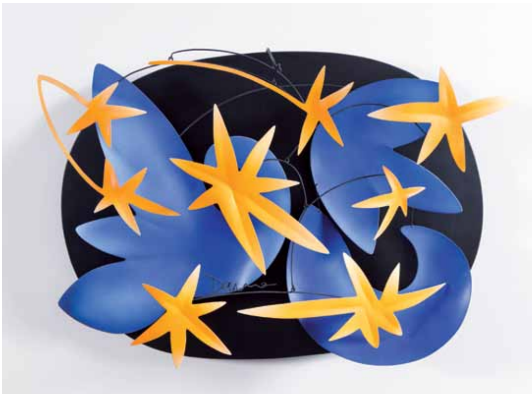
Stellar Starlight , 2018

Standing mobile with two moving sections in brass and aluminum with steel wires, oil and acrylic colors 12 x 20 x 14" MD826