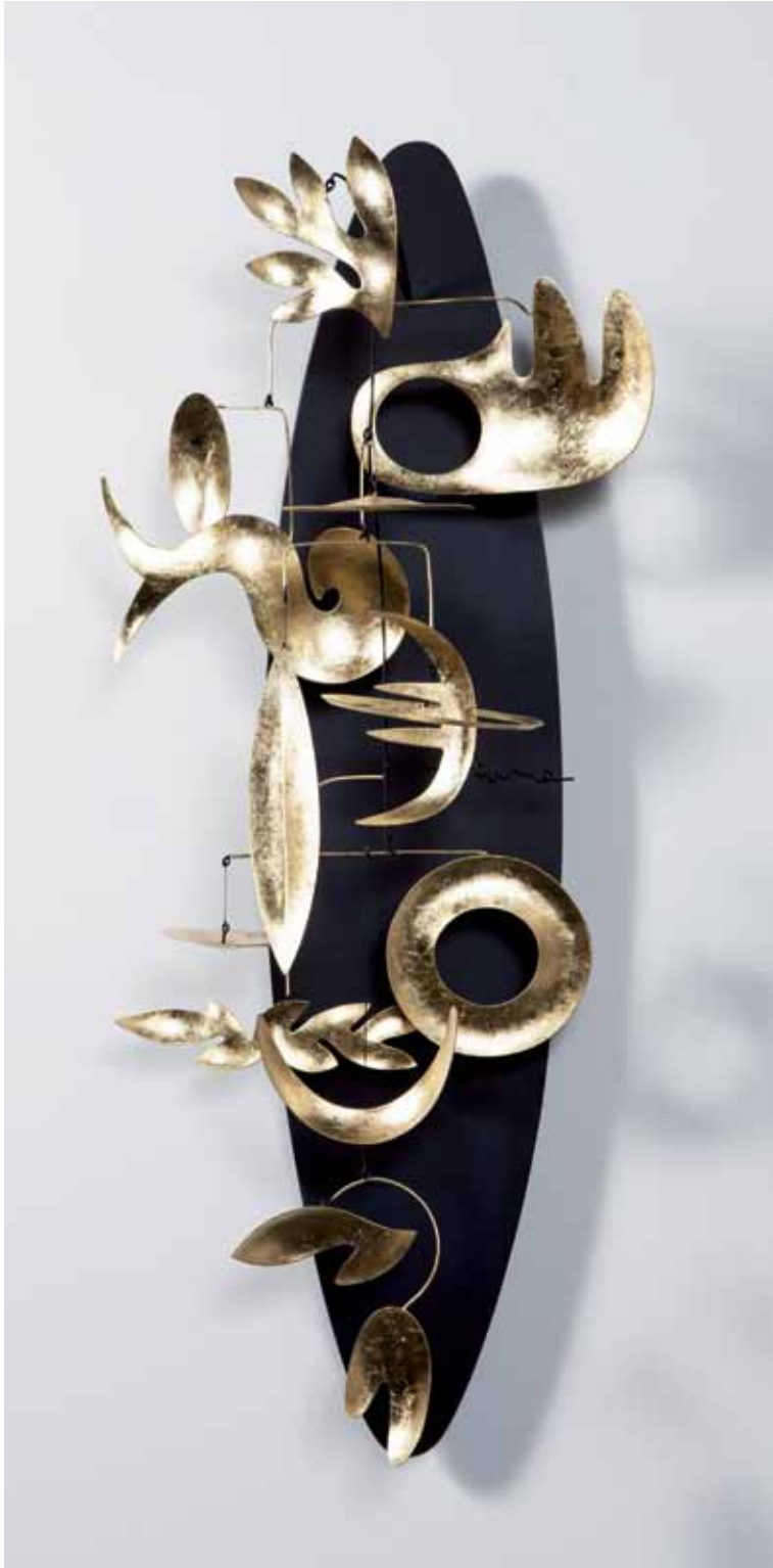
The Tower of Song , 2020 Wall-mounted mobile in aluminum and steel wires with acrylic board, oil paint and 23 karat gold leaf 33 x 12 x 11" MD843