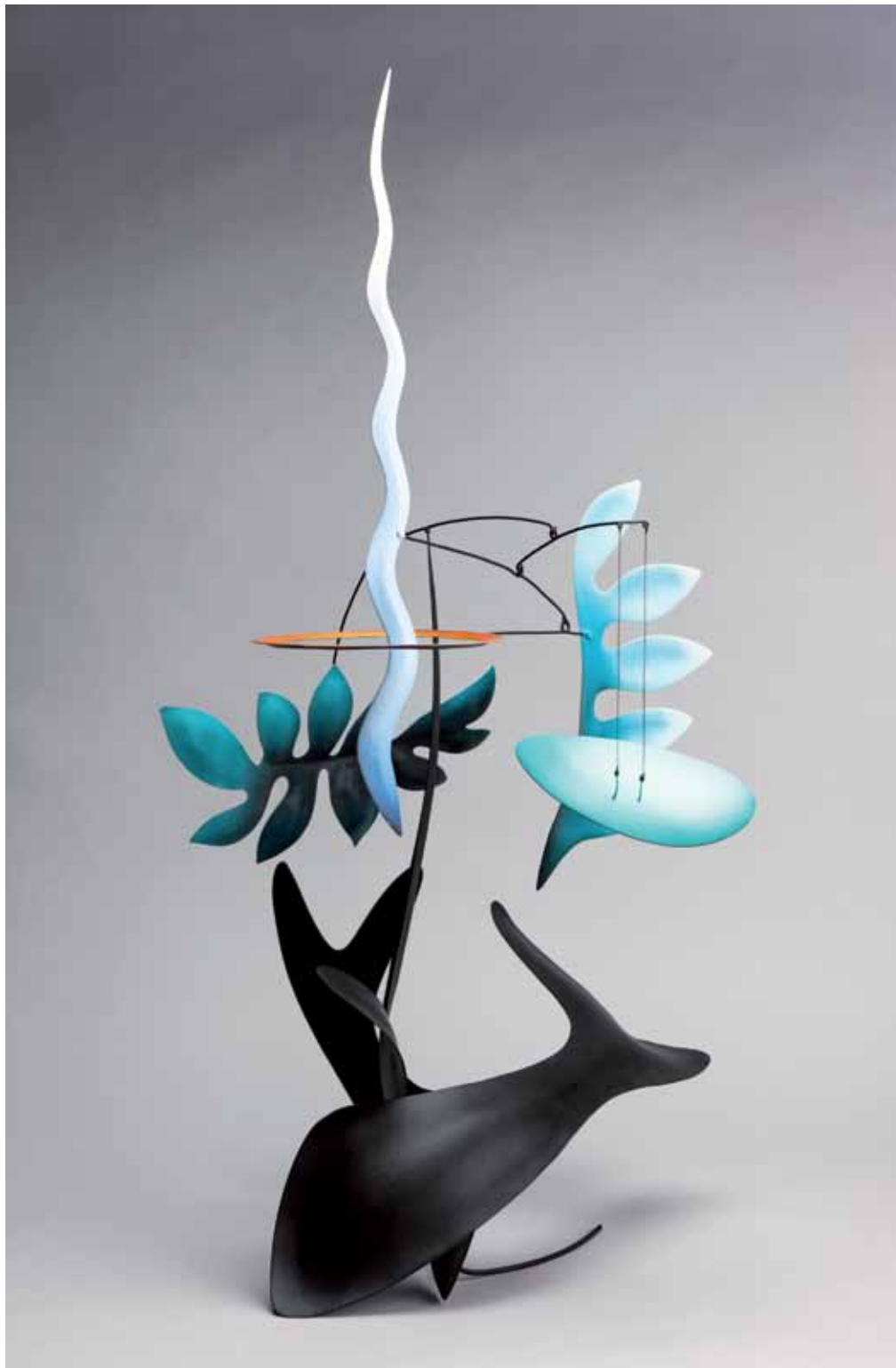
The Liberation of Artemis , 2019

Standing mobile in brass and aluminum with steel wires, oil and acrylic colors and 23 karat gold leaf 33 x 20 x 17"