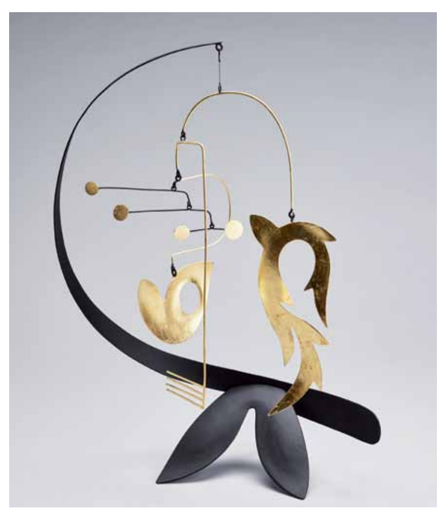
The Developing World Standing mobile in brass and aluminum with nylon cord, oil color and 23 karat gold leaf 16 \times 11 \times 8'' MD851