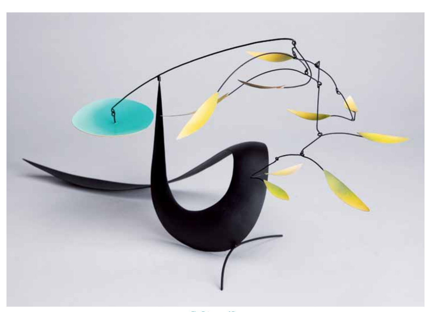
The Existence of Zen Standing mobile in brass and aluminum with steel wires, oil and acrylic colors 11 \times 20 \times 12 " MD910