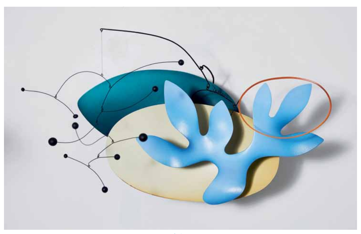
Juniper Wall-mounted mobile in brass and aluminum with steel wires, oil and acrylic colors 13 x 23 x 18" MD916