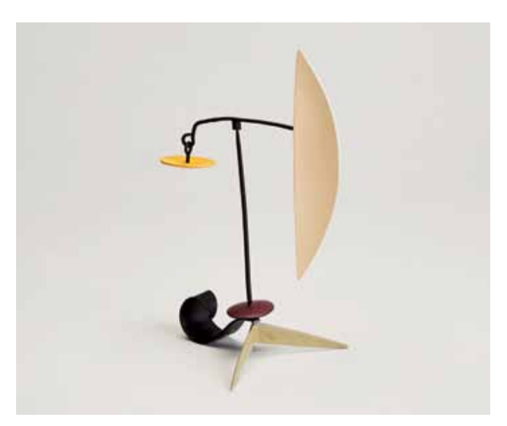
The Basics Standing mobile in brass and aluminum with steel wires, oil and acrylic colors 6\times3\times3.5 " MD866