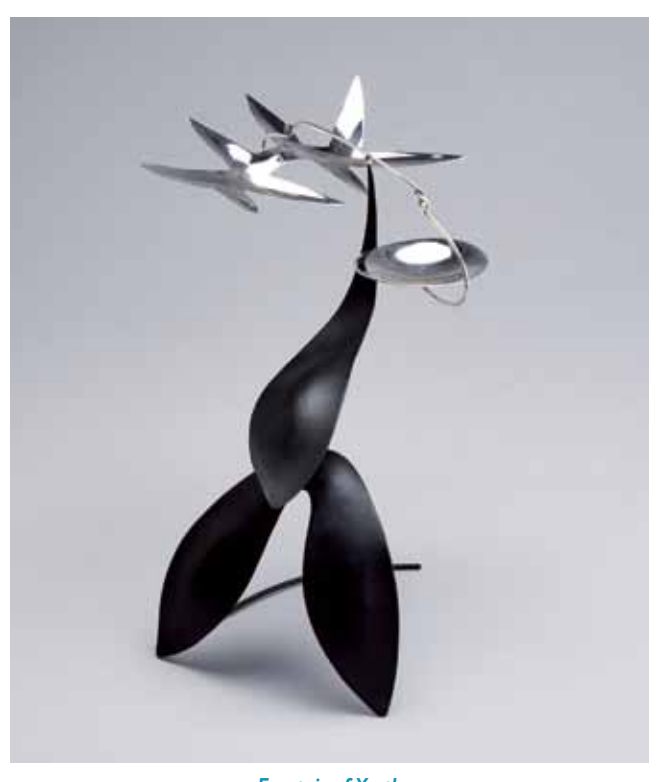
Fountain of Youth Standing mobile in painted brass and sterling silver, oil paint 10 x 10 x 8" MD857

© 2022 Pucker Gallery Printed in the United States by Modern Postcard