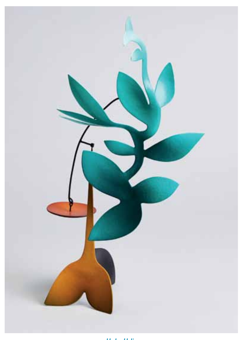
\begin{array}{c} \textit{Hedra Helix} \\ \text{Standing mobile in brass and aluminum with steel wires, oil and acrylic colors} \\ 15 \times 10 \times 7'' \\ \text{MD891} \end{array}