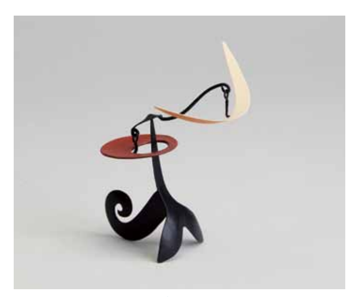
\begin{tabular}{c} \textbf{Contented} \\ \textbf{Standing mobile in brass and steel, oil and acrylic colors} \\ \textbf{3.5} \times \textbf{3.5} \times \textbf{5}'' \\ \textbf{MD874} \\ \end{tabular}