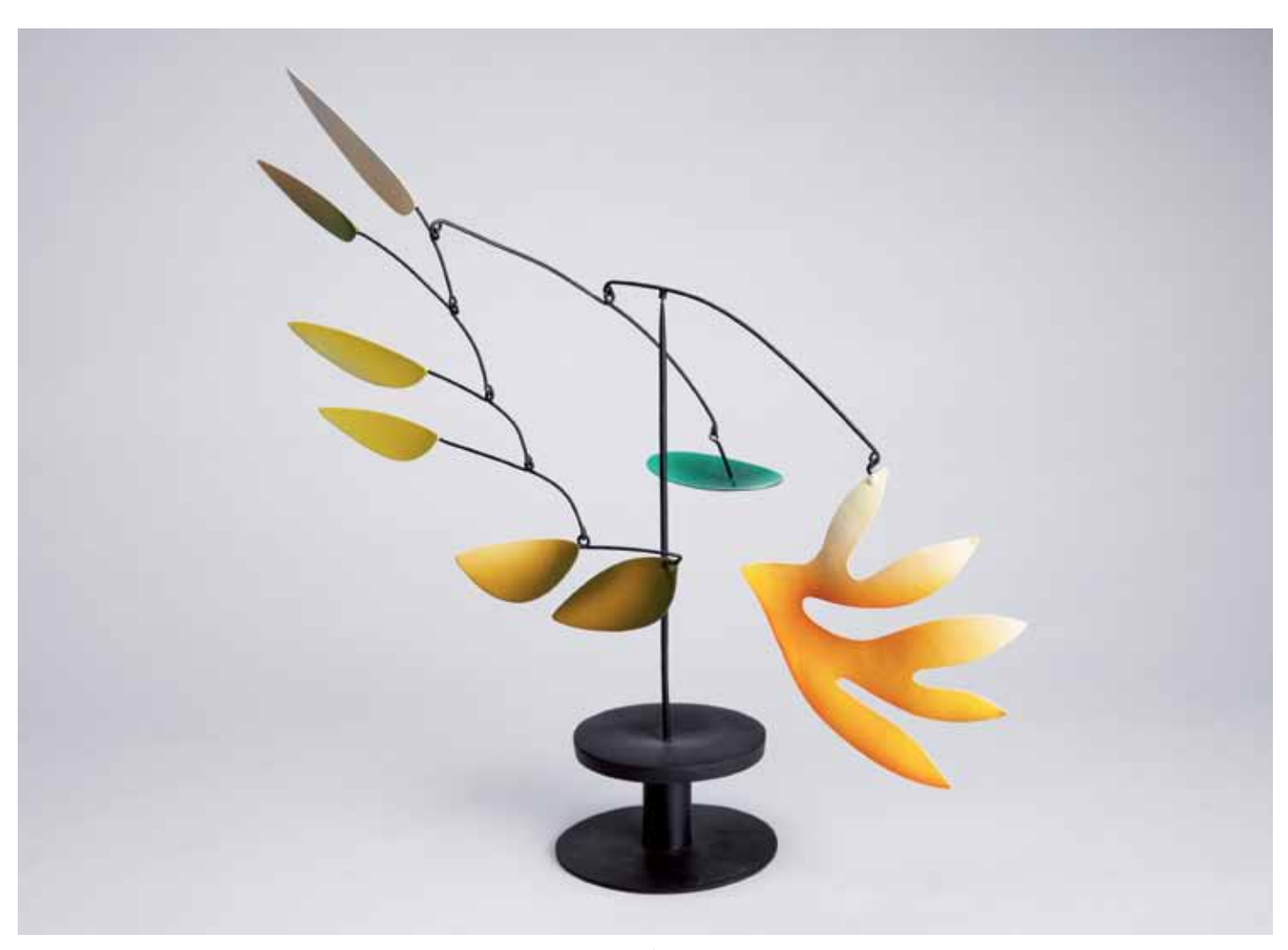
Flying South Standing mobile in brass and aluminum with steel wires, oil and acrylic colors 17 \times 18 \times 9'' MD905