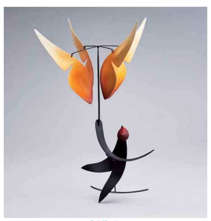
Bird of Paradise Standing mobile in brass and aluminum with steel wires, oil and acrylic colors 15 \times 11 \times 10" MD854