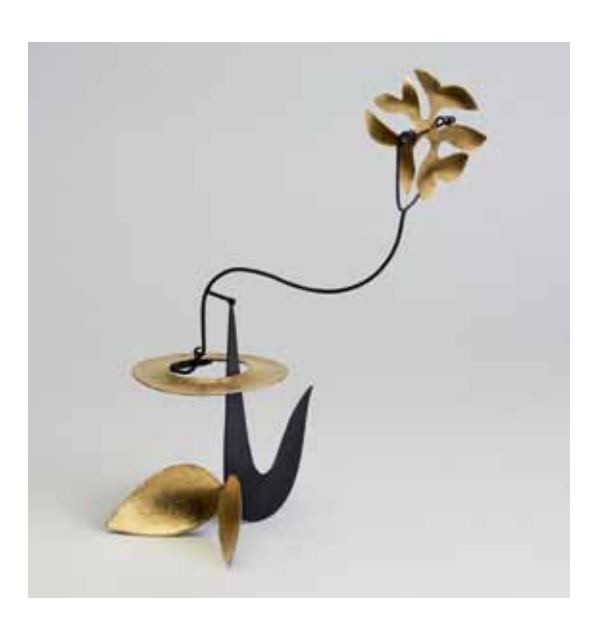
Flourishing Standing mobile in brass and aluminum with steel wires, oil paint and 23 karat gold leaf 11 \times 9 \times 3.5 " MD875