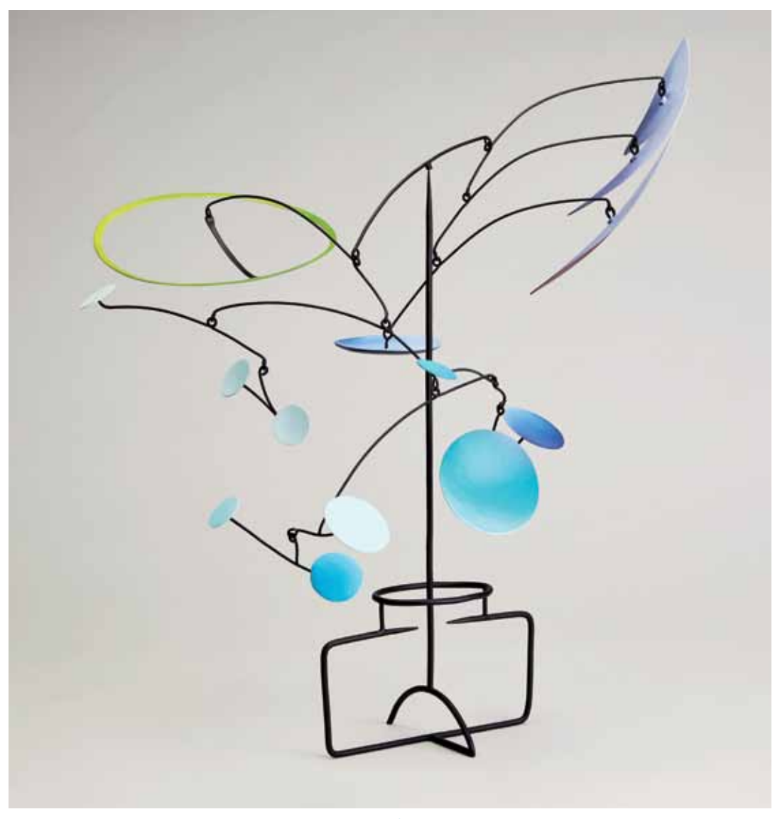
\begin{tabular}{ll} \hline Traveling \ Carnival \\ Standing \ mobile \ in \ brass \ and \ aluminum \ with \ steel \ wires, \ oil \ and \ acrylic \ colors \\ 17 \times 16 \times 15" \\ MD864 \\ \end{tabular}