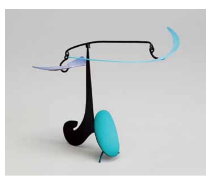
{Light\ Touch} \\ Standing\ mobile\ in\ brass\ and\ steel,\ oil\ and\ acrylic\ colors \\ 4.5\times5\times6''\\ MD872