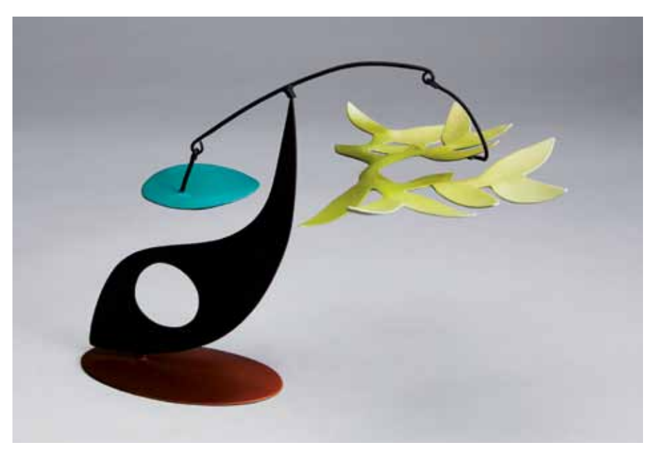
\frac{\textit{Emerging}}{\textit{Standing mobile in brass and aluminum with steel wires, oil and acrylic colors}\\ 6.5 \times 9.5 \times 7''\\ \textit{MD913}