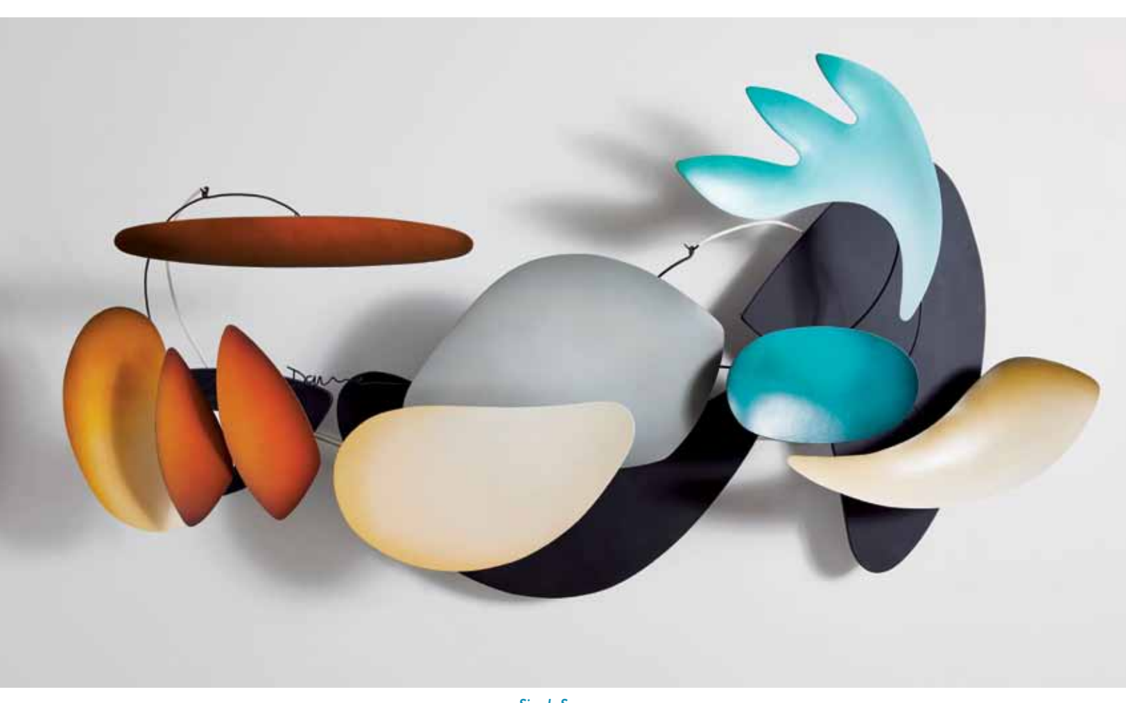
Simple Sequence Wall-mounted mobile in aluminum and acrylic board with steel wires, oil and acrylic colors 23 x 42 x 12" MD915