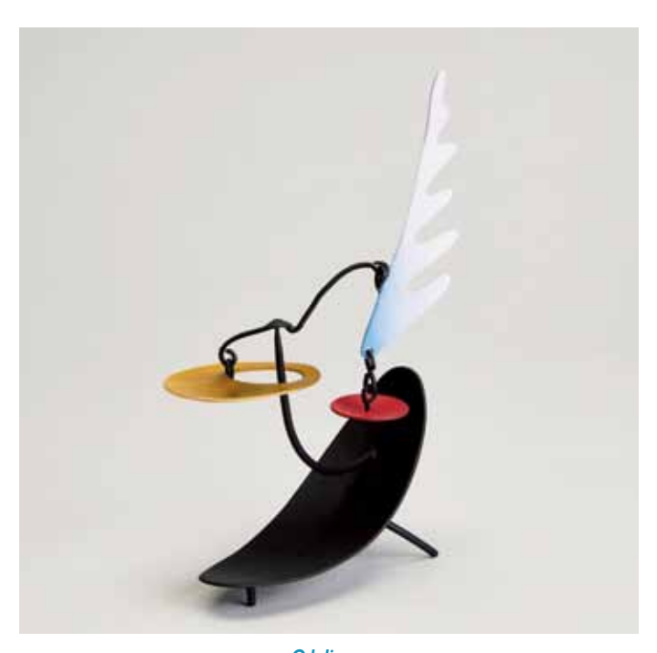
\begin{tabular}{ll} Odalisque \\ Standing mobile in brass and aluminum with steel wires, oil and acrylic colors \\ 7 x 4 x 4" \\ MD868 \end{tabular}