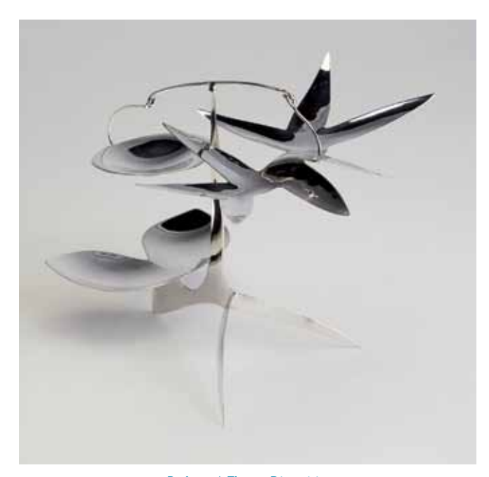
Perhaps A Thorny Disposition Standing mobile in sterling silver 7 x 8 x 7" MD873