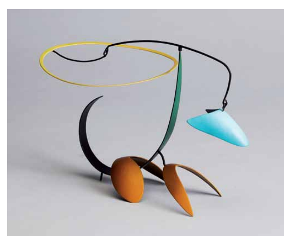
\begin{tabular}{ll} \hline Perrito \\ Standing mobile in brass and steel, oil and acrylic colors \\ 7 x 11 x 6" \\ MD884 \\ \end{tabular}