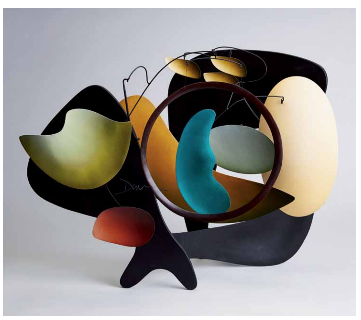
\frac{Other\ Worlds}{S tanding\ mobile\ in\ aluminum\ and\ brass\ with\ steel\ wires\ and\ acrylic\ board,\ oil\ and\ acrylic\ colors}{20\times24\times18"} MD889