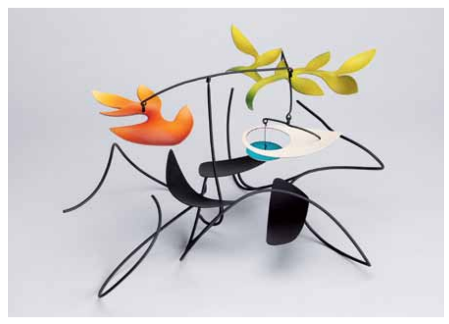
A Lengthy Conversation Standing mobile in brass and aluminum with steel wires, oil and acrylic colors 7.5 x 12 x 11" MD904