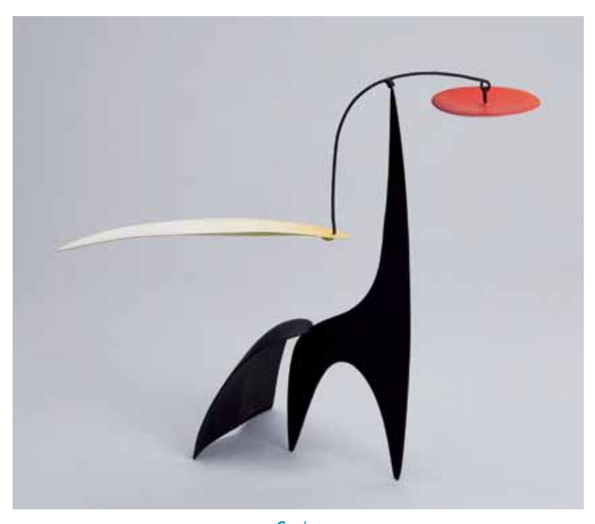
\begin{tabular}{ll} Grazing \\ Standing mobile in brass and aluminum with steel wires, oil and acrylic colors \\ 10 \times 10.5 \times 3.5" \\ MD918 \end{tabular}