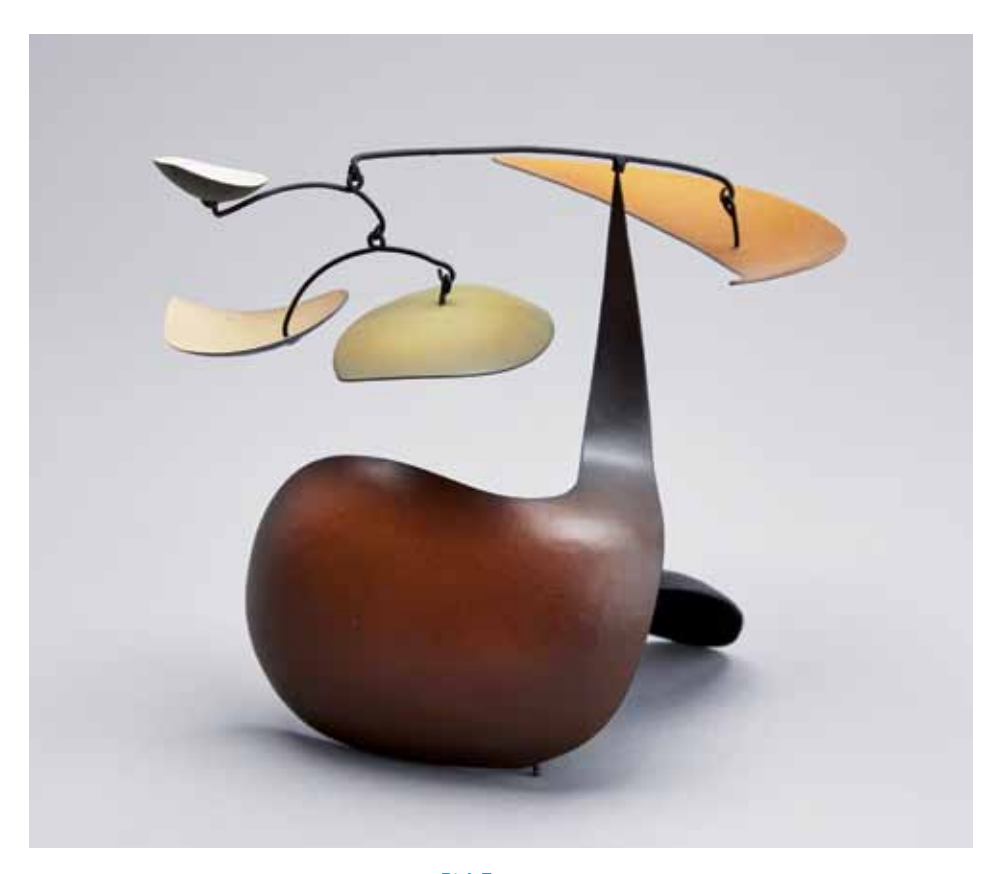
\begin{array}{c} \textit{Rich Tapestry} \\ \text{Standing mobile in brass and aluminum with steel wires, oil and acrylic colors} \\ 8 \times 10 \times 6'' \\ \text{MD856} \end{array}