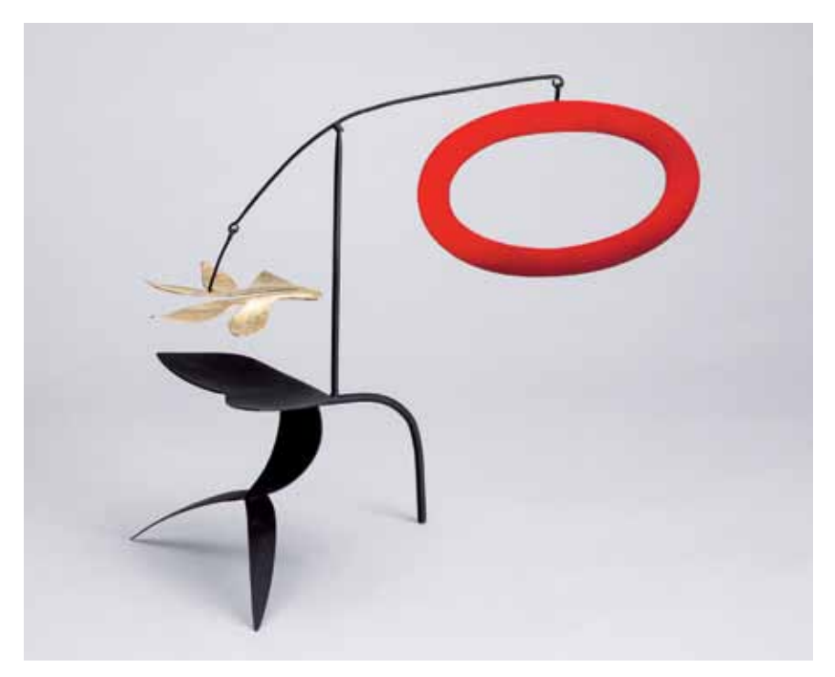
Aristocratic Standing mobile in brass and aluminum with steel wires, oil and acrylic colors, and 23 karat gold leaf 10 x 12 x 6" MD902