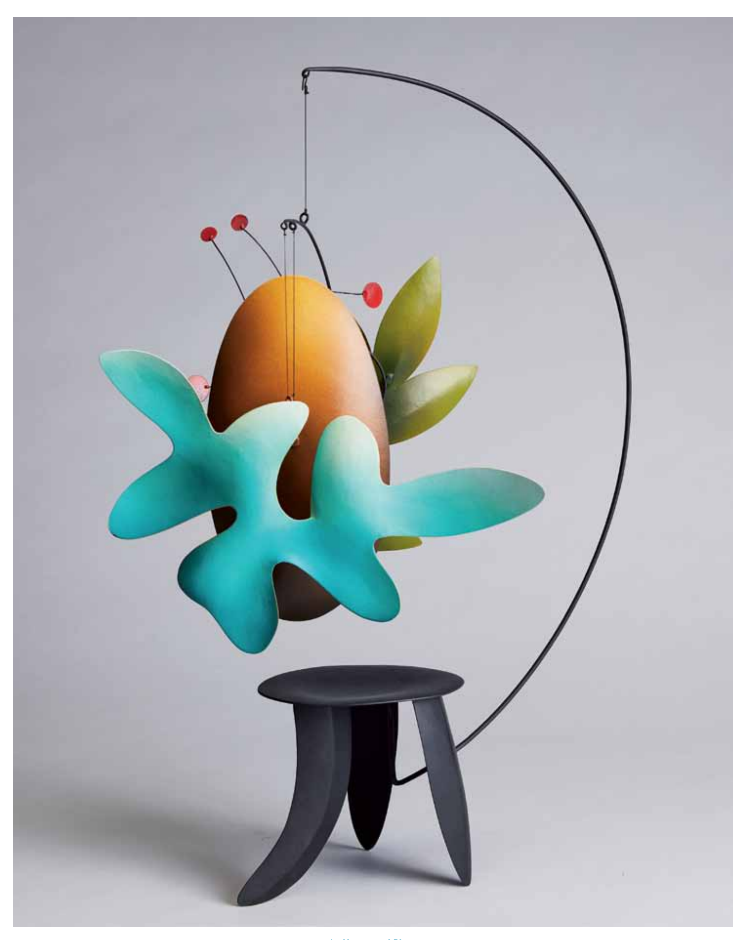
\frac{An\ Unexpected\ Bloom}{\text{Standing mobile in brass and aluminum with steel wires and nylon cord, oil and acrylic colors}}{22\times17\times12''} \frac{AD885}{\text{MD885}}