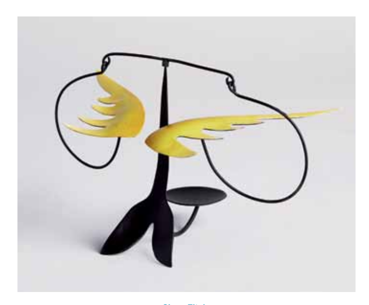
\frac{\textit{Short Flight}}{\textit{Small standing mobile in brass and aluminum with steel wires, oil and acrylic colors}\\ 4.5\times4.5\times7"\\ \textit{MD860}