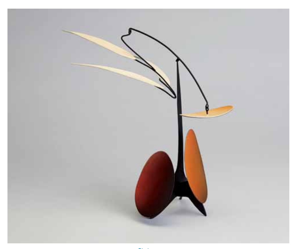
\begin{tabular}{ll} {\it Pizzicato} \\ {\it Standing mobile in brass and aluminum with steel wires, oil and acrylic colors} \\ {\it 10 x 12 x 7''} \\ {\it MD871} \\ \end{tabular}