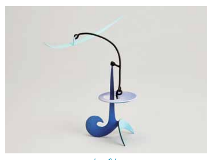
Inner Calm Standing mobile in brass and aluminum with steel wires, oil and acrylic colors 4.5 \times 5.5 \times 4'' MD867