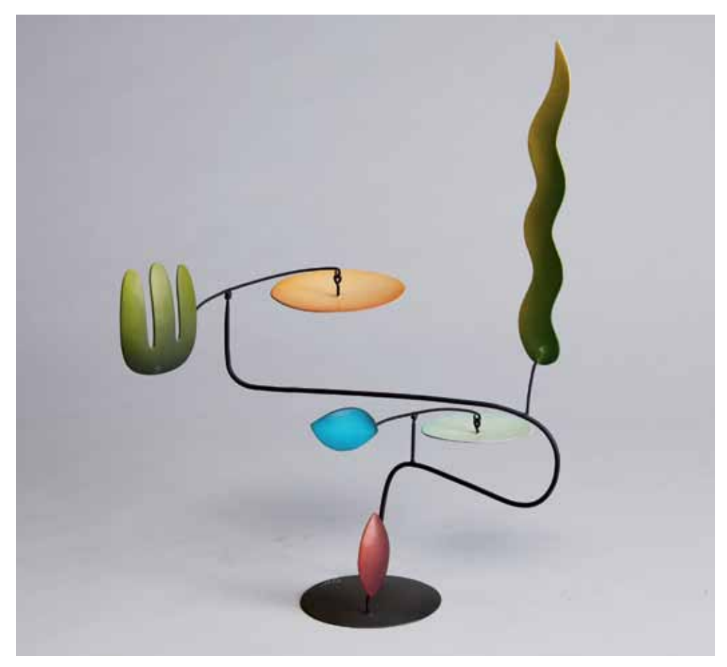
Navigating the Terrain Standing mobile in brass and aluminum with steel wires, oil and acrylic colors 14 \times 13 \times 8 " MD883