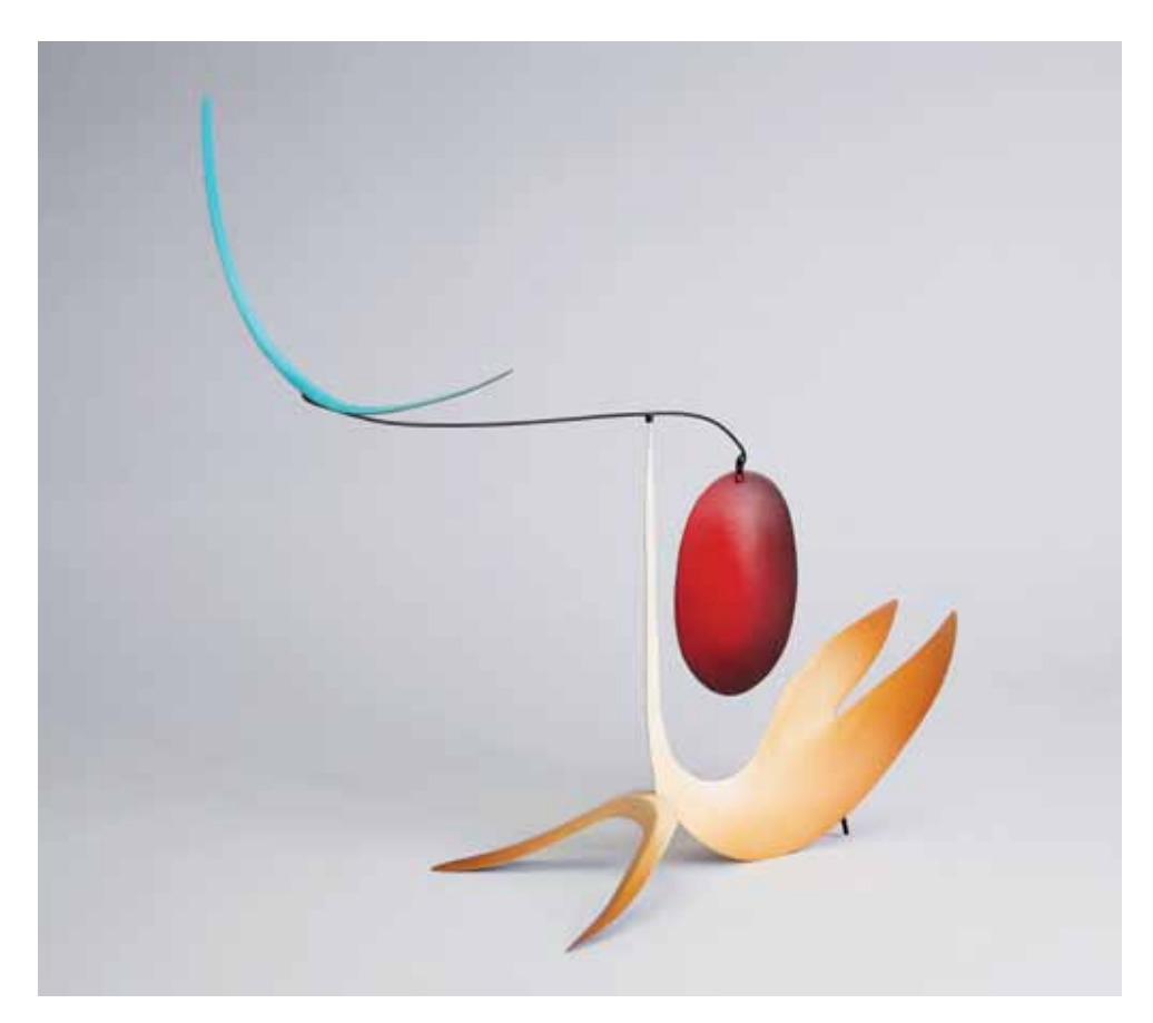
Flying in Circles Standing mobile in brass and aluminum with steel wires, oil and acrylic colors 17 \times 15 \times 12 " MD897