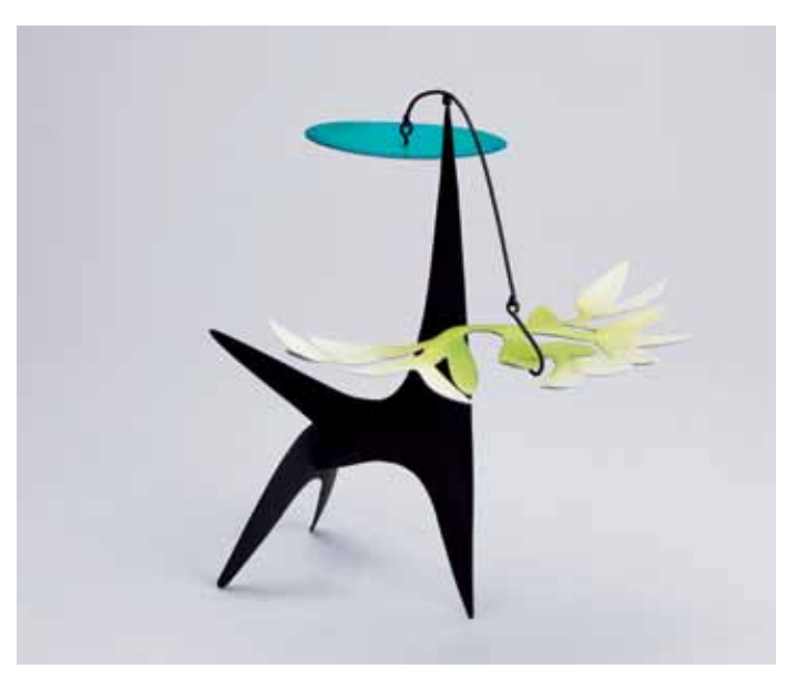
\begin{tabular}{ll} We stern P leasure \\ Standing mobile in brass and aluminum with steel wires, oil and acrylic colors \\ 9.5 \times 9.5 \times 7.5" \\ MD917 \end{tabular}