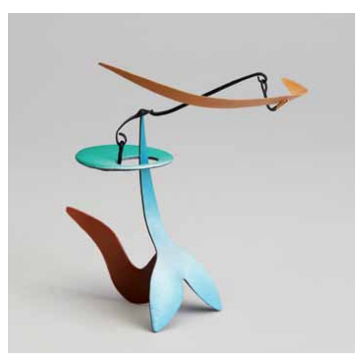
\begin{tabular}{ll} Happy Days \\ Standing mobile in brass and steel, oil and acrylic colors \\ 4.5 \times 7 \times 5" \\ MD877 \end{tabular}