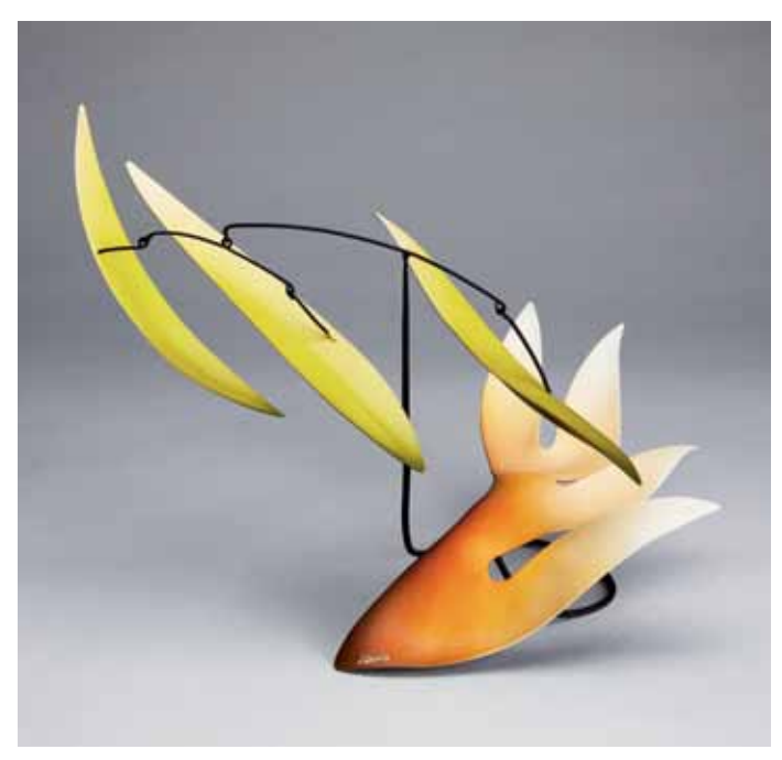
First Blush Standing mobile in brass and aluminum with steel wires, oil and acrylic colors 11 \times 18 \times 11'' MD912