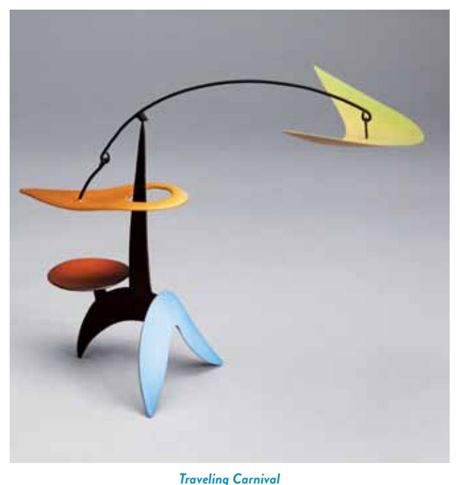
Standing mobile in brass and aluminum with steel wires, oil and acrylic colors 7 \times 9 \times 6 " MD914