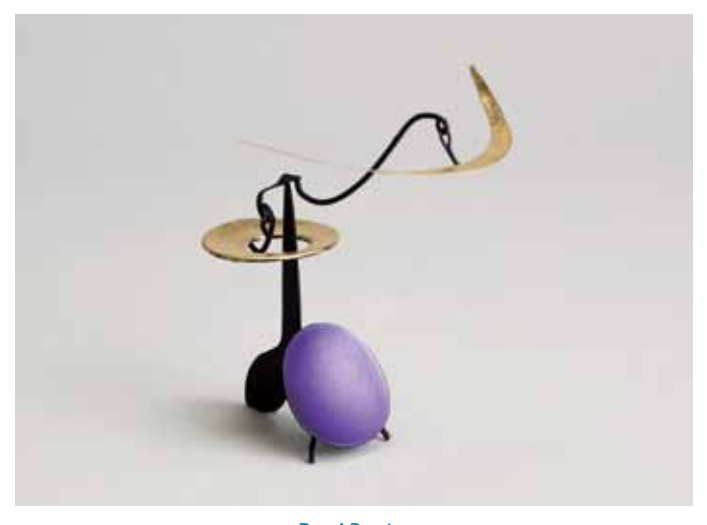
Regal Bearing Standing mobile in brass and steel, oil and acrylic colors and 23 karat gold leaf 4\times4\times4'' MD878