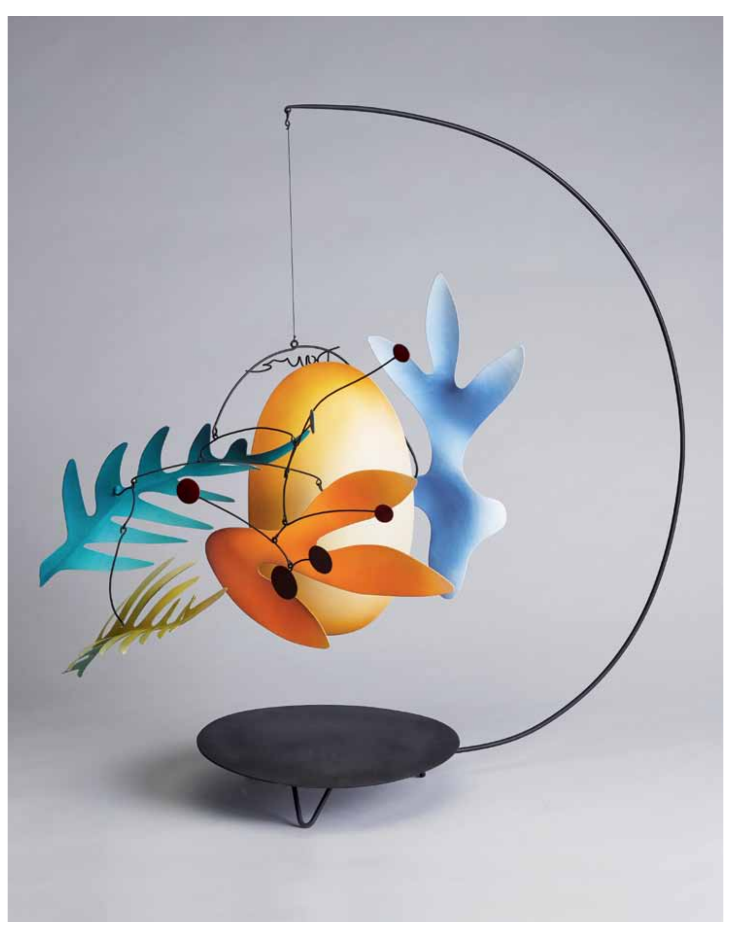
The Wilds of the Jungle Standing mobile in aluminum with steel wires, oil, acrylic colors and nylon cord 26.75 x 22 x 25" MD879