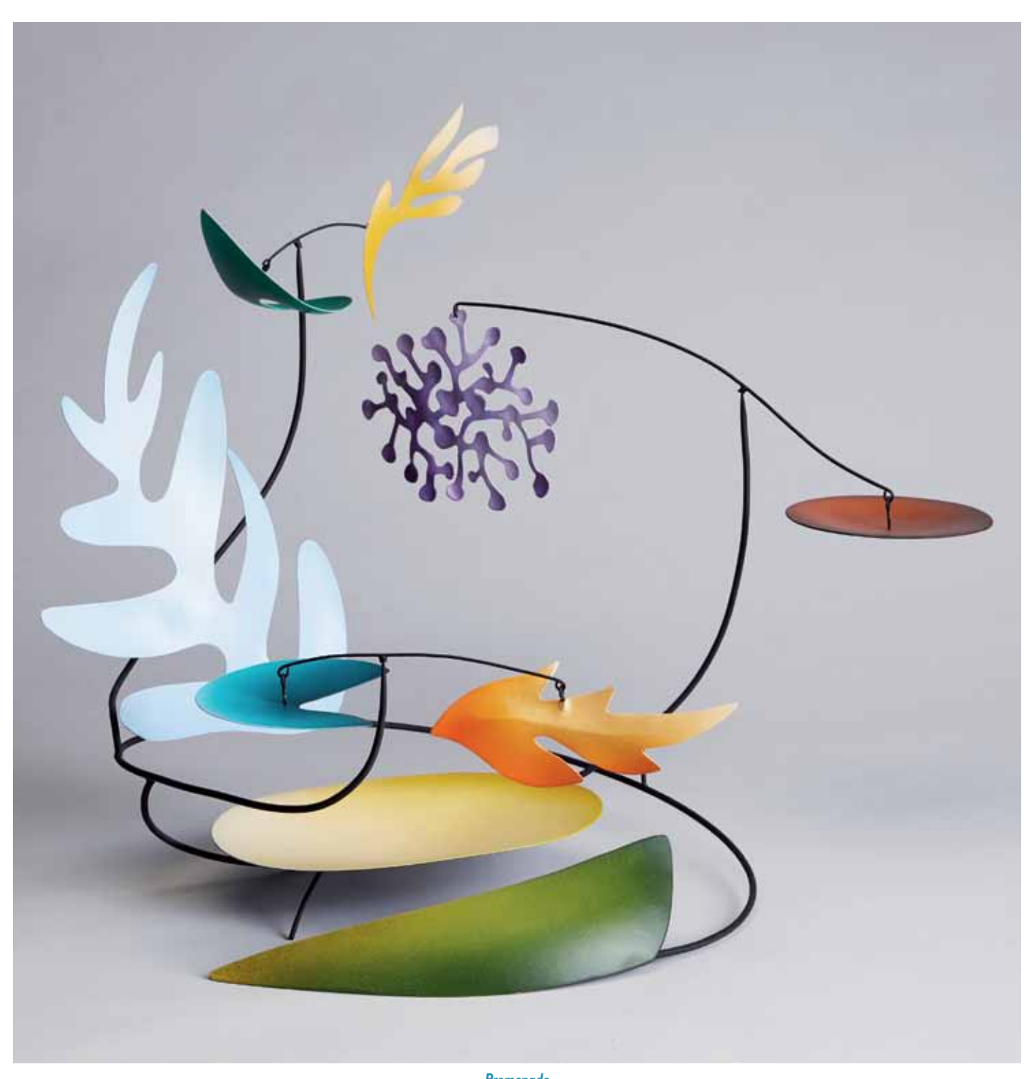
Promenade Standing mobile with three spinning parts in brass and aluminum with steel wires, oil and acrylic colors 16 x 19 x 25" MD881