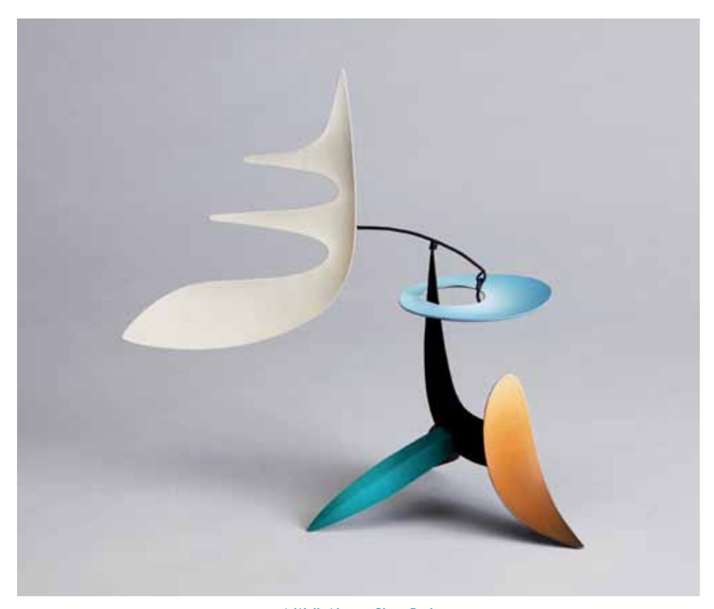
A Walk Along a Short Path Standing mobile in brass and aluminum with steel wires, oil and acrylic colors 10 \times 9.5 \times 5.5'' MD880