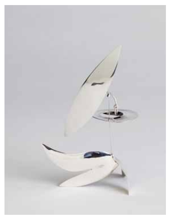
Cantilever Standing mobile in sterling silver 7.5 x 5 x 4" MD886