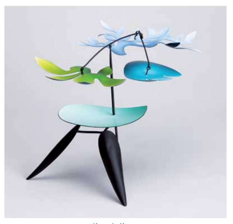
Alternative Natures Standing mobile in brass and aluminum with steel wires, oil and acrylic colors 9 \times 11 \times 12'' MD908