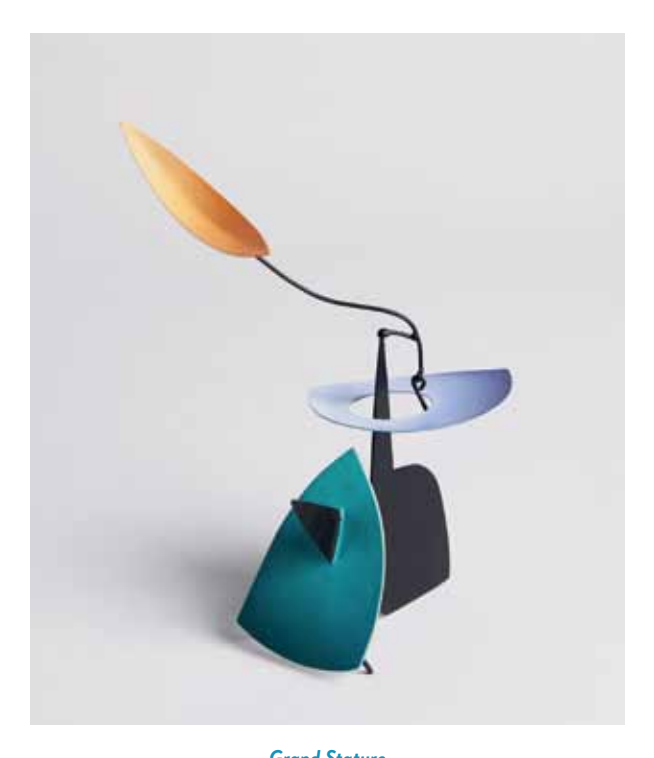
Grand Stature Standing mobile in brass and aluminum with steel wires, oil and acrylic colors 8 x 5 x 7" MD861