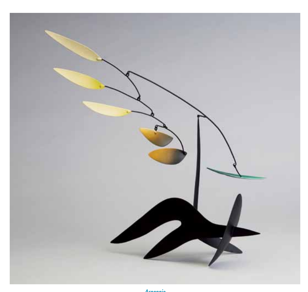
\frac{Arpeggio}{\text{Standing mobile in brass and aluminum with steel wires, oil and acrylic colors}} \\ 16 \times 19 \times 6" \\ \text{MD876}