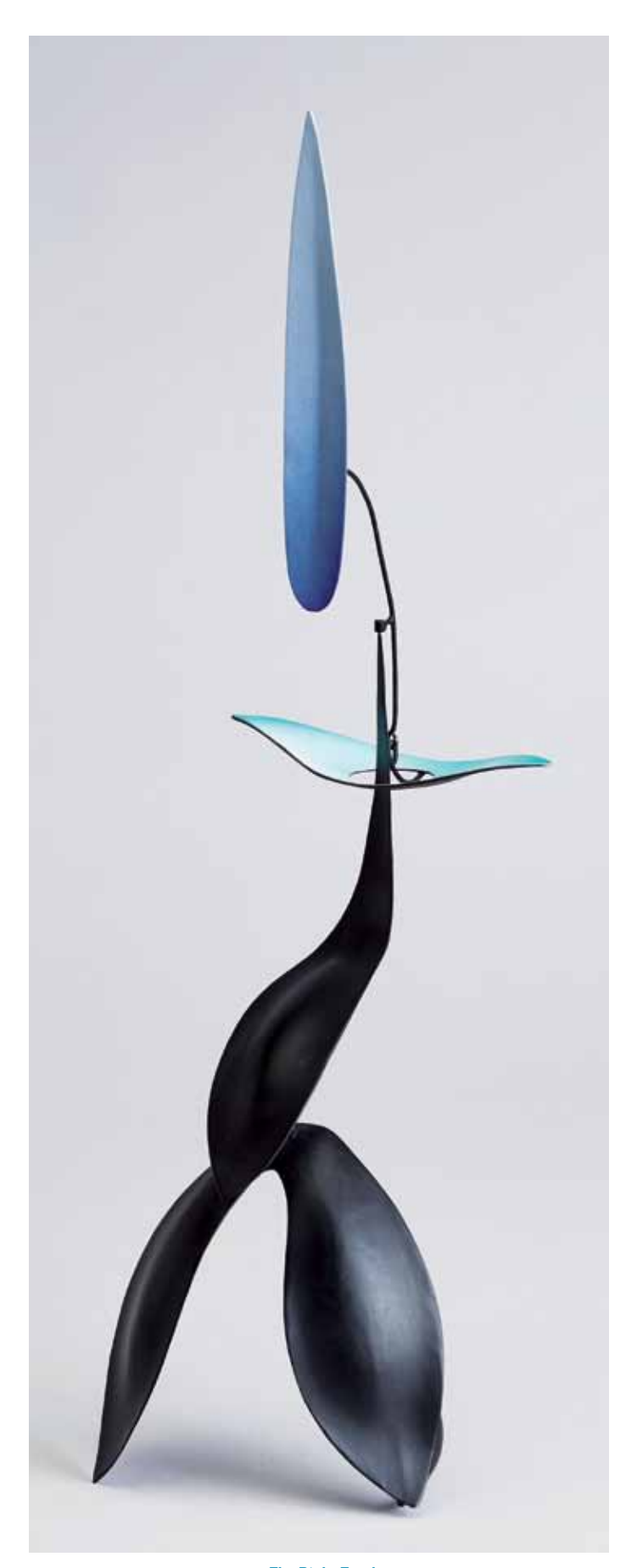
The Right Touch Standing mobile in brass and aluminum with steel wires, oil and acrylic colors 17\times6\times7'' MD896