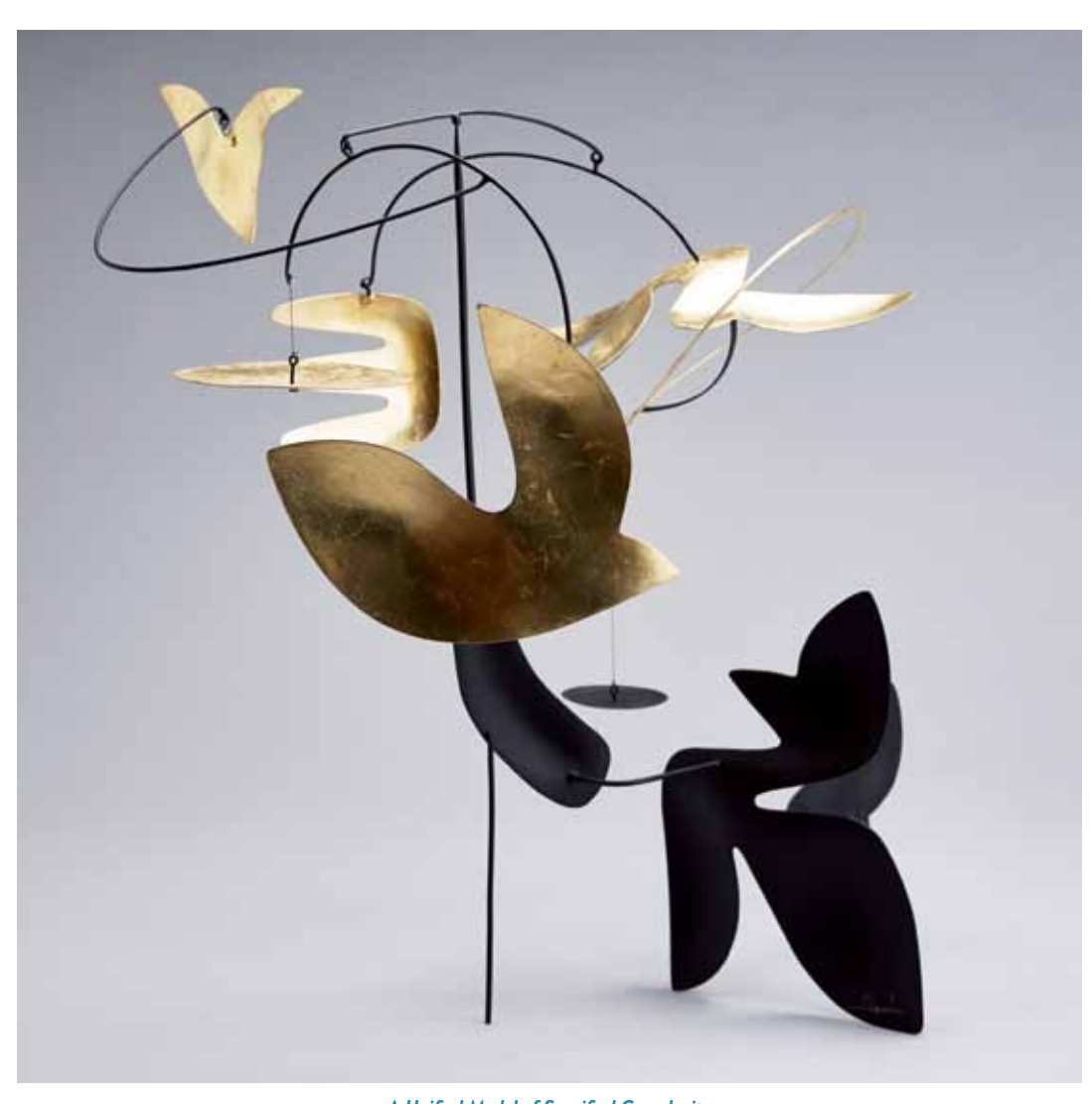
A Unified Model of Specified Complexity Standing mobile in brass and aluminum with steel wires and nylon cord, oil color and 23 karat gold leaf 19 \times 17 \times 13 " MD850