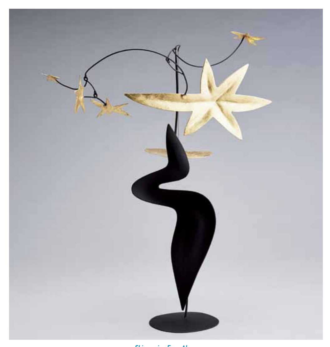
Shimmering From Above Standing mobile in brass and aluminum with steel wires and nylon cord, oil color and 23 karat gold leaf 17 x 12 x 11" MD852