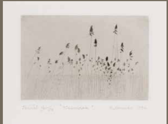
Vassivipor (Reed Panicles) , 1974 Drypoint, 4/30 2 x 3" #388

“The poet sees better than other mortals. I do not see things as they are, but according to my own subjective impression, and this makes life easier and simpler.”