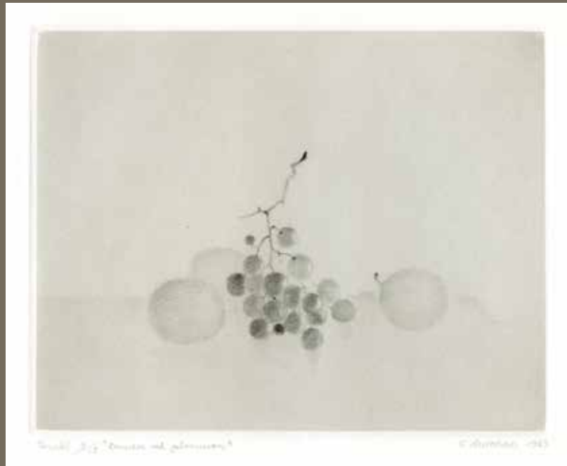
Druvor och plommen (Grapes and Plums) , 1983 Drypoint, 11/15 4.5 x 5.5" #617