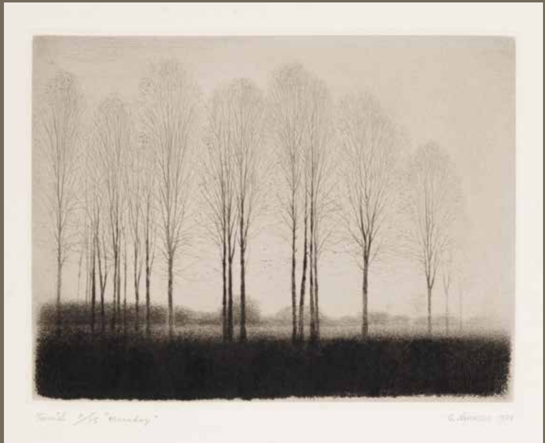
Marsdag (Day in March), 1975 Drypoint, 11/15 5.75 x 8" #405

“My music created for the soul is a world apart from daily life, a sanctuary where all is pure emotion.”