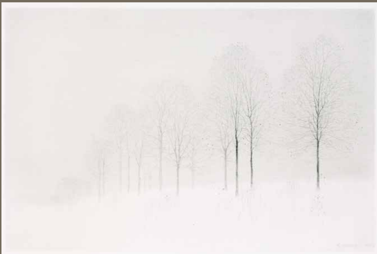
Vinterträd (Winter Tree) , 1974 Pencil 6 x 9.25"