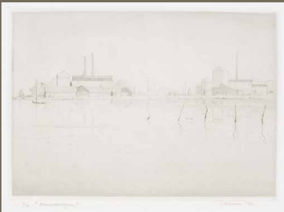
Sommarmorgon (Summer Morning) , 1941 Drypoint, 7/10 5.5 x 7.5" #3

“Without craftsmanship, inspiration is a mere reed shaken in the wind.”