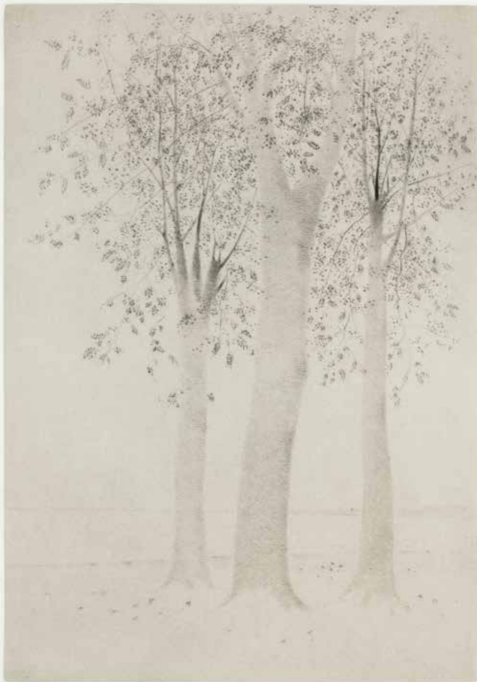
Robinia (Black Locust), 1984 Drypoint, 9/18 15.5 x 6.75" #654