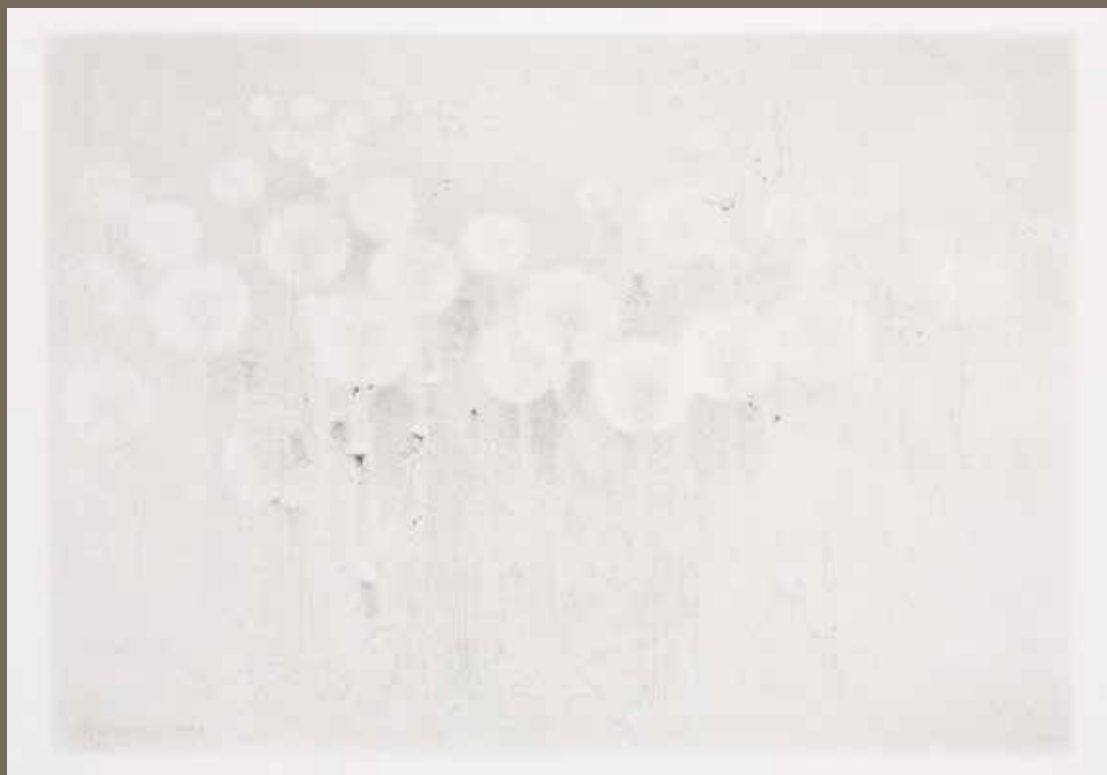
Dunbollar (Puffballs) , 1973 Pencil 6.75 x 9.25"