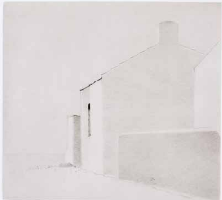
Hus vid havet (House by the Sea) , 1975 Drypoint, 19/20 7 x 7.5" #406