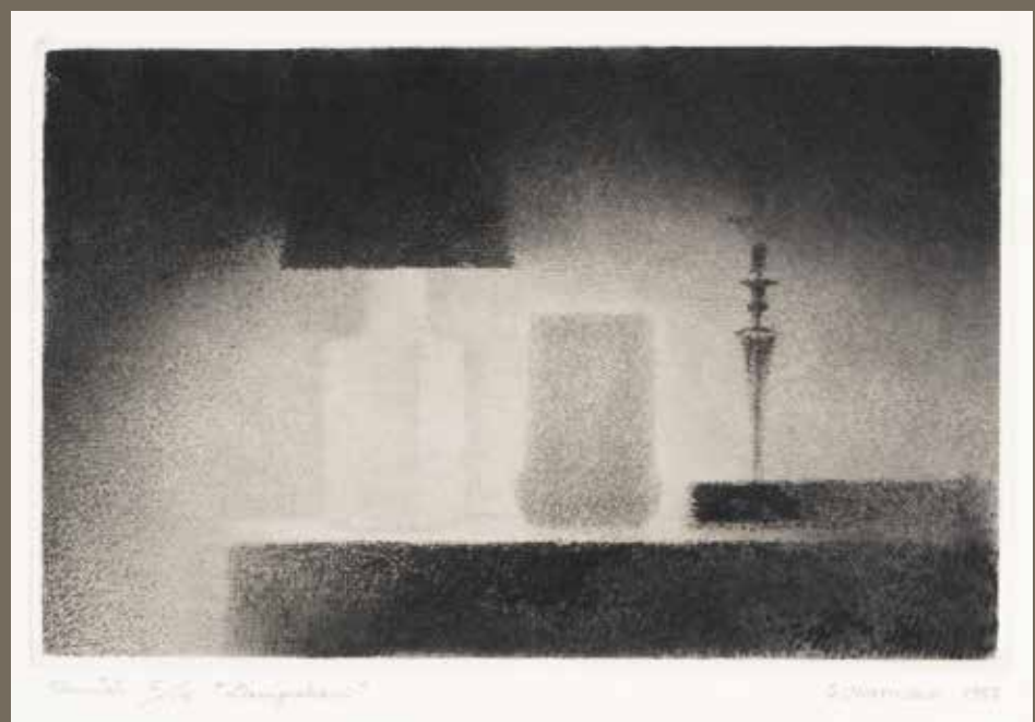
Lampsken (Lamplight), 1987 Drypoint, 5/10 4.5 x 7" #751