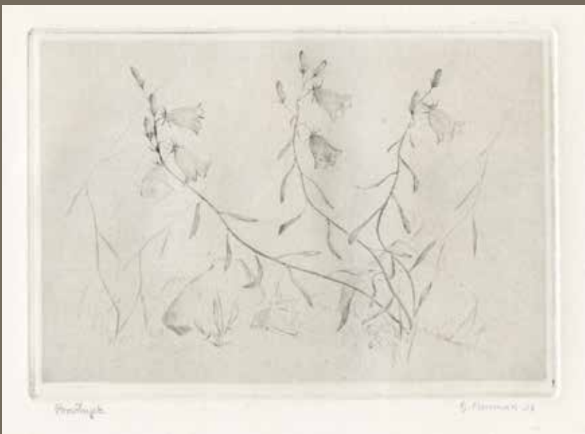
Blåklockor (Harebells) , 1942 Drypoint, Proof 3.75 x 5.5" #4

“We have learned to express more delicate nuances of feeling by penetrating more deeply into the mysteries of harmony.”