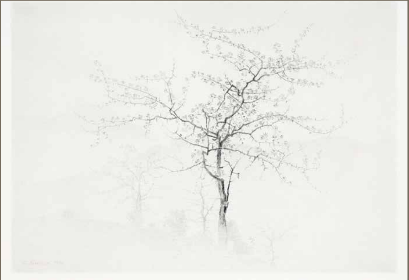
Appelträd (Apple Tree) , 1976 Pencil 7 x 9"