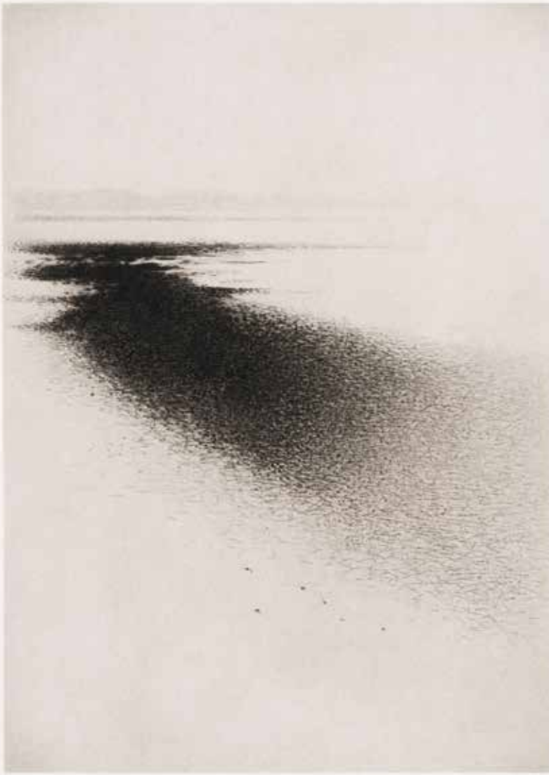
Mörk revel (Dark Shoal) , 1977 Drypoint, 15/18 9 x 6" #458

“Simplicity is the final achievement. After one has played a vast quantity of notes and more notes, it is simplicity that emerges as the crowning reward of art.”