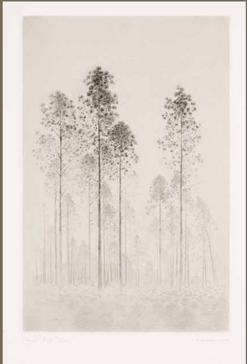
Tallar (Pines) , 1974 Drypoint, 8/15 9 x 5.5" #381