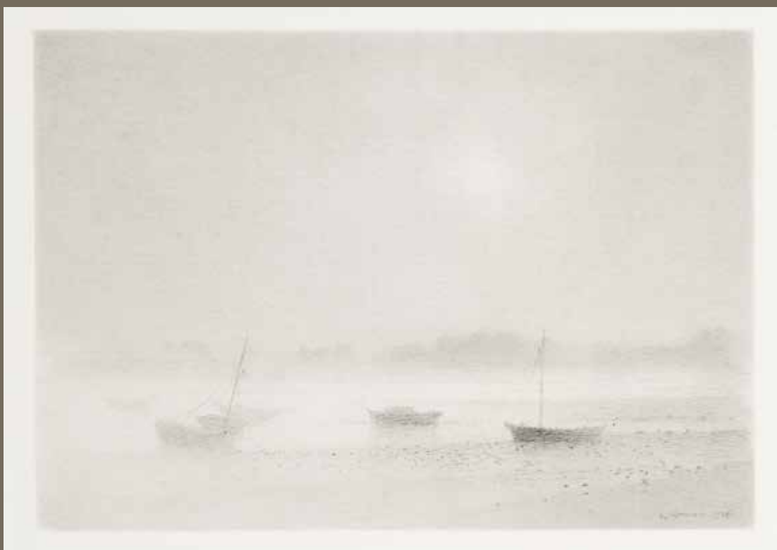
Sandrevlar och båtär (Shoals and Boats) , 1976 Pencil 5.75 x 8"