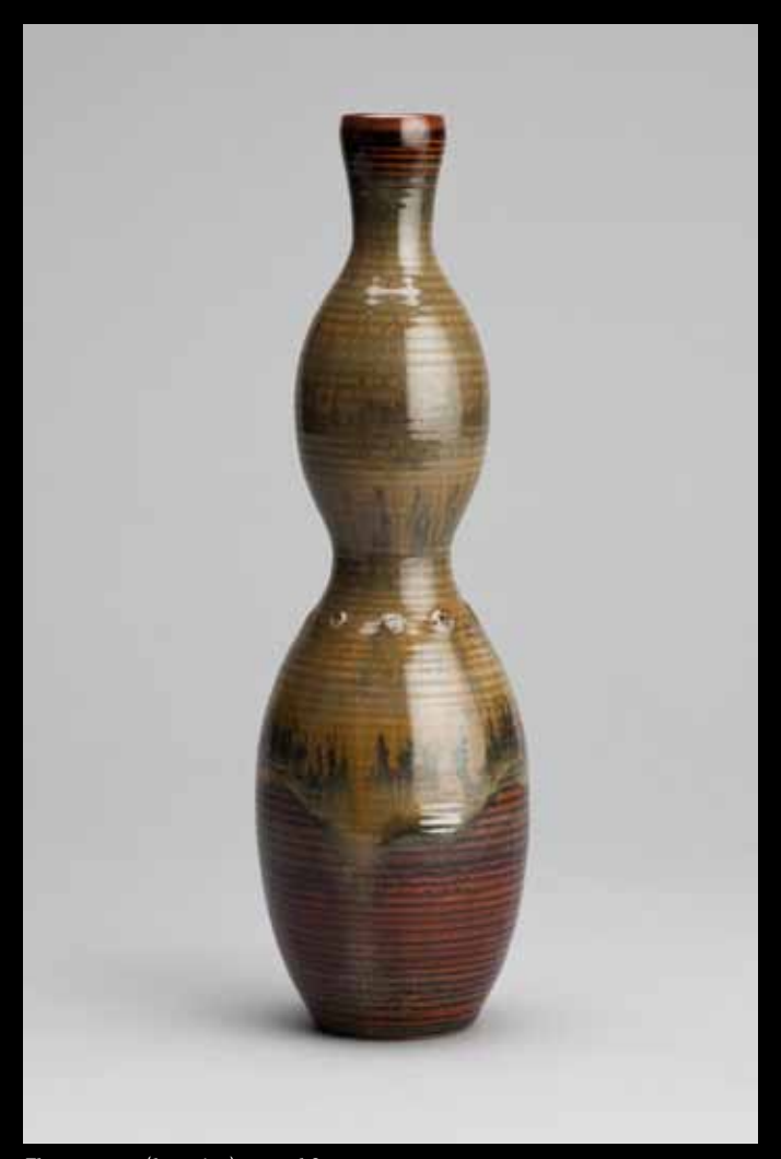
Flower vase (hanaire), gourd form Takatori glaze II.5 x 3.5 x 3.5" XV158