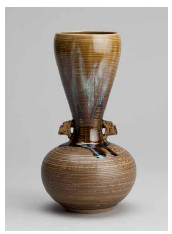
Flower vase (hanaire), turnip form with ginko leaf handles Takatori glaze 9.5 \times 4.5 \times 4.5 ° XVI57