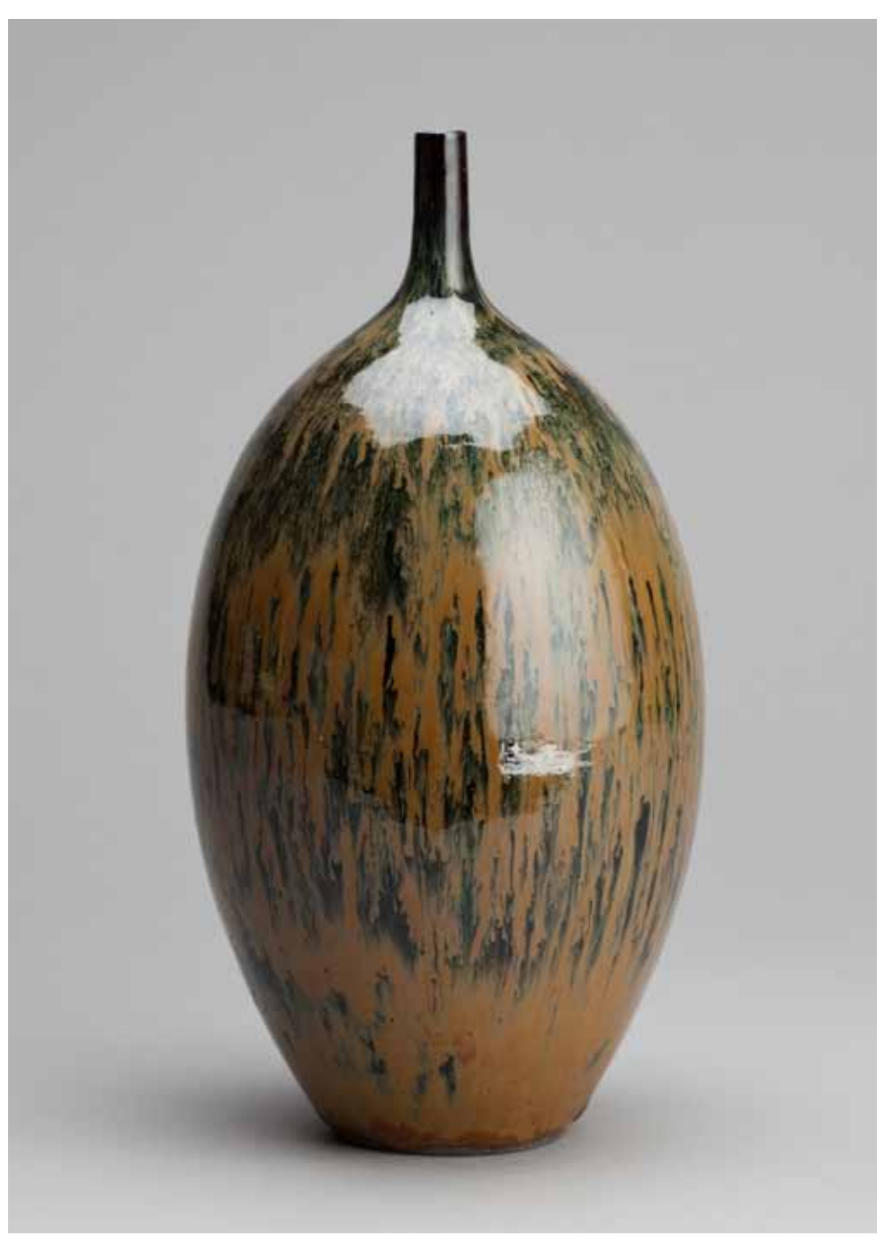
Narrow mouth pot (tsubo) Takatori glaze Il x 5.5 x 5.5" HKI3