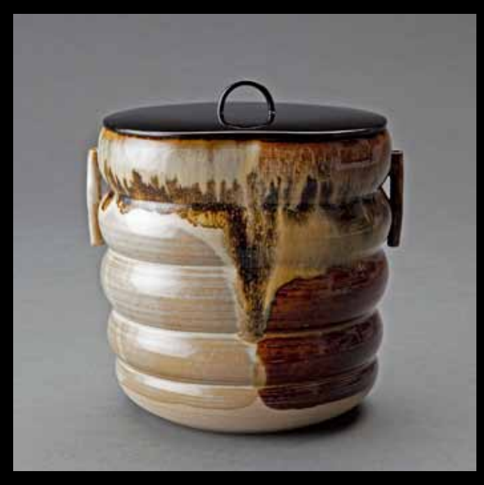
Water container (mizusashi) with lacquer lid, sendanmaki incising 7.5 \times 6.5 \times 5.5 " XVI50