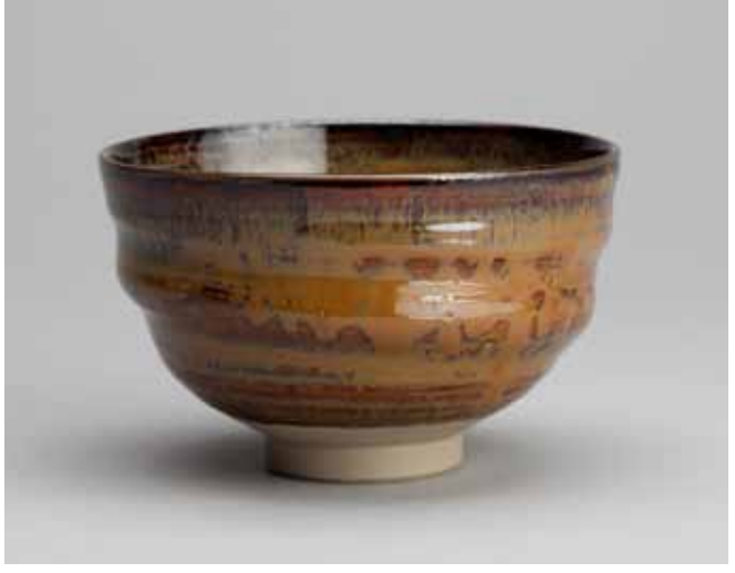
Tea bowl (chawan) Takatori yellow glaze 3.75 x 5 x 5" HK21