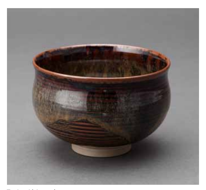
Tea bowl (chawan) Yellow glaze 3 x 4.5 x 4.5" XV74