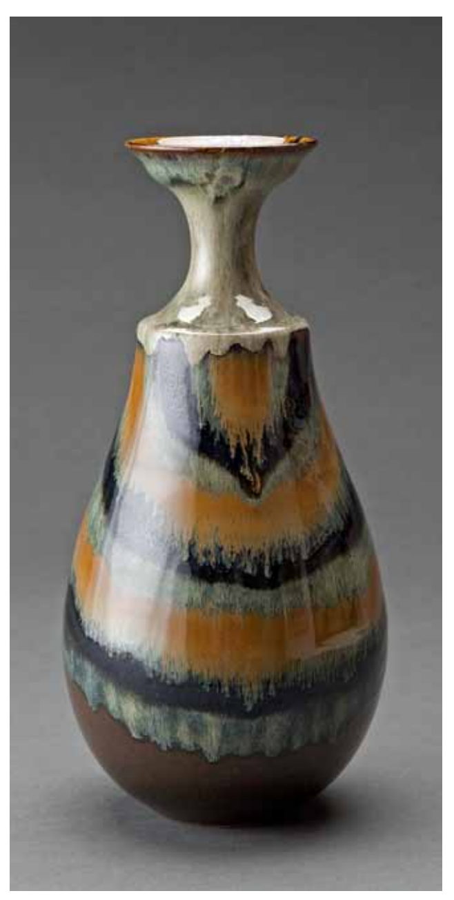
Vase Dyed glaze 13 x 6 x 6" XVI35