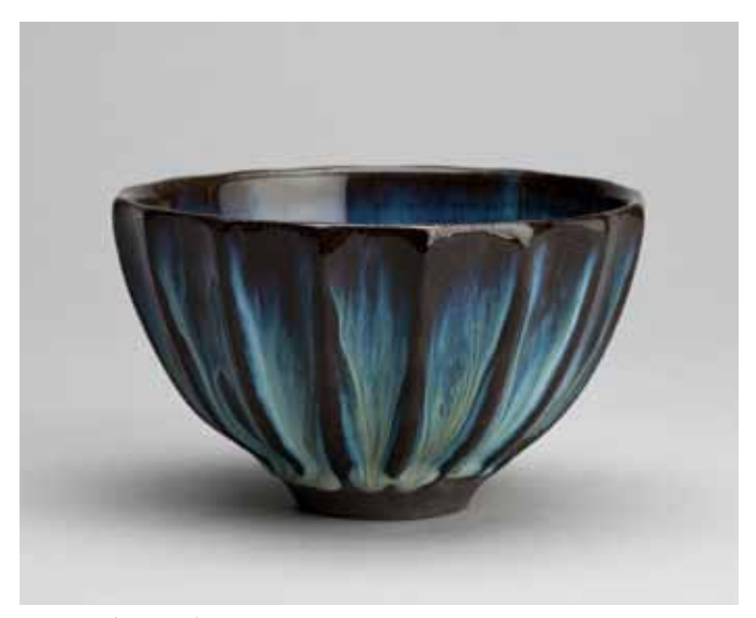
Tea bowl (chawan) Takatori glaze 3.25 x 5.5 x 5.5" HKI7