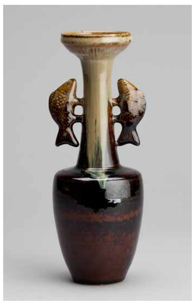
Flower vase (hanaire), with fish handles Takatori ame glaze 10.5 \times 3.75 \times 3.75 ° XVI54