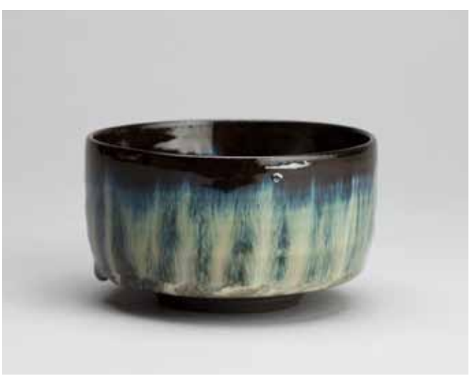
Tea bowl (chawan) Takatori glaze 2.5 x 4.5 x 4.5" HKI8