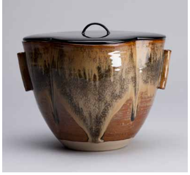
Water container (mizusashi) with lacquer lid, cloud form Kakewake glaze 6 \times 8.5 \times 8.5^{\circ} XVI73 With wooden box