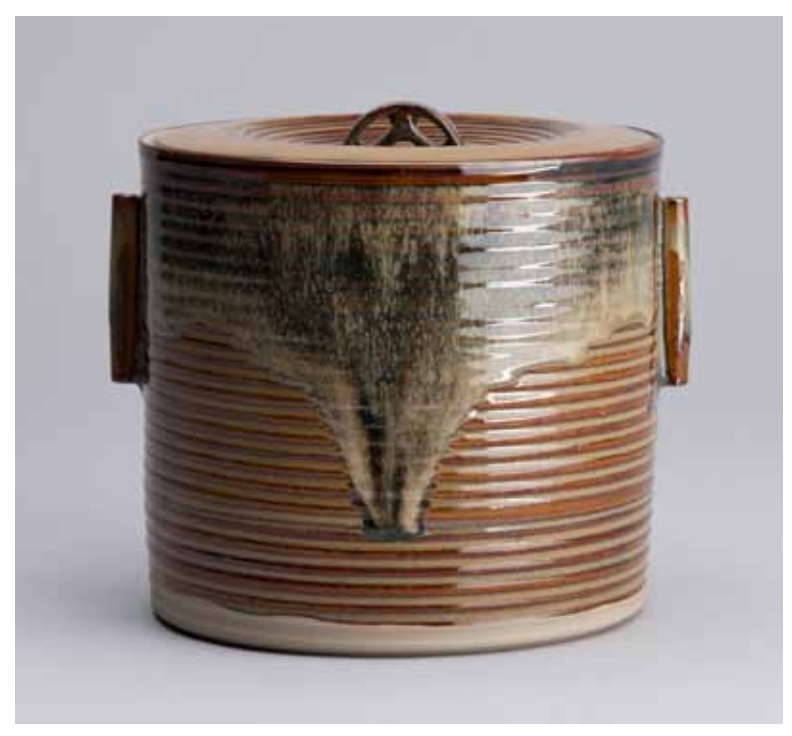
Water container (mizusashi) with ceramic lid and cylindrical handles Kakewake glaze 5.5 \times 7 \times 7^{\circ} XVI72 With wooden box