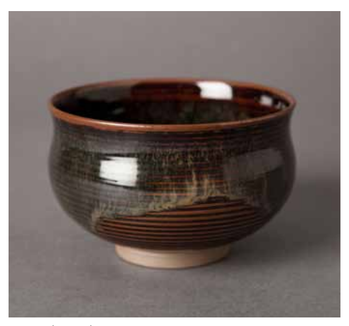
Tea bowl (chawan) Ame glaze 3 x 4.5 x 4.5" XV56