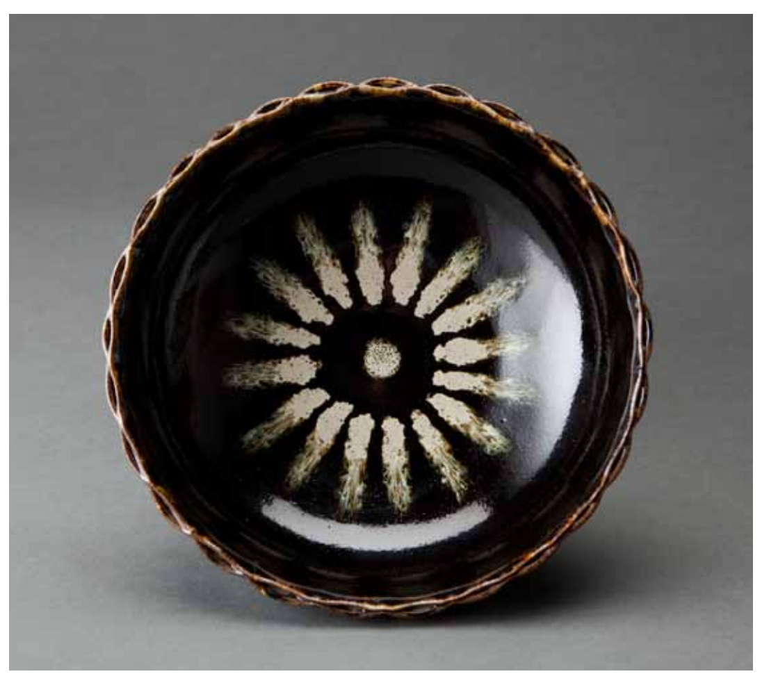
Sweets tray (kashiki) Black glaze 3 x 9.5 x 9.5" XVI40