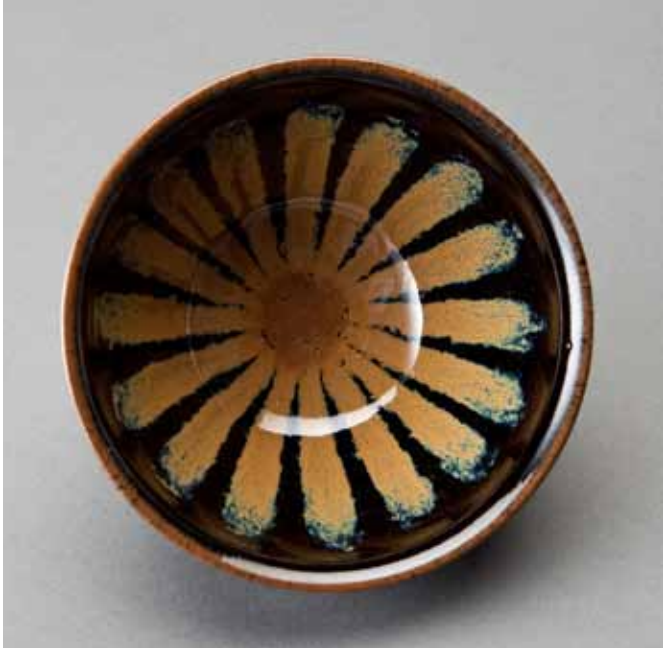
Tea bowl (chawan) Black tenmoku and yellow glaze 2.75 x 5.25 x 5.25" XVI45