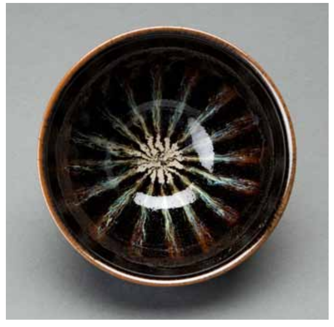
Tea bowl (chawan) Black tenmoku and white glaze 3 x 5.25 x 5.25* XVI46