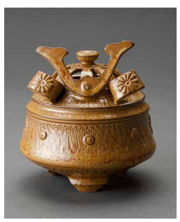
Incense burner (koro), helmet form with golden flower pattern 6\times5\times5^\circ XVI48