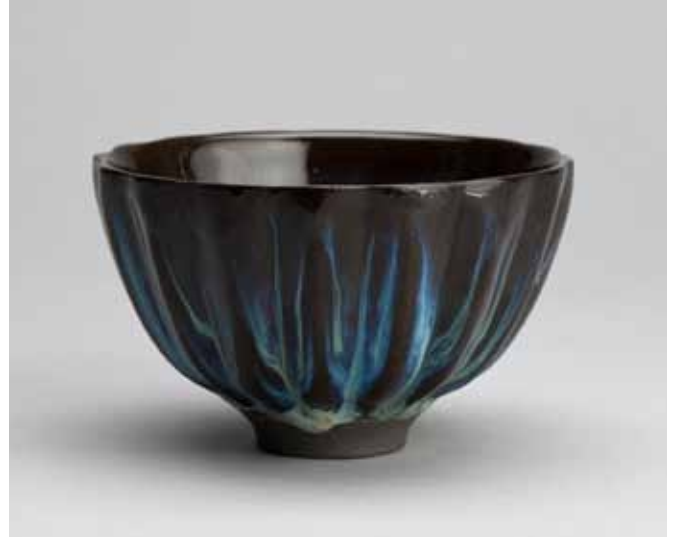
Tea bowl (chawan) Takatori glaze 3.5 x 5 x 5" HK20