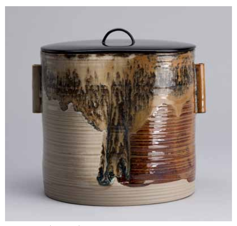
Water container (mizusashi) with lacquer lid, altered form and cylindrical handles Kakewake glaze 6.5\times7.5\times7.5^\circ XVI70