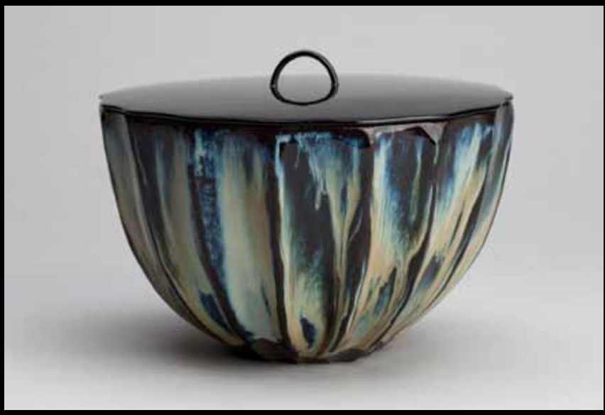
HISAAKI KAMEI Water container (mizusashi) with lacquer lid Takatori glaze 5 \times 8 \times 8 " HKI5

The public is invited to attend. The artist will be present.