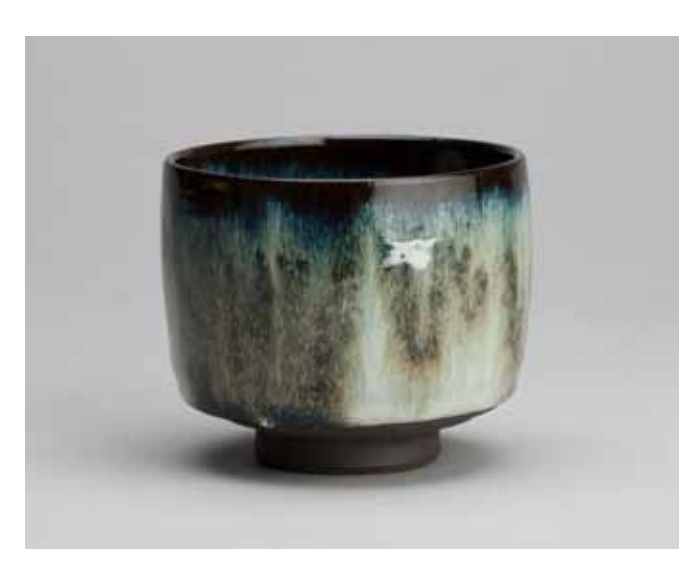
Tea bowl (chawan), tube shape 3.5 \times 4 \times 4^{\circ} HK19