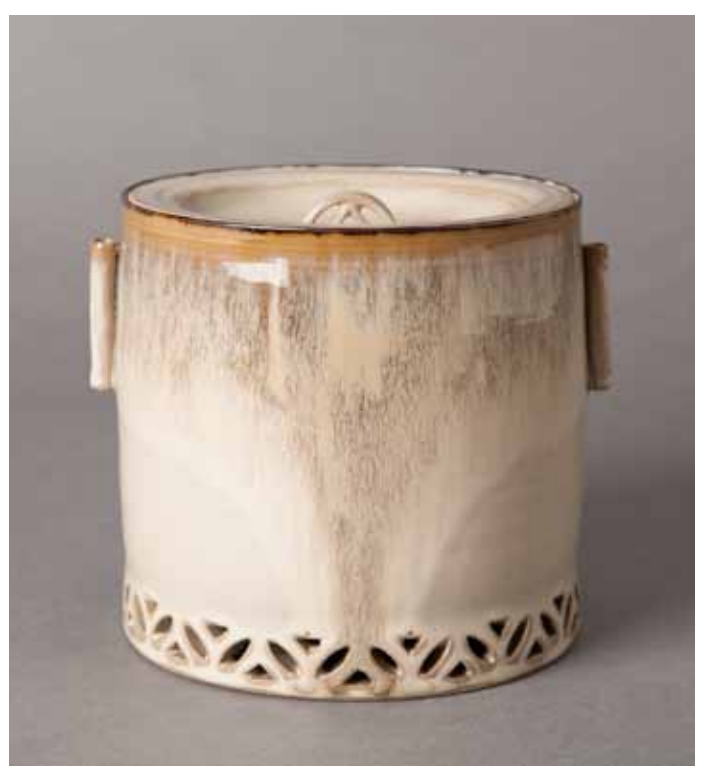
Water container (mizusashi) with stoneware lid, cylindrical handles, and shippo design openwork 6\,x\,7\,x\,6^\circ XV52