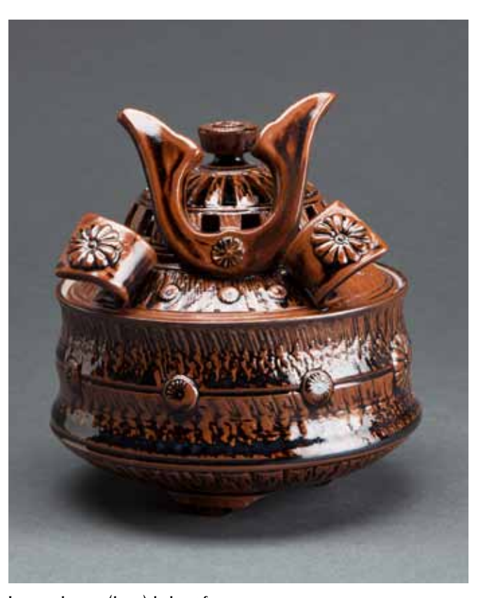
Incense burner (koro), helmet form Ame glaze 6.5 \times 5.25 \times 5.25^{\circ} XVI49