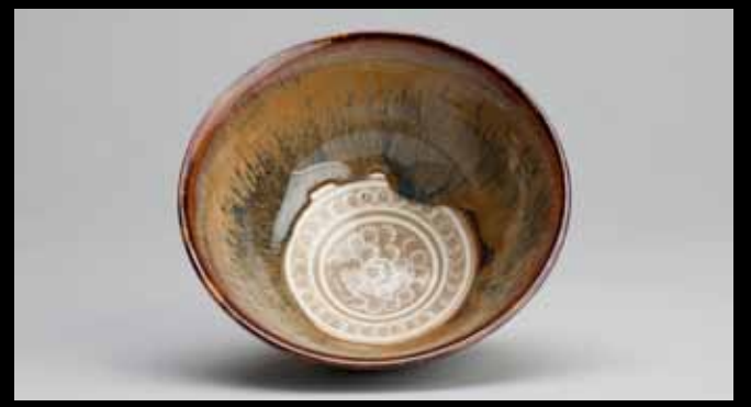
Tea bowl (chawan) Old Takatori style 2.75 x 5.5 x 5.5" XVI62