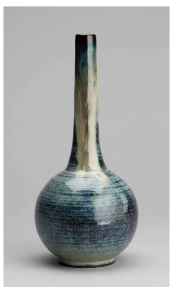
Flower vase (hanaire), turnip form 11 \times 5 \times 5^{\circ} HK12