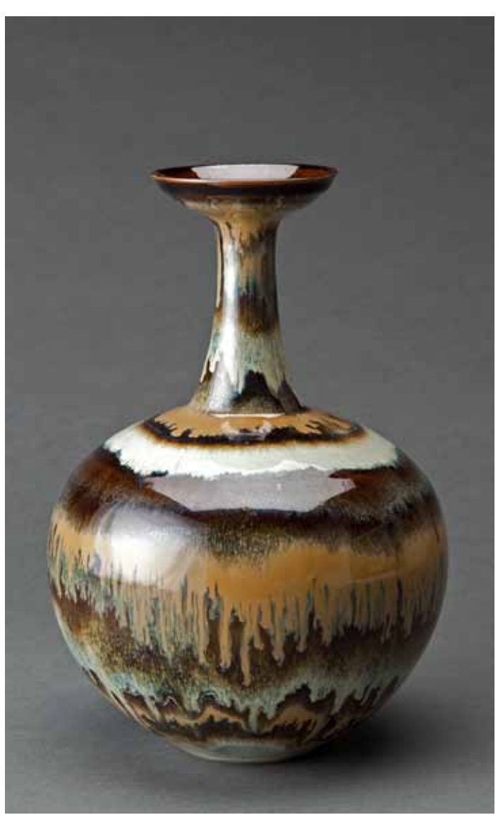
Vase Dyed glaze 11.5 x 6 x 6" XVI34