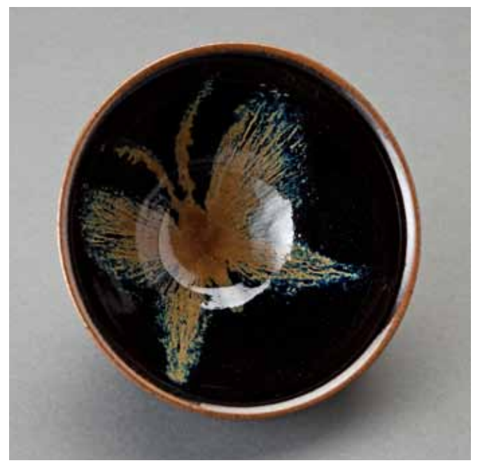
Tea bowl (chawan), butterfly decoration 3\times5\times5^{\circ} XVI4I