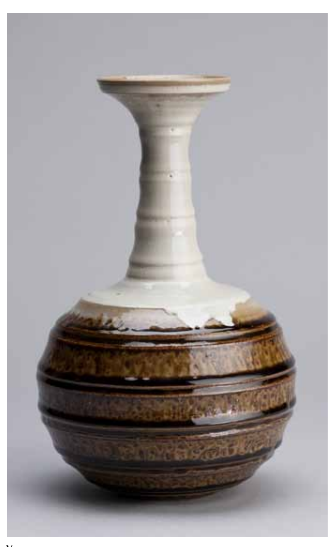
Vase Kakewake and white glazes Il \times 6 \times 6° XVI74