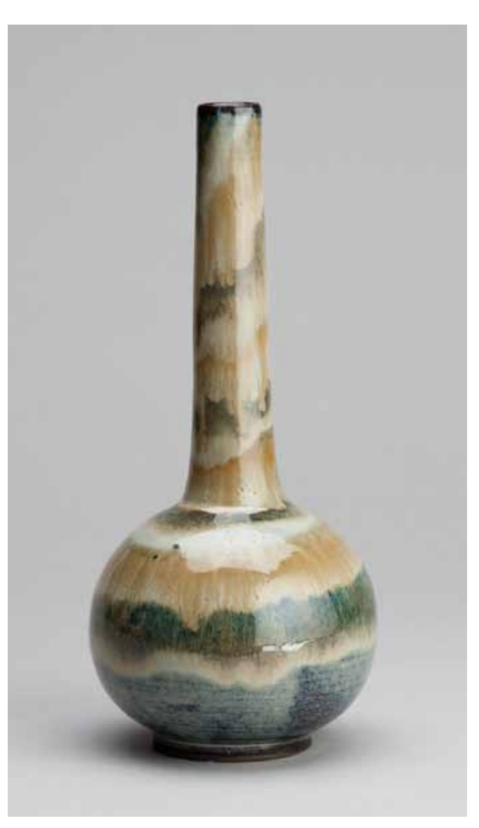
Flower vase (hanaire), turnip form Takatori glaze 10 x 4.75 x 4.75" HKII