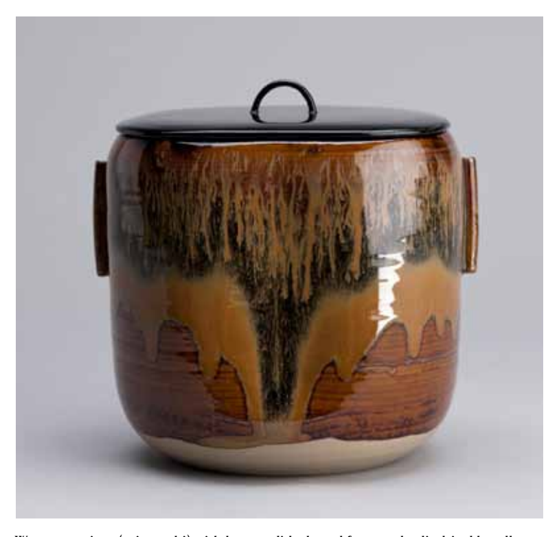
Water container (mizusashi) with lacquer lid, altered form and cylindrical handles Kakewake glaze 6.5 \times 7 \times 5.5^\circ XVI7I