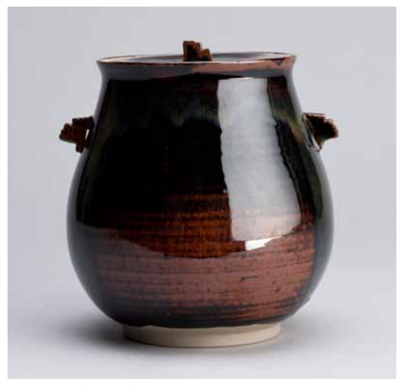
Water container (mizusashi) with ceramic lid and gingko leaf handles Kakewake glaze 7.5\times7\times7^\circ XVI68