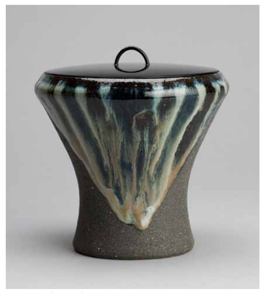
Water container (mizusashi) with lacquer lid Takatori glaze 6.5 x 6.75 x 6.75* HKI4