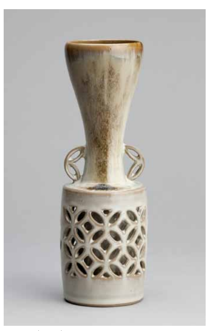
Flower vase (hanaire), shippo design open work with shippo handles White glaze 10 x 3.5 x 3.5" XVI55