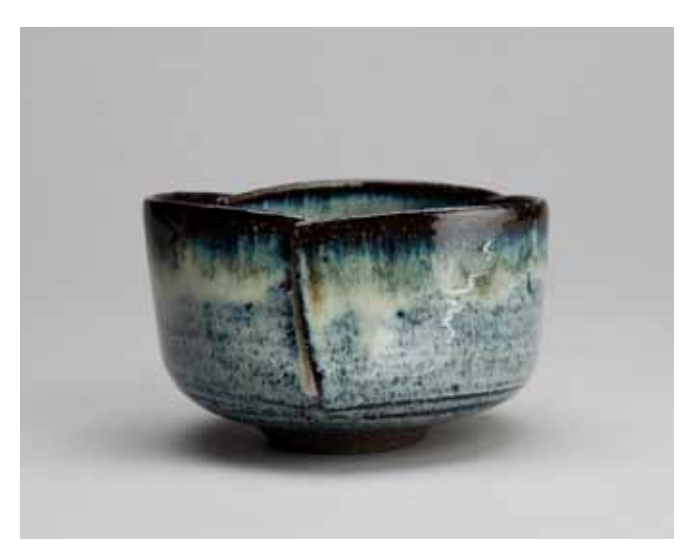
Tea bowl (chawan) with seam 3 \times 4.75 \times 4.75^{\circ} HK16