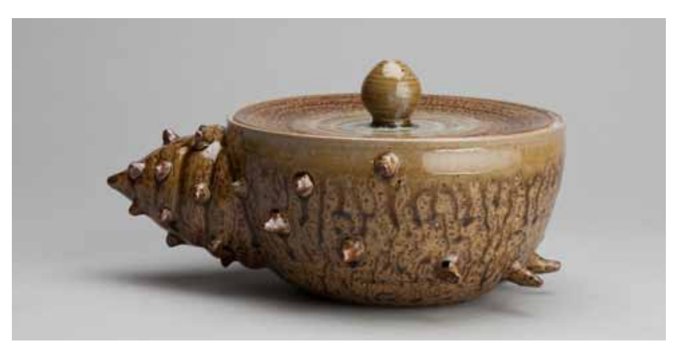
Turpon shell water container (sazae mizusashi), with stoneware lid 5.25 \times 10 \times 7.75^{\circ} XVI56