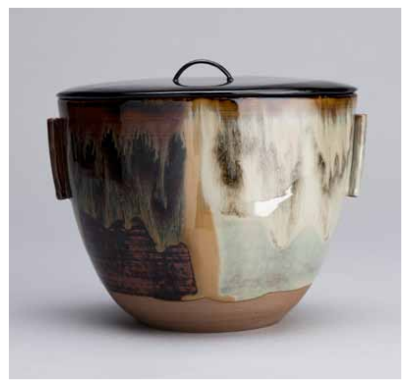
Water container (mizusashi), fan-shape form with lacquer lid Kakewake glaze 6\times8.5\times5.5^\circ XV167