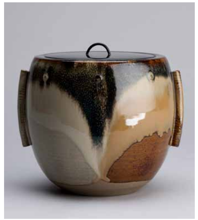
Water container (mizusashi) with lacquer lid, cylinder form and cylindrical handles Kakewake glaze 6.5 x 7.5 x 7.5' XV169