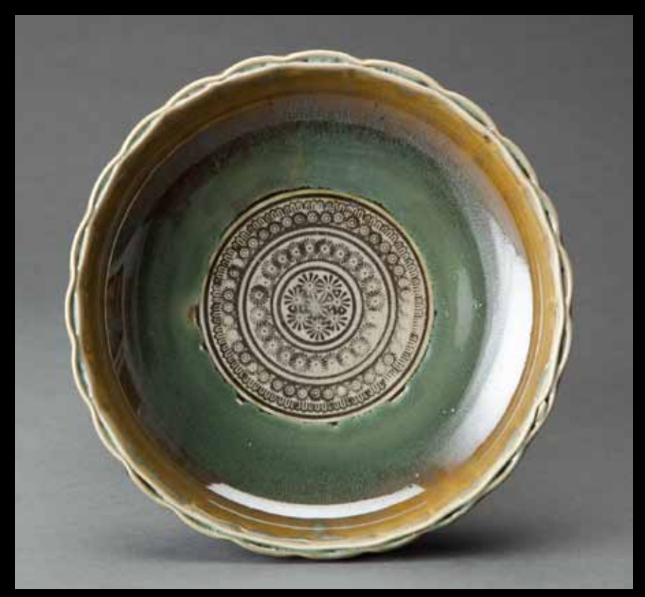
Sweets tray (kashiki) Green glaze and stamped decoration 2.25 x 9.75 x 9.75" XVI39