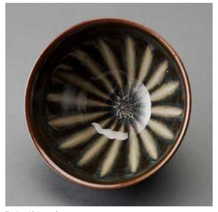
Tea bowl (chawan) Black tenmoku glaze 3 x 5.25 x 5.25" XVI43