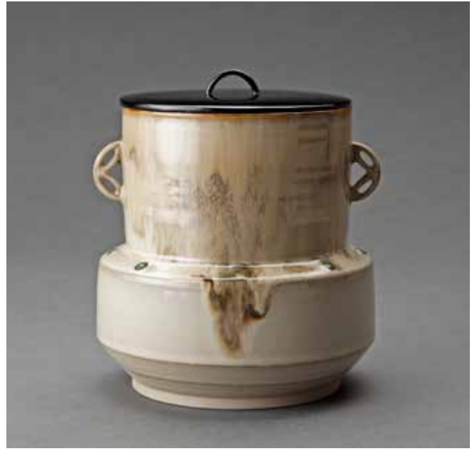
Water container (mizusashi) with lacquer lid, shippo design handles 7.5\times6.25\times6^{\circ} \times151