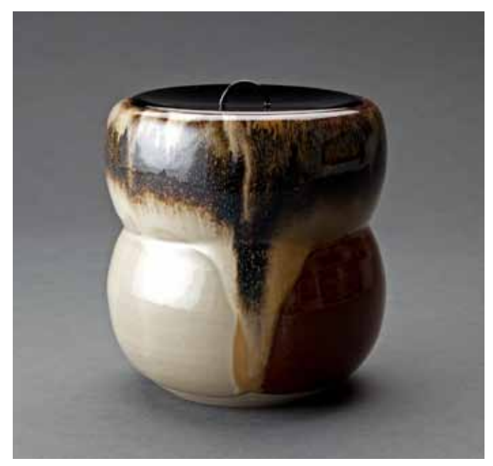
Water container (mizusashi) with lacquer lid, gourd form 7.25\times6.25\times6.25^\circ XVI53