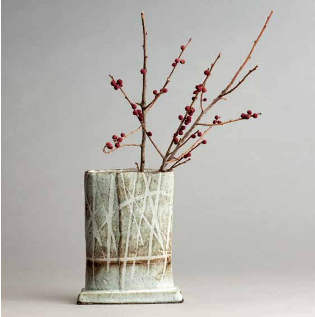
Oval Vase Dry nuka glaze over iron 7 x 6.5 x 3.5" RJ681