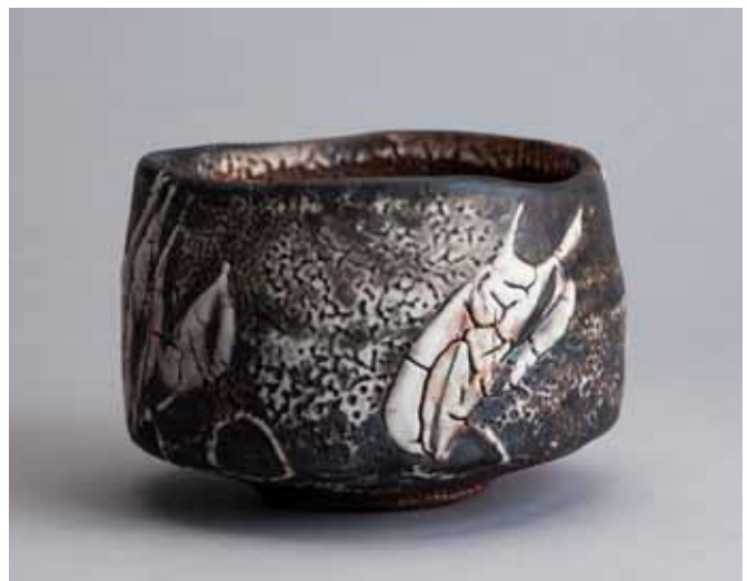
Tea Bowl Coarse shino glaze with natural ash and iron brushwork 3.5 x 4.5 x 4.75" RJ696