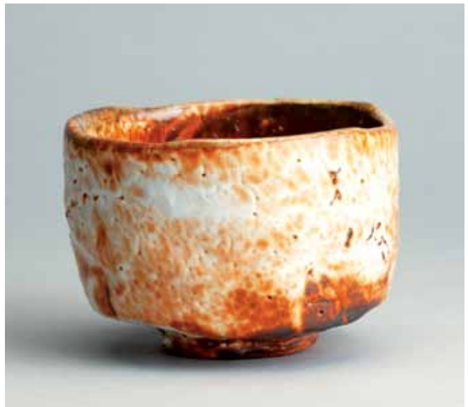
Tea Bowl Shino glaze and iron and natural ash 3.5 x 5 x 5" RJ664