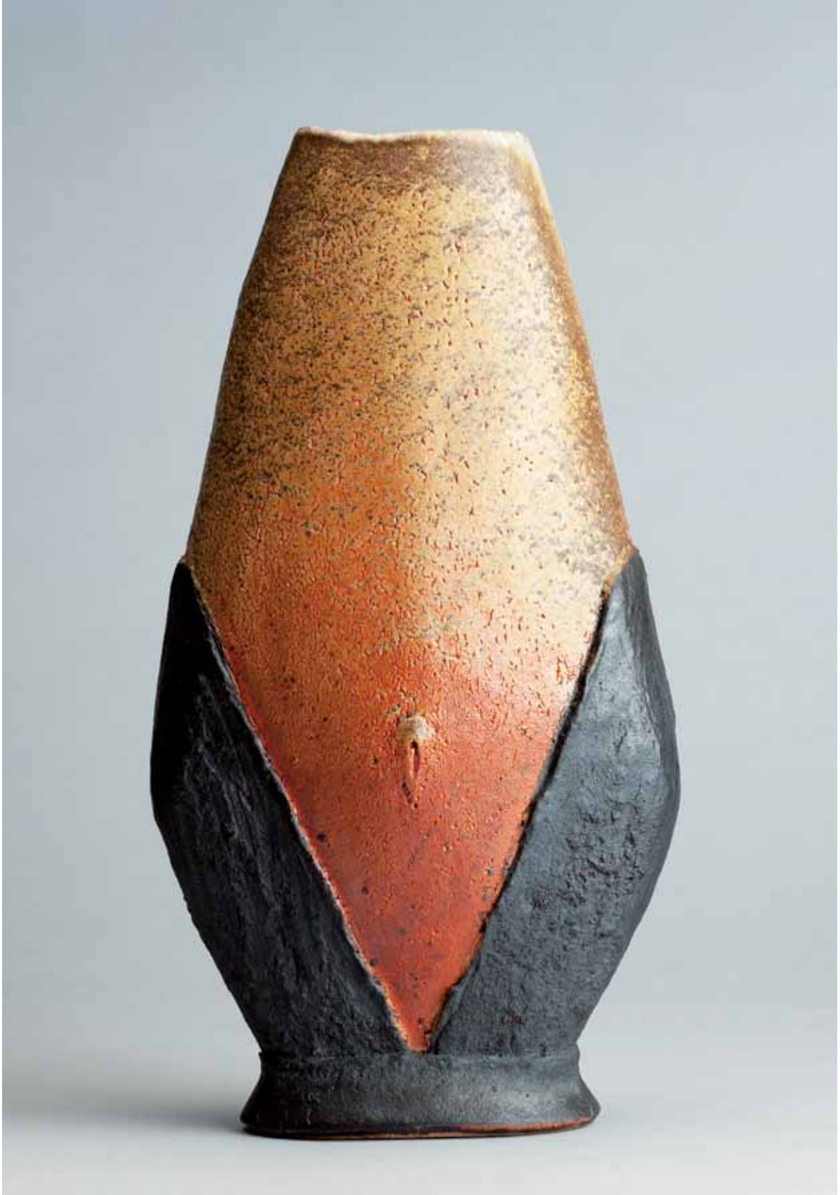
Figure Vase Shino glaze with iron and natural ash 13 x 7 x 4" RJ682