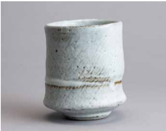
Yunomi Nuka glaze and inlaid rope impression 4 x 3.25 x 3.25" RJ697