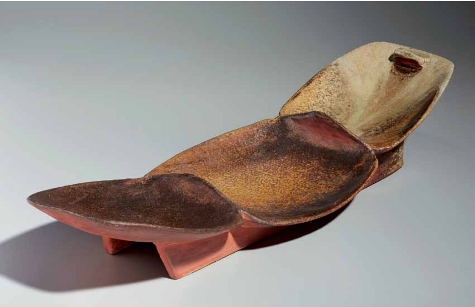
Triple Spoon Form Dish Natural ash glaze with flashing slip 4 x 21.5 x 8" RJ606