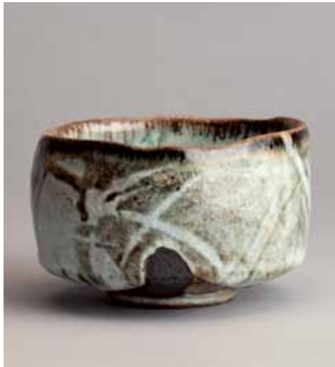
Tea Bowl Nuka glaze 3.25 x 5.75 x 5.5" RJ663