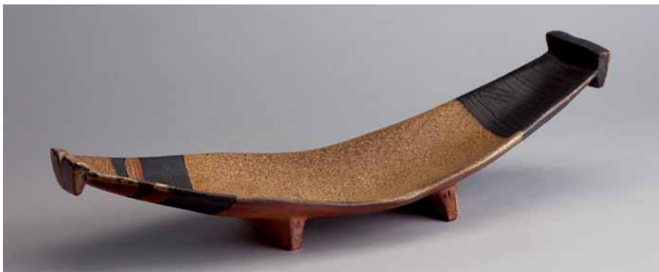
Boat Form Kaolin red slip stripe with iron man slip and natural ash glaze 6.5 x 22 x 7.25" RJ689