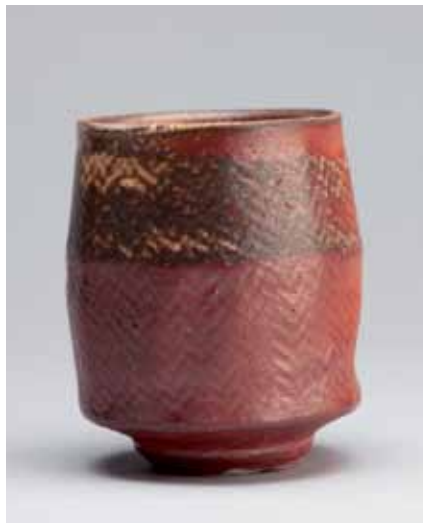
Yunomi Natural ash glaze with red kaolin slip and rope inlay 4.25 x 3.5 x 3.5" RJ658