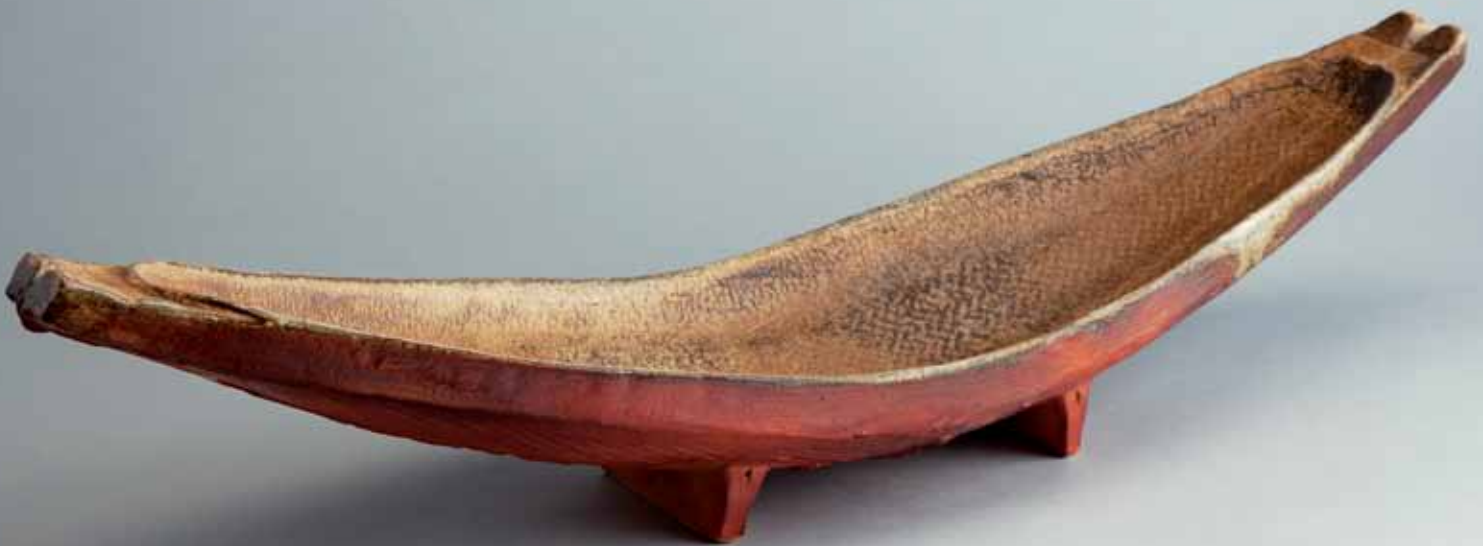
Boat Form Kaolin red slip with impressed rope pattern and natural ash glaze 7.25 x 30 x 8.25" RJ690