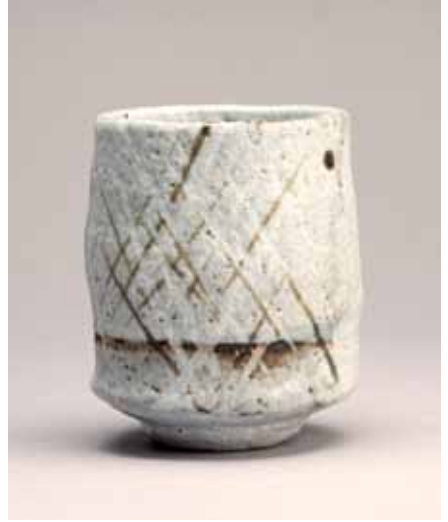
Yunomi Nuka glaze with iron brushwork 4.5 x 3.5 x 3.5" RJ655