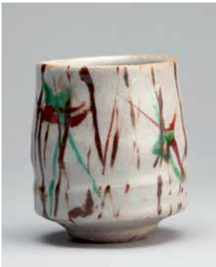
Yunomi Clear glaze with iron brushwork and red overglaze 4.25 x 3.75 x 3.75" RJ656