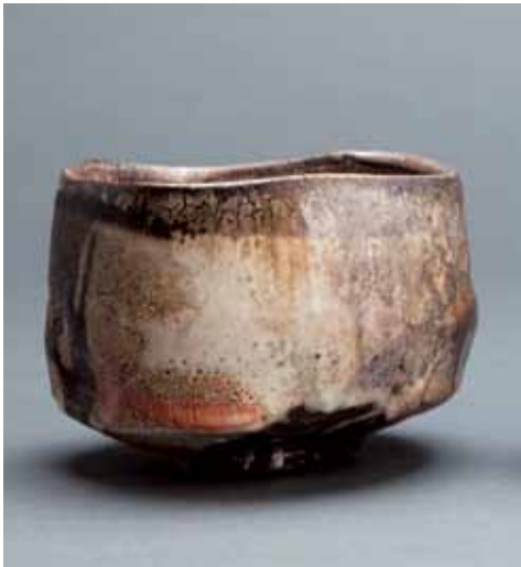
Tea Bowl Shino and anagama natural ash glaze 3.75 x 4.25 x 4.75" RJ630

The public is invited to attend. The artist will be present.