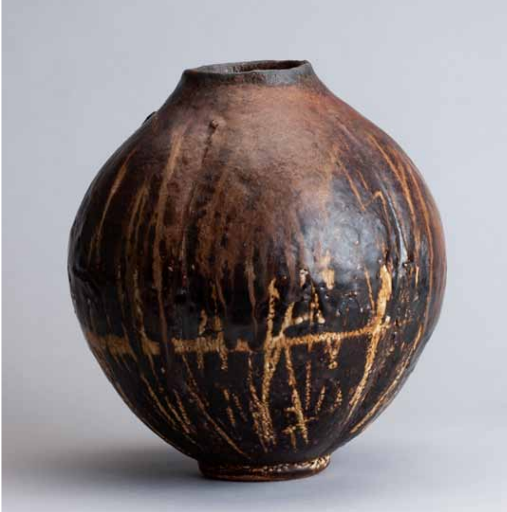
Squared Lobed Vase Crackle shino glaze with natural ash, iron slip and brushwork 12 x 10.5 x 10.5" RJ694