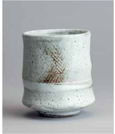
Yunomi Nuka glaze over iron herringbone impressed rope pattern 4.25 x 3.5 x 3.5" RJ671