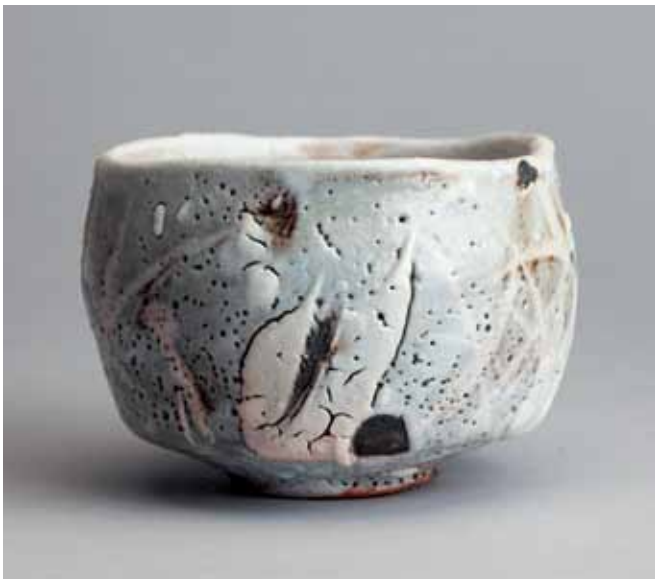
Tea Bowl Coarse shino glaze over iron 4 x 5.5 x 5.5" RJ666