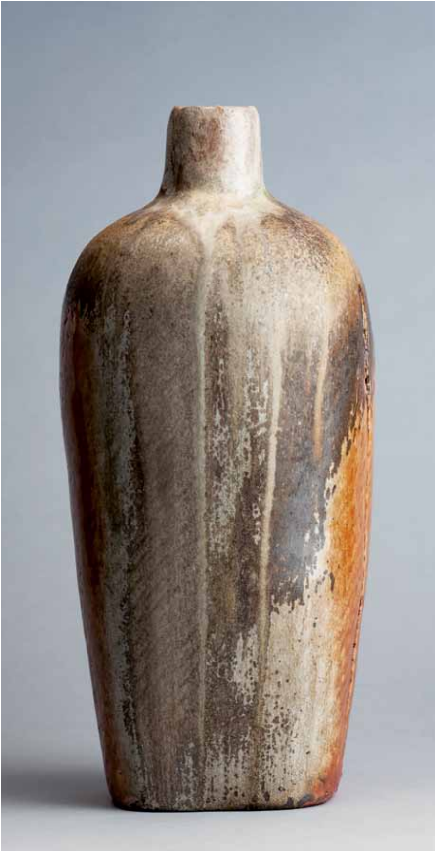
Squared Vase Shino glaze with impressed rope pattern and natural ash 15 x 5.75 x 6" RJ678