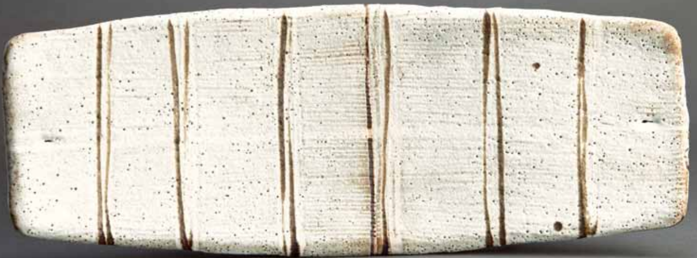
Rectangular Platter Nuka glaze with iron slip and brushwork 3.75 x 22.25 x 8.5" RJ621