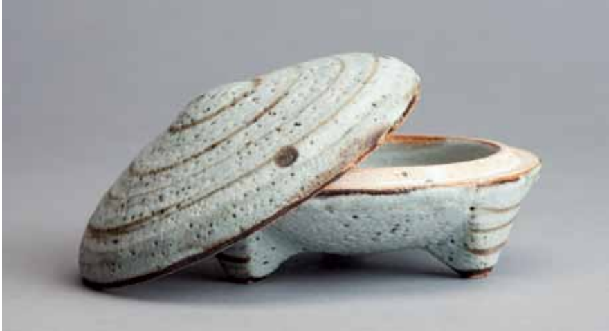
Round Covered Box Dry nuka glaze with iron 3.5 x 4.75 x 4.75" RJ685