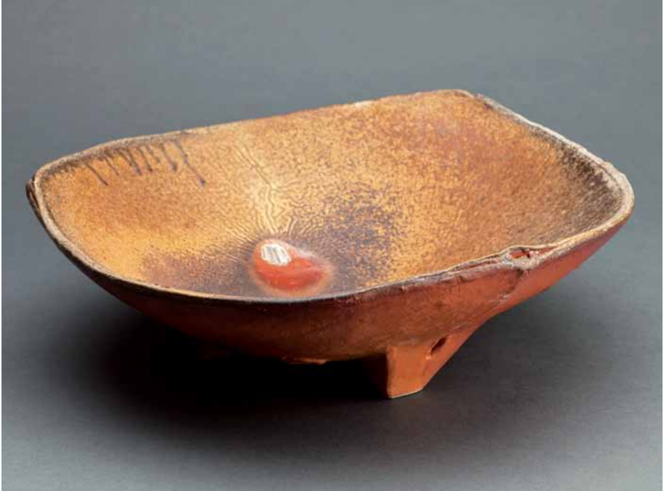
Triangulated Bowl Natural ash glaze with kaolin flashing slip 5 x 15.5 x 15" RJ618