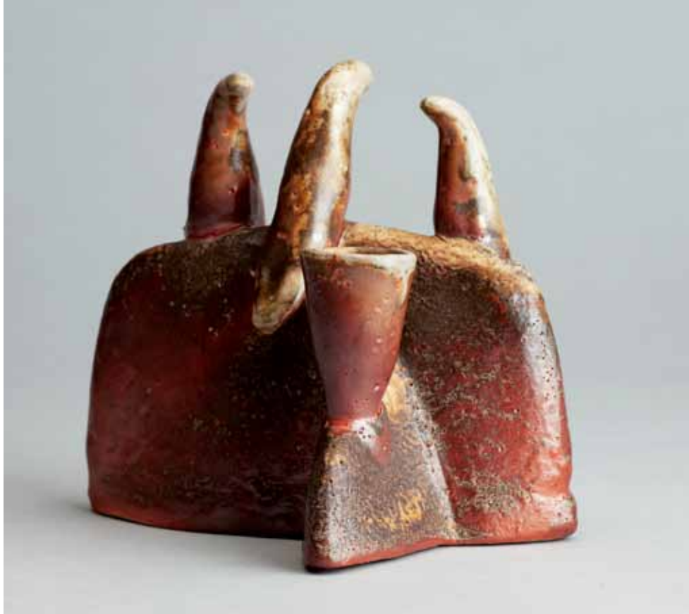
Three Bird Candle Form Kaolin glaze with red slip and natural ash 6 x 6.5 x 4.5" RJ684