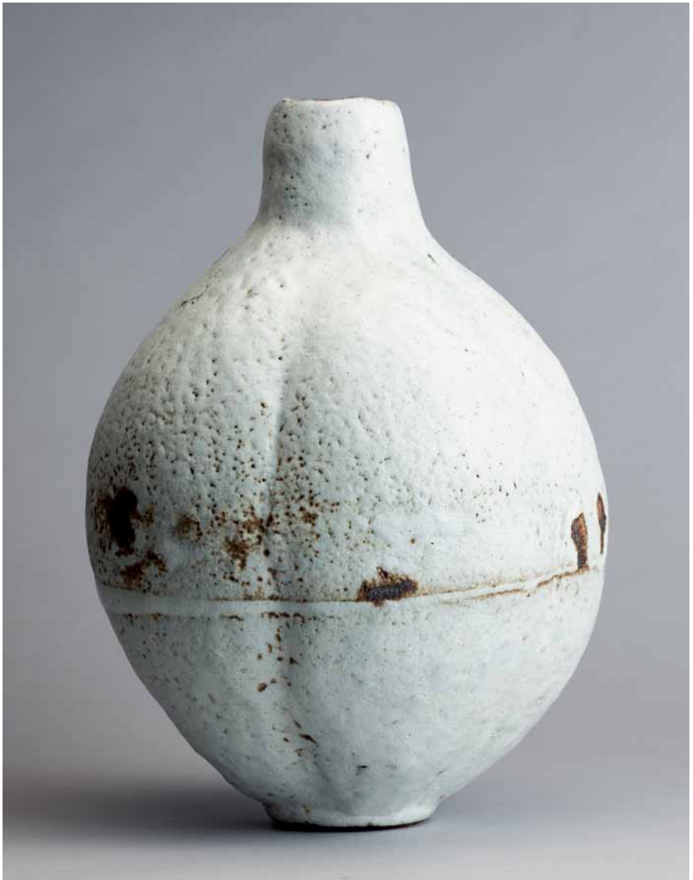
Vase Nuka and natural ash glaze 16.5 x 10 x 10.5" RJ692