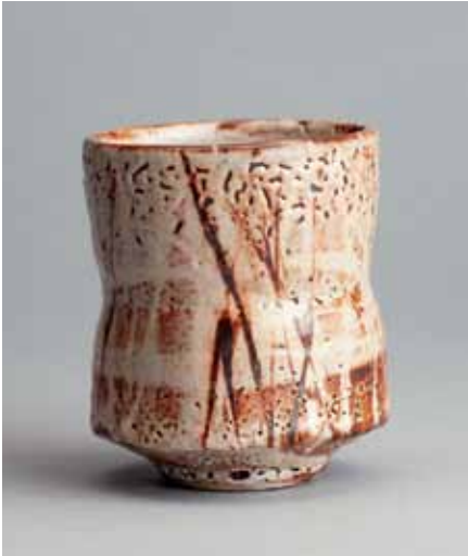
Yunomi Shino glaze and iron brush decoration 4 x 3.75 x 3.75" RJ668