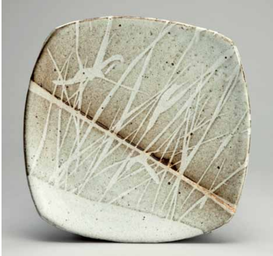
Square Cut Plate Nuka glaze with wax pattern 1 x 9.5 x 9.5" RJ644