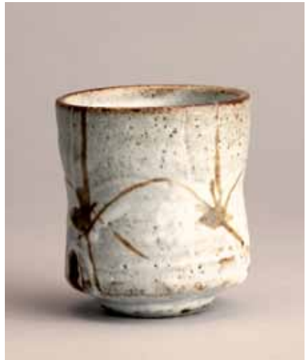
Yunomi Nuka glaze over iron brush decoration 4 x 3.5 x 3.5" RJ672