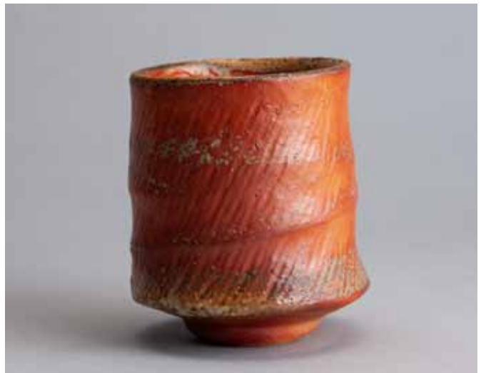
Yunomi Kaolin and natural ash glaze with flashing slip rope impression 4 x 3.25 x 3.25" RJ698