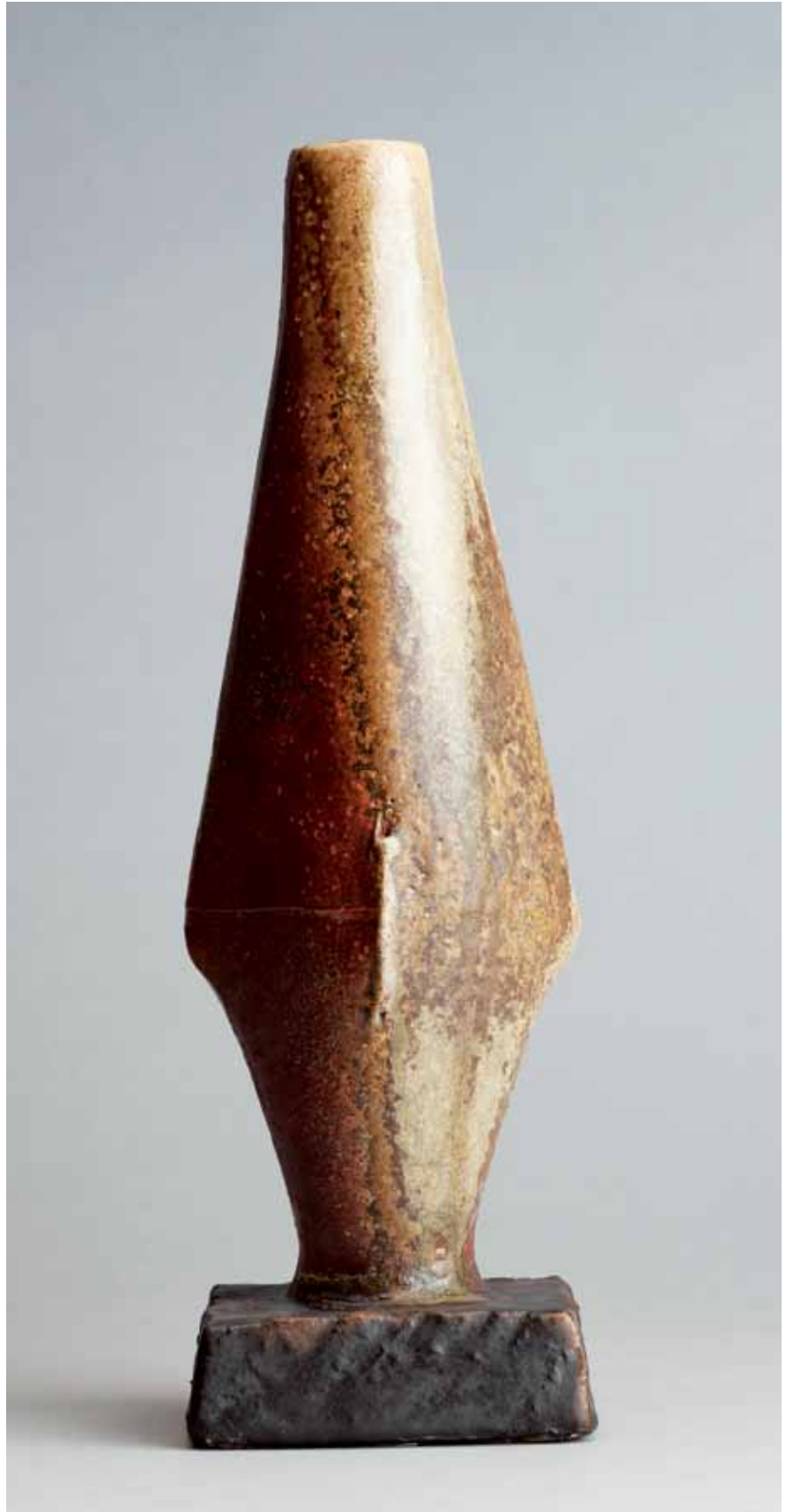
Figure Vase Kaolin glaze with red slip and natural ash 15.5 x 6 x 4.5" RJ680