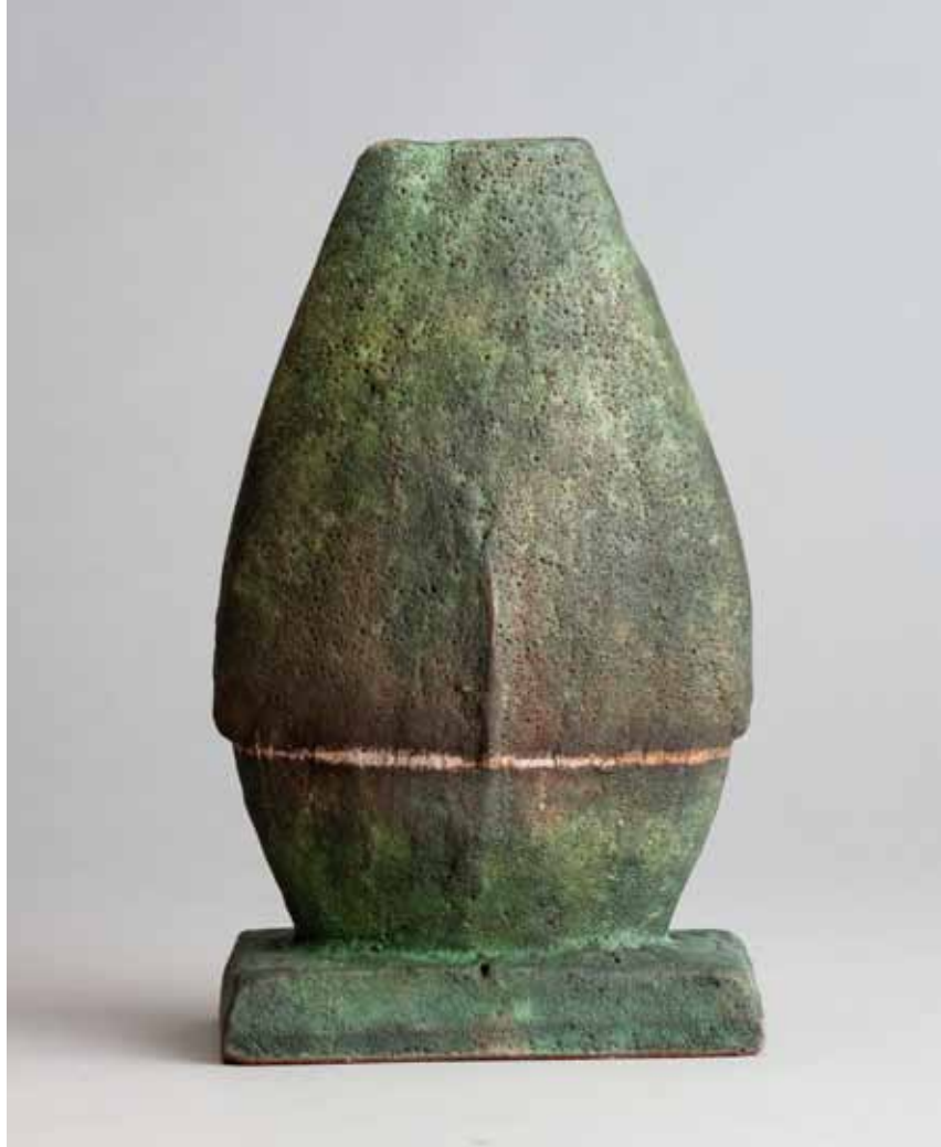
Figure Vase Copper glaze 9.5 x 5.5 x 3.25" RJ679