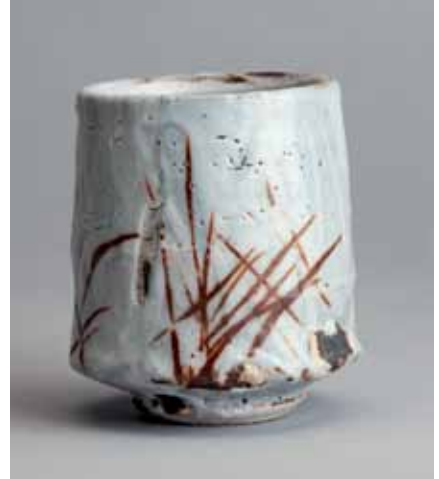
Yunomi Coarse shino glaze over iron brush decoration 4 x 3.25 x 3.5" RJ675