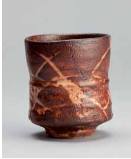
Yunomi Dry shino glaze with wax resist brushwork 4 x 3.75 x 3.75" RJ648