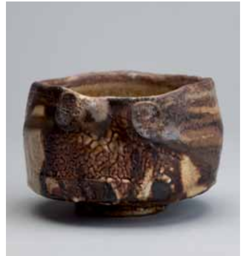
Tea Bowl Shino and anagama natural ash glaze 3.5 x 4.5 x 4.25" RJ631