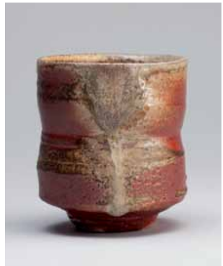
Yunomi Natural ash glaze with red kaolin slip 4 x 3.25 x 3.25" RJ662