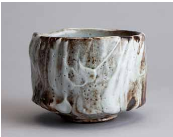
Tea Bowl Coarse shino glaze with natural ash and iron brushwork 3.5 x 4.5 x 4.5" RJ695