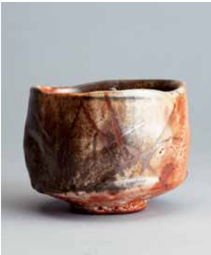
Tea Bowl Shino glaze and iron and natural ash 3.5 x 4 x 4" RJ665