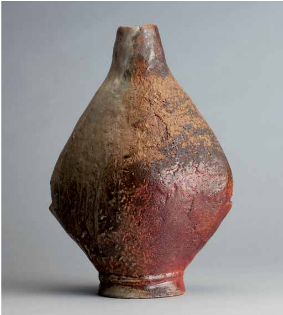
Figure Vase Kaolin glaze with red slip and natural ash 14 x 10.5 x 5" RJ683