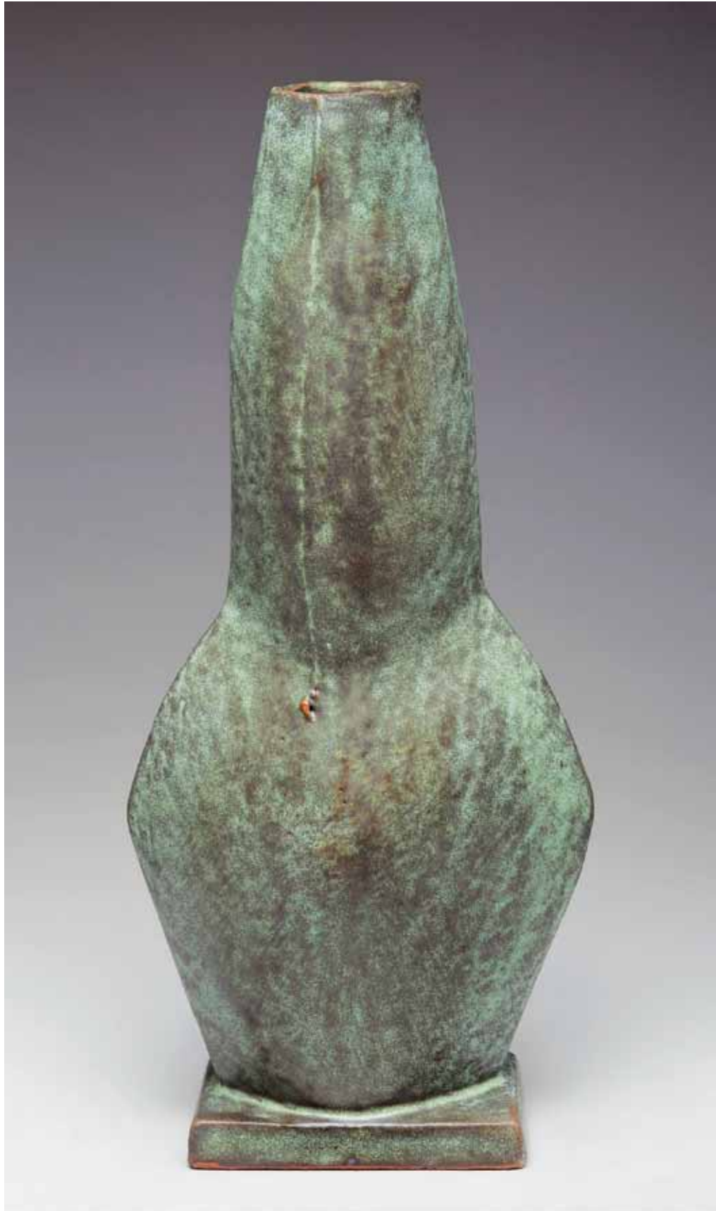
Figurative Vase Copper green glaze 19.5 x 8.5 x 6" RJ608