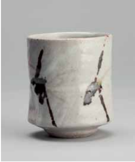
Yunomi Nuka glaze with rope pattern iron decoration 4 x 3.75 x 3.75" RJ645