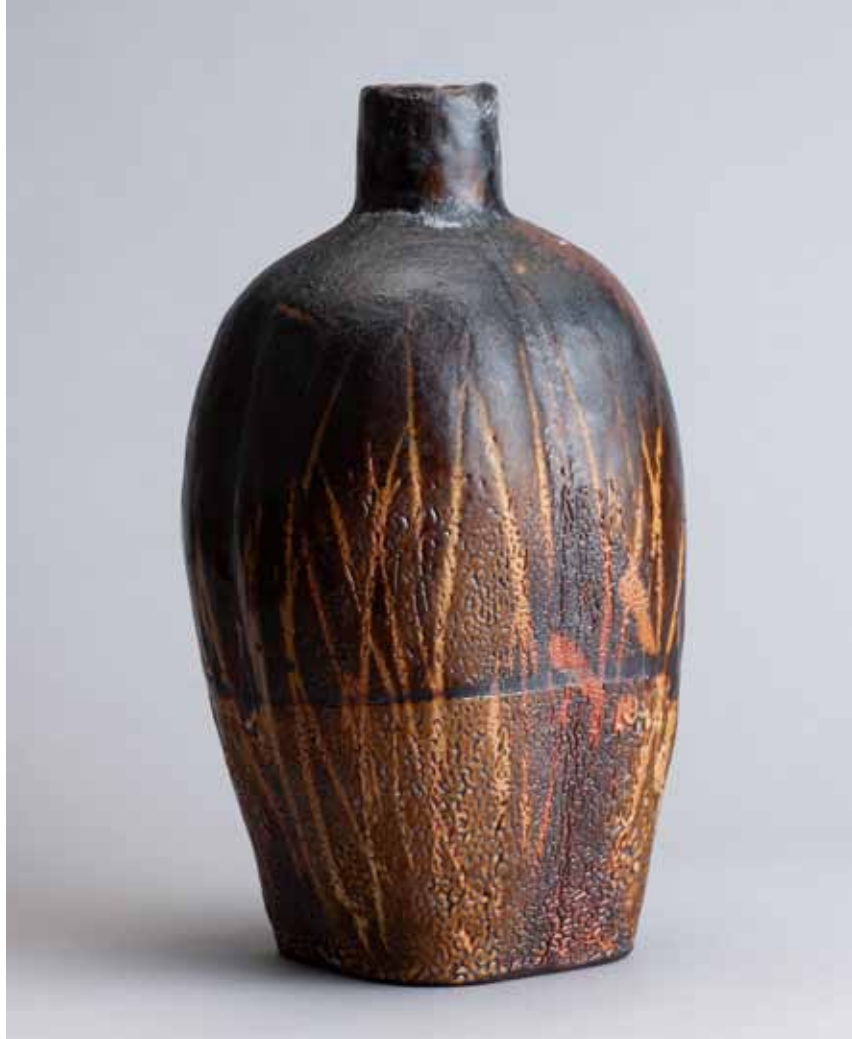
Squared Lobed Vase Crackle shino glaze with natural ash, iron slip and brushwork 14 x 6.75 x 6.75" RJ693